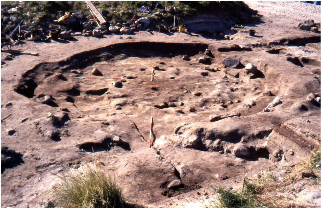
Illus 4 The floor accumulation within a roundhouse (House 1370) at Cladh Hallan.

The depth and quality of stratigraphy in these settlement mounds is their most important feature. Unlike the largely eroded, ploughed and truncated sites of mainland Britain, these small 'tells', with their long chronological sequences, are a remarkable archaeological survival (a potential first appreci-