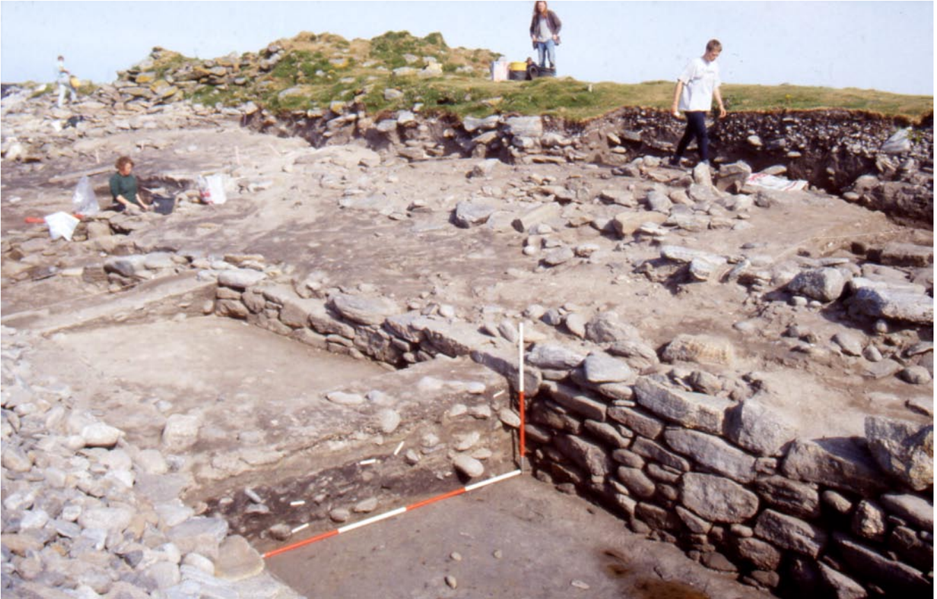
Illus 6 Excavating waterlogged deposits (foreground) at the broch of Dun Vulcan, South Uist.

materials can provide useful information, especially on the natural environment, not otherwise available from the machair settlements. As a result, palaeoecological sampling sites are often close to contemporary archaeological sites on the machair, thereby providing a better insight into the impact of human activity on landscape change.