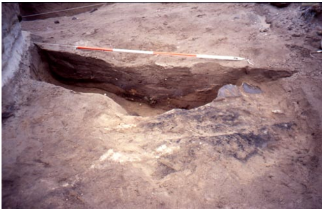
Illus 5 The fill within a pit (Pit 2508) at Cladh Hallan, exhibiting clearly differentiated layers in machair sand.

The visual discrimination of different layers within machair sites can be exceptionally fine, although it can become impossible in dry conditions. Sections through archaeological sequences are often a riot of colours – red, orange, yellow, brown, grey, black – as each layer, however thin, can be picked out with