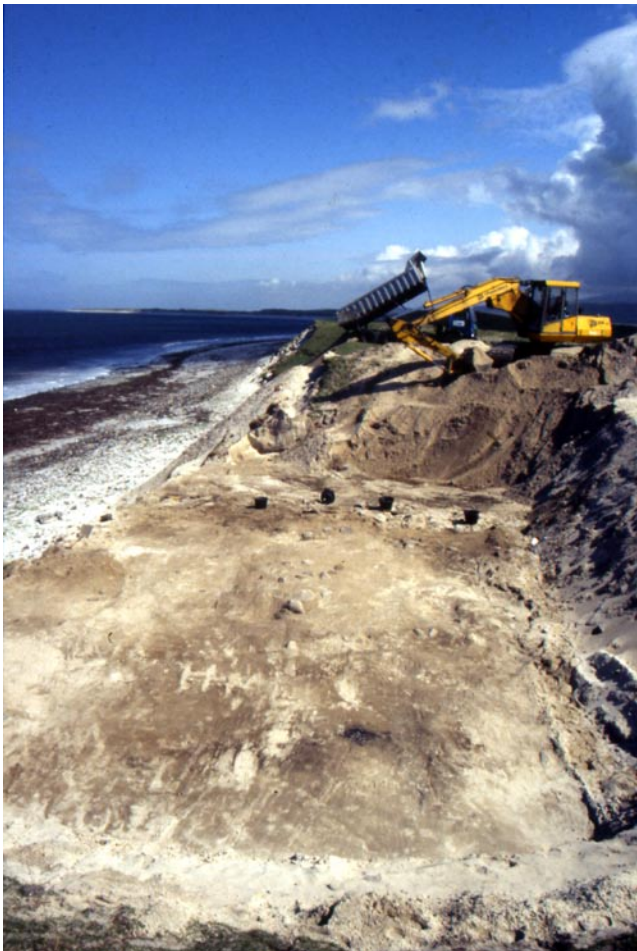
Illus 2 The Norse settlement of Cille Pheadair during excavation. Exposed by the sea in 1992, it has since been almost entirely washed away.

Programmes of gassing and eradication of rabbits are the only way forward if this new threat is to be halted (unless they once again become a human