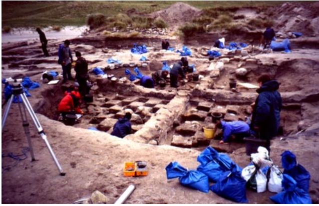
Illus 9 Flotation sampling in 0.5m squares of house floors and yard surfaces at Cladh Hallan, South Uist.

were patched and relaid, with one example from the Norse period at Cille Pheadair incorporating artefactual and ecofactual material within the matrix before it was laid. The patterning of materials is also affected by sweeping, although the distinctive distributions left by sweeping are not found before the Norse period. We assume that, previously, rubbish was removed by hand.