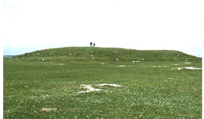
Illus 3 Rabbit damage of machair settlement mounds is extensive. White sand marks the locations of burrows into a prehistoric mound at Machair Meadhanach, South Uist.