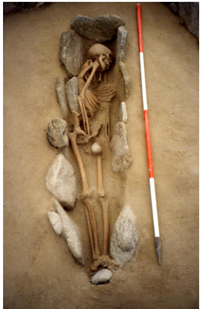
Illus 7 A Pictish-period skeleton buried under a cairn at Cille Pheadair.

In the Pictish period (AD 400–900) the settlement pattern was largely unmodified, with new settlements placed in close proximity to old ones or even reusing Iron Age dwellings (Mulville et al 2003). The reduction in house size and the emphasis on bodily adornment and presentation (Sharples 2004) suggest a growing involvement in long-distance social networks. It may be significant that the only Pictish burial from this period in South Uist (at