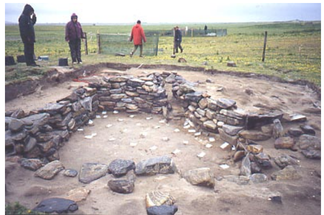
Illus 8 Phosphorus, nitrogen and magnetic susceptibility sampling on a 0.5m grid within a late Norse barn at Bornais, South Uist.

Unlike houses in the Northern Isles, those of the Western Isles’ machair have little in the way of stone ‘furniture’ or flooring. Often the mixed peat and sand floor layer is sealed beneath a fill of windblown sand, sometimes with an organic layer of decayed roof turfs and other vegetal matter lying between the floor and the clean sand (or interleaved with it). There may also be materials which have been left on the floor’s surface, that are separate from the micro debris that has become incorporated into the floor matrix. To complicate matters further, floors