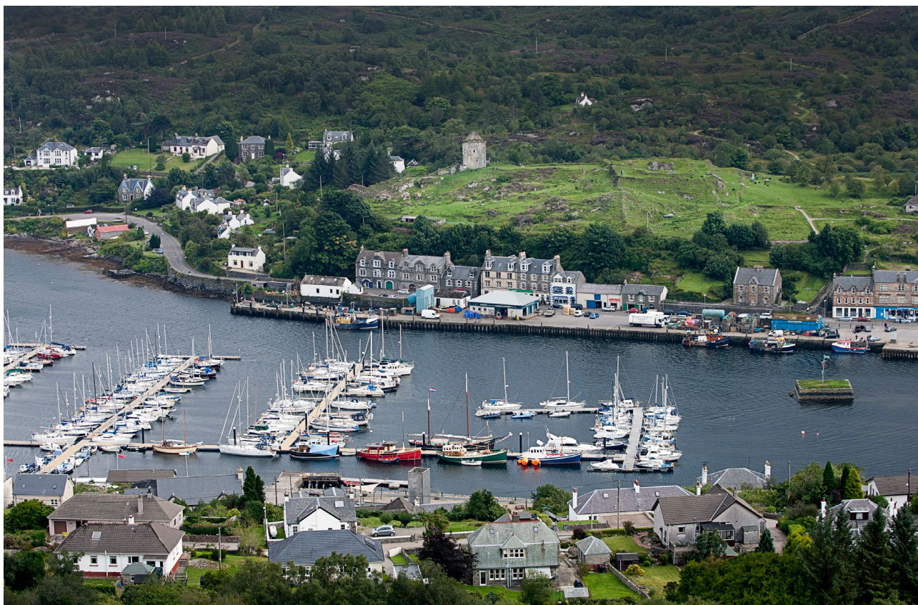
Illus 4 Tarbert Castle from north above Tarbert Harbour