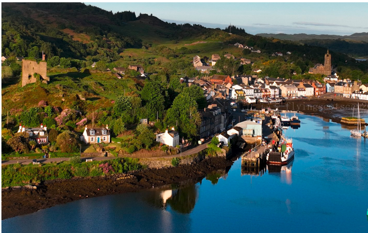
Illus 5 Tarbert Castle above West Loch Tarbert with East Loch Tarbert at top right from northwest (©flyingscotscan2024)