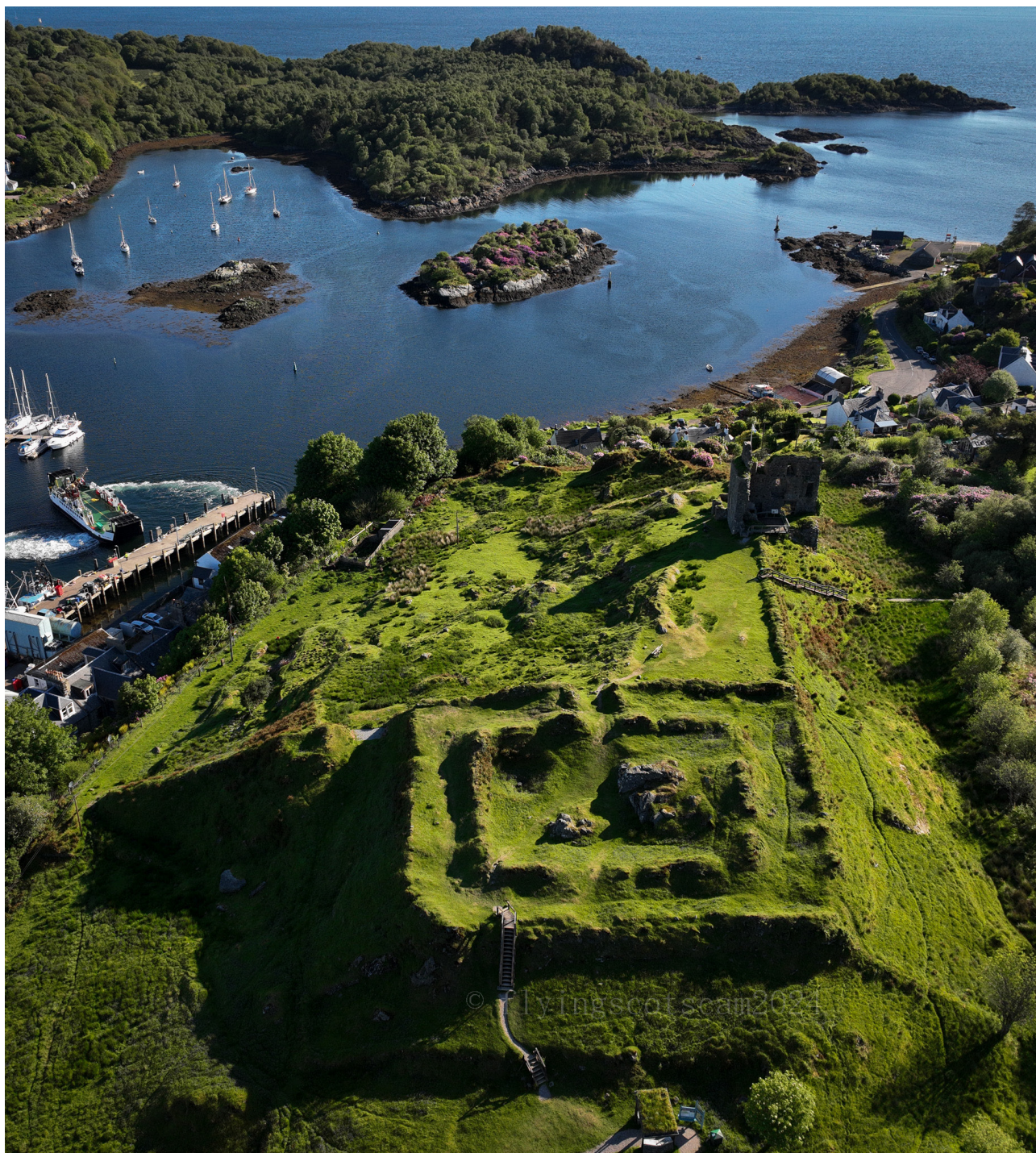
Illus 3 Tarbert Castle from southwest above

The main nucleus of the Castle is formed by a rectangular enclosure, the Inner Bailey which occupies the highest outcrop on the ridge; the lower ridges are enclosed by a curtain wall, the Outer Bailey including a Tower House at the west. Prior to