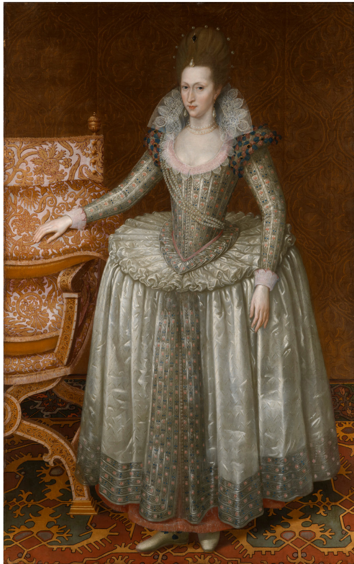
Illus 4 Portrait of Anne of Denmark (c 1605–10).