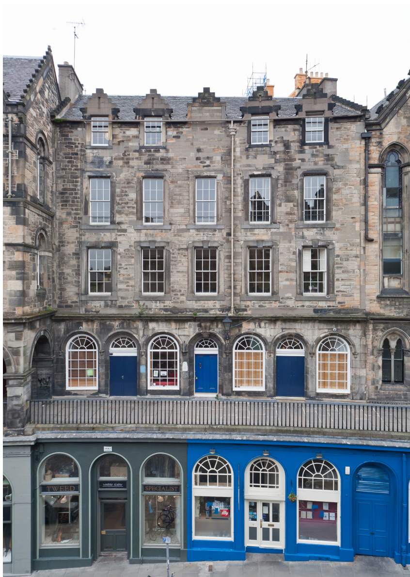
Illus 11 View of the new rear façade of Riddle's Court onto Victoria Street following demolition of the backland properties.

its conversion into student accommodation. Patrick Geddes (1854–1931) was a Scottish biologist, sociologist, geographer and philanthropist, who was best known for his innovative thinking in the field of urban planning (Illus 12).