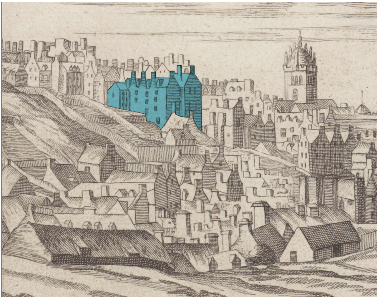
Illus 7 Extract from John Slezer's 1693 depiction of 'The southside of the Castle of Edinburgh'.