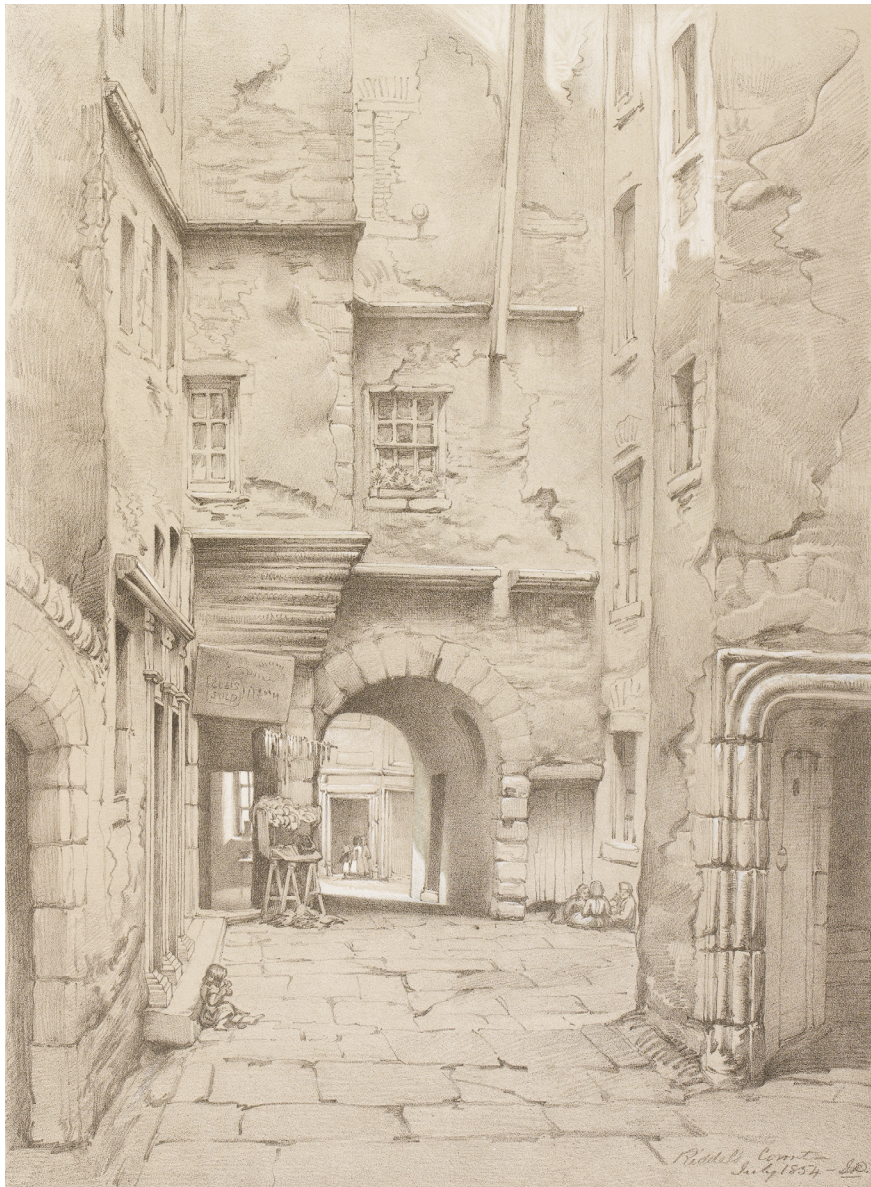
Illus 10 Sketch of Riddle's Close by Drummond in 1854 of the demolished tenement on the left-hand side and the still surviving corbelled doorway and arch into Riddle's Court.

backlands were redeveloped with brick industrial buildings.