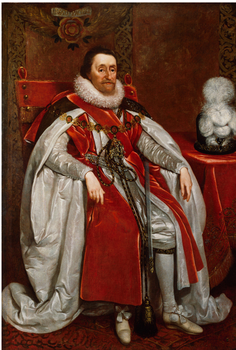
Illus 5 Portrait of King James VI of Scotland (1621).