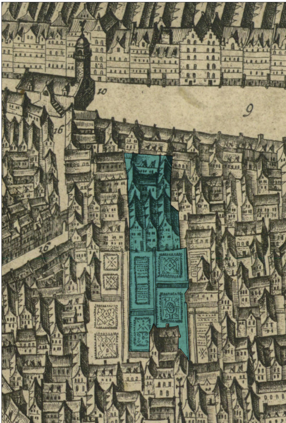
Illus 8 Extract from James Gordon's Plan of 1647 showing extent of Riddle's Court and its formal gardens to the south. (Reproduced with the permission of the National Library of Scotland)