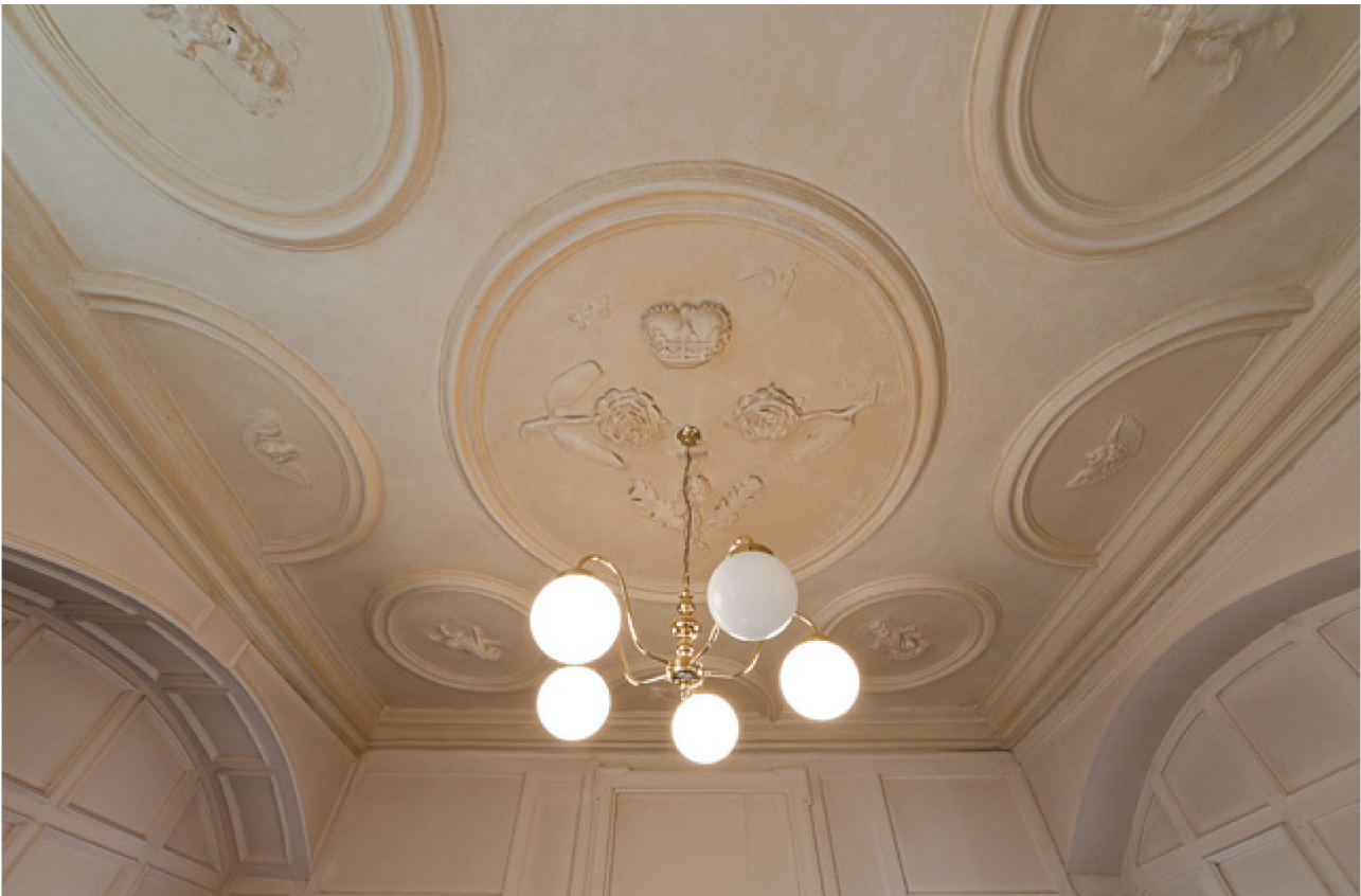
Illus 6 Plaster rose in Room S03.

Roderick Mackenzie owned the tenement and were subsequently demolished during the construction of Victoria Street. A contemporary view of the buildings was produced by Slezer in 1693 (Illus 7).