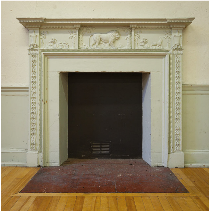
Illus 9 Italian marble fireplace purchased by Duchess Anne of Buccleuch.

were employed. The accounts also provide excellent evidence that wood was occasionally recycled during the various renovation processes. 20