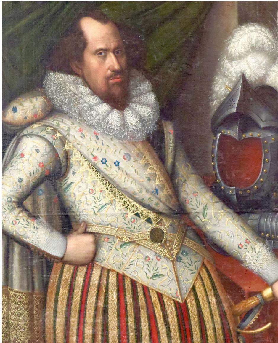
Illus 3 Portrait of the Duke of Holstein.

In 1598 the property hosted two banquets in quick succession for the Duke of Holstein, the son