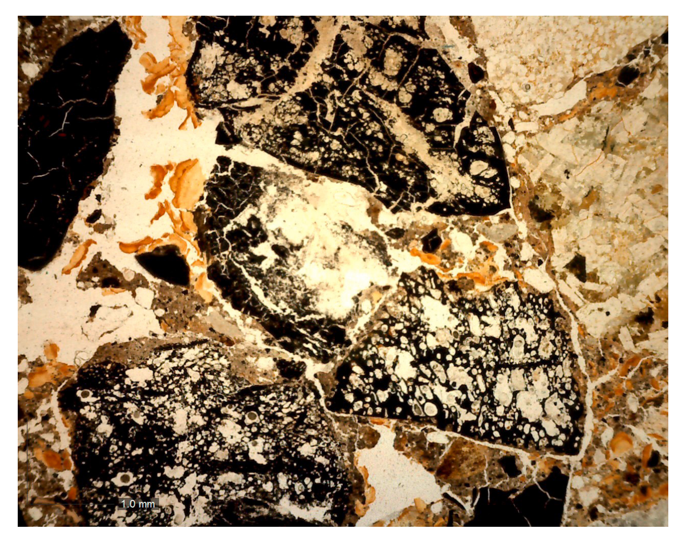
Illus 82 Vesicular melted charred materials - possible coal

of the soil surface (levelling, digging, trampling) necessary for charcoal burning would generate a periodic long-term bare surface conducive to dusty clay coating and intercalation formation. Marked iron and manganese staining within the upper unit indicates the context to be a relatively poorly drained soil, high in organic matter and affected by some groundwater gleying. These characteristics are indicative of podsol formation and also indicate that the site was located within an open vegetated area in damp conditions