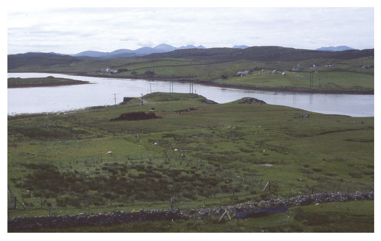
Illus 2 General view of Calanais Fields study area