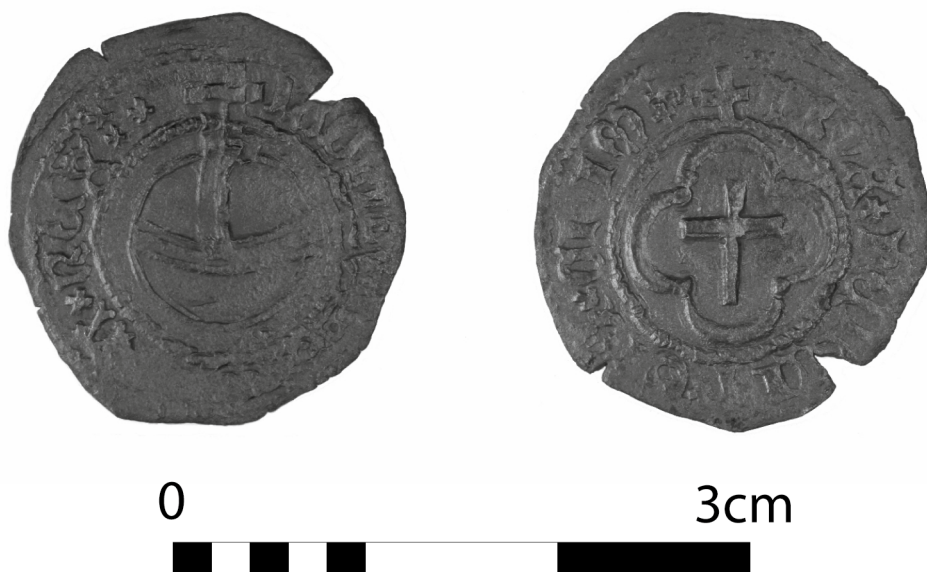
Illus 29 Coin of James II–III, SF140, Context 124

Traces of clay were found within the stamp, suggesting it may have been used on pottery. However, this seems unlikely for several reasons. Pottery was a relatively lowly craft, generally conducted outside the burghs due to considerable fire risk and the need for access to raw materials. Pottery stamps are simpler and more crudely executed and were probably made of wood or bone.