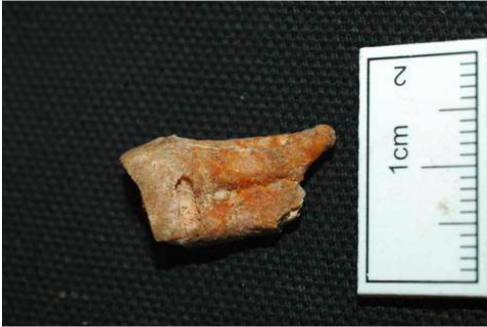
Illus 10 The caries and dental pearl enamel at maxillary left M2.