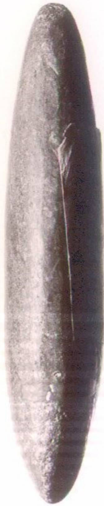
ILLUS 2 Stone axe from Pennan Hill ( Birmingham City Museum )