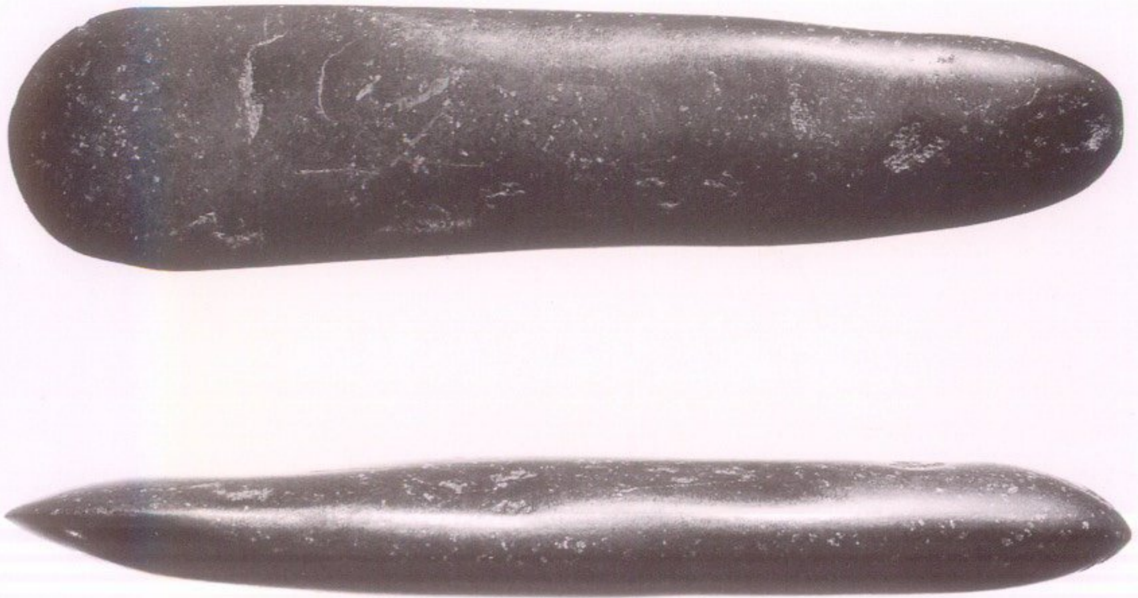
ILLUS 4 Polished stone axe from Unst ( Birmingham City Museum )