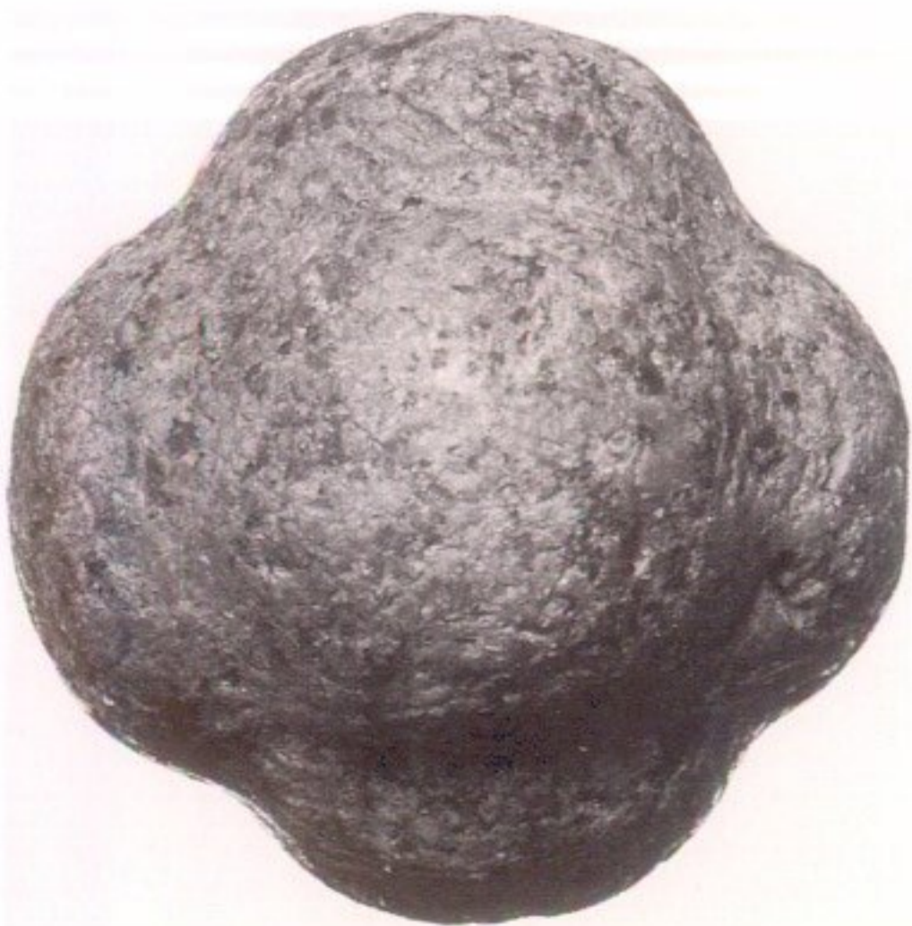
ILLUS 3 Carved granite ball, Aberdeenshire(?) ( Birmingham City Museum )