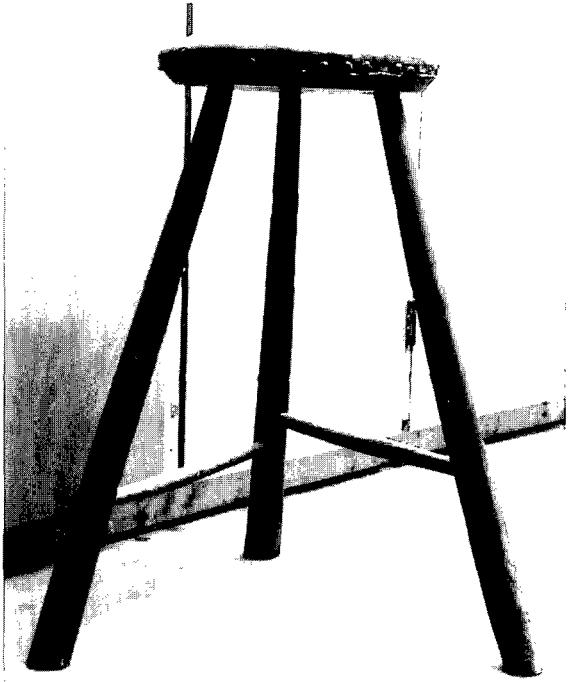
ILLUS 7 Stool, Incorporation of Wrights, Perth, 18th century. Elm; H: 690 mm, W: 560 mm, D: 560 mm. (Perth Museum and Art Gallery)

scrollwork was most probably added to the top. 3 Other parts of the bill can be explained as follows. The Scots ell was 37 in (945 mm) in length; six ells, therefore, represent 5.67 m. Dippor web was probably linen webbing to go under the seat and tyking a tightly woven cotton or linen fabric. Takets are simply tacks and the pasband probably a flax or jute material used underneath the outer layer of leather. The 'Russian' leather used at the front was a plain-surfaced, high-quality leather. Workmanship on the frame, including the carving, would be included in the basic item of £24.