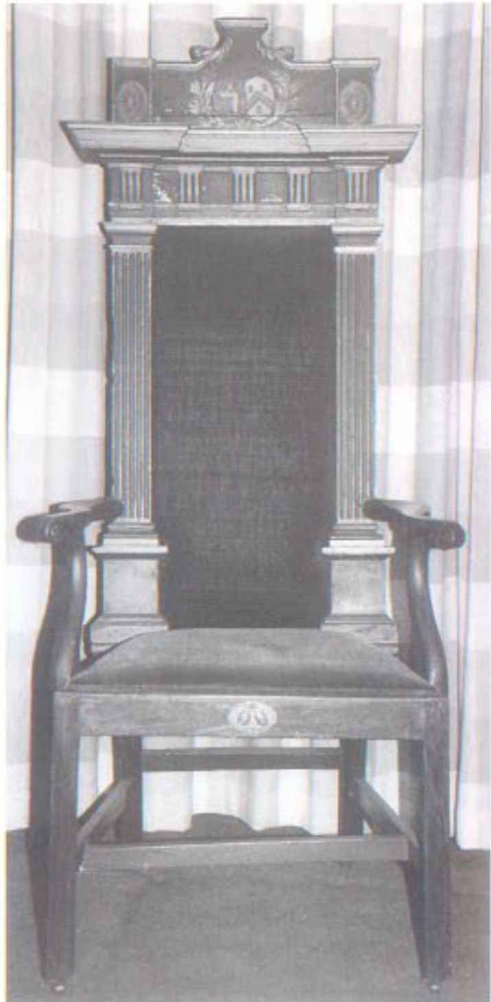
ILLUS 11 Deacon's chair, United Incorporation of Wrights & Masons of Edinburgh, 18th century. Beech with painted decoration; H: 1675 mm, W: 635 mm, D: 500 mm. ( Incorporated Trades of Edinburgh )

immediate comparison is suggested with certain English masonic chairs (Hewitt 1967, 137). It is tempting to think that the same chair was used by Lodge of Edinburgh (Mary's Chapel) No 1, which also met there. Yet the painted decoration, which includes the arms of both wrights and masons, suggests that the chair was used primarily for ordinary Incorporation business.