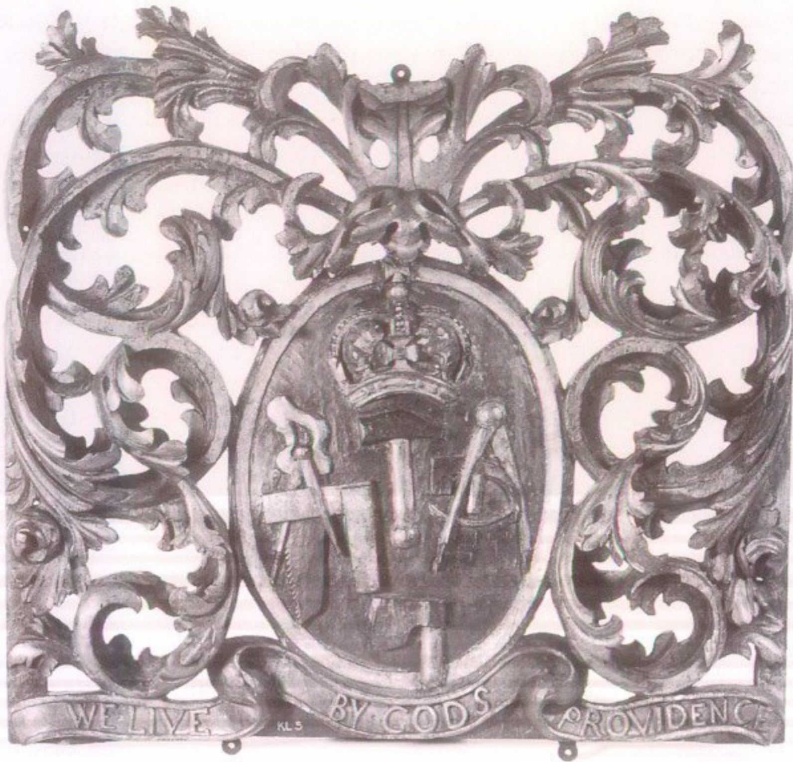
ILLUS 1 Incorporation of Hammermen's church loft panel, Dalkeith, second half of 18th century. ?Oak; H: 770 mm, W: 830 mm. (Trustees of the National Museums of Scotland (Accession KL5))