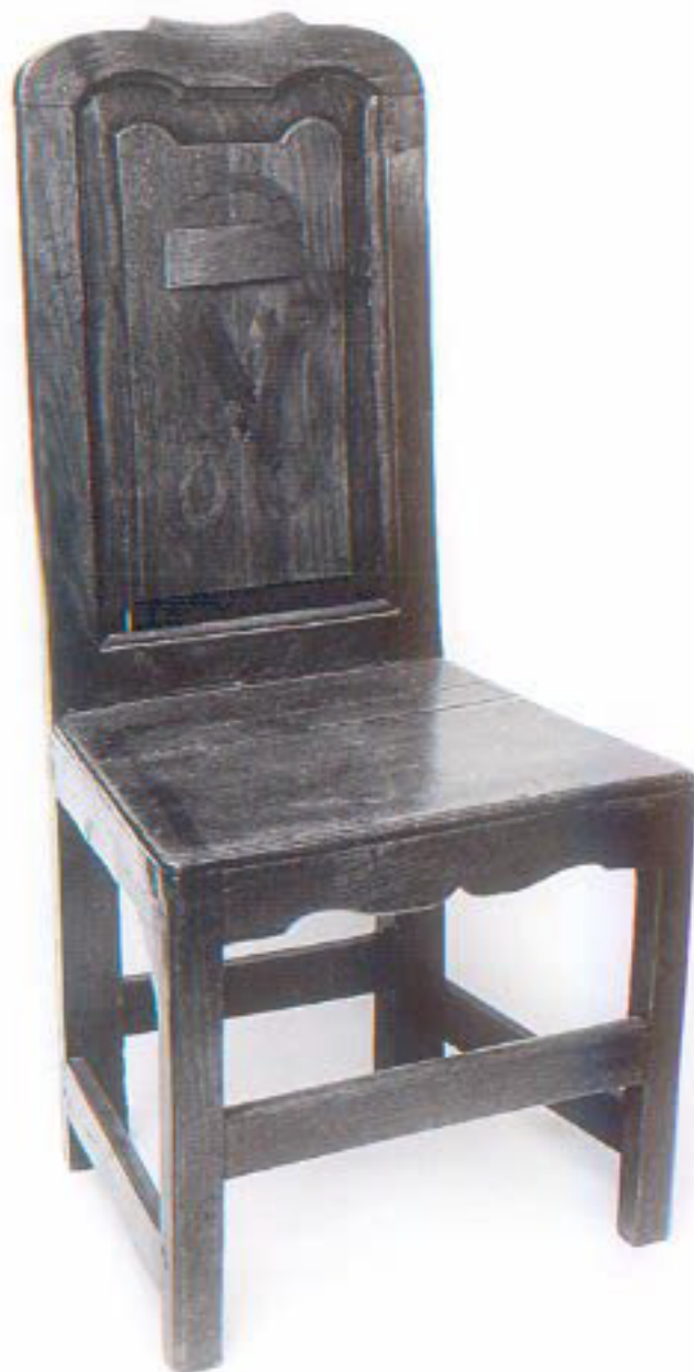
ILLUS 4 Deacon's chair, Incorporation of Tailors of Old Aberdeen, mid-18th century. One of a pair. Oak; H: 1055 mm, W: 475 mm, D: 390 mm.