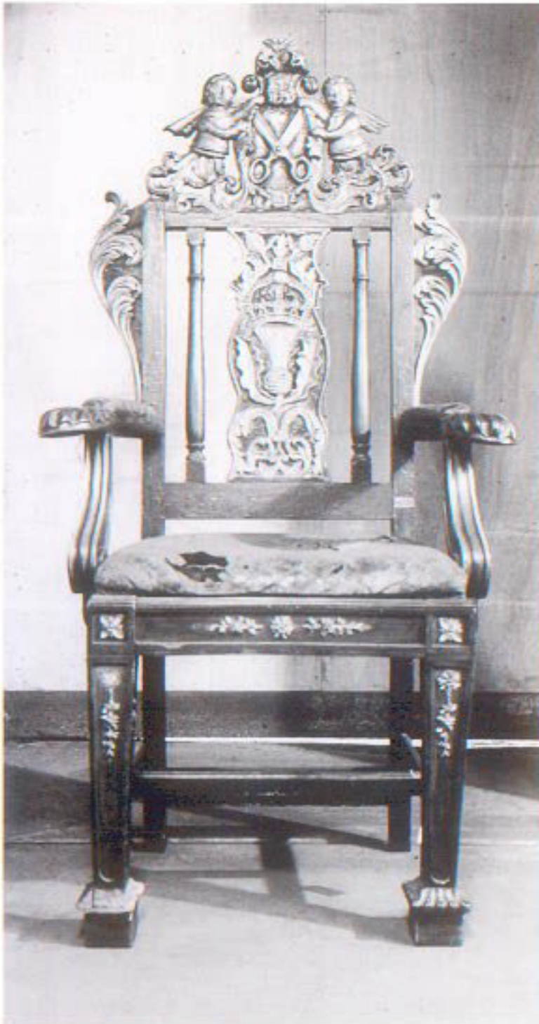
ILLUS 10 Deacon's chair, Incorporation of Tailors of Easter Portsburgh, 18th century with extensive 19th-century repairs. Pine, mahogany & gesso with traces of painted decoration, H: 1620 mm, W: 800 mm, D: 495 mm. ( Edinburgh City Museums & Art Galleries )