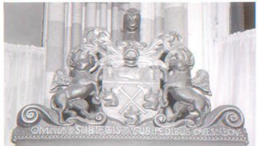
ILLUS 8 (left) Deacon's chair, Incorporation of Hammermen of Edinburgh, 1708. ?Walnut with traces of painted decoration; H: 1875 mm, W: 705 mm, D: 515 mm. ( The Scottish Reformation Society )