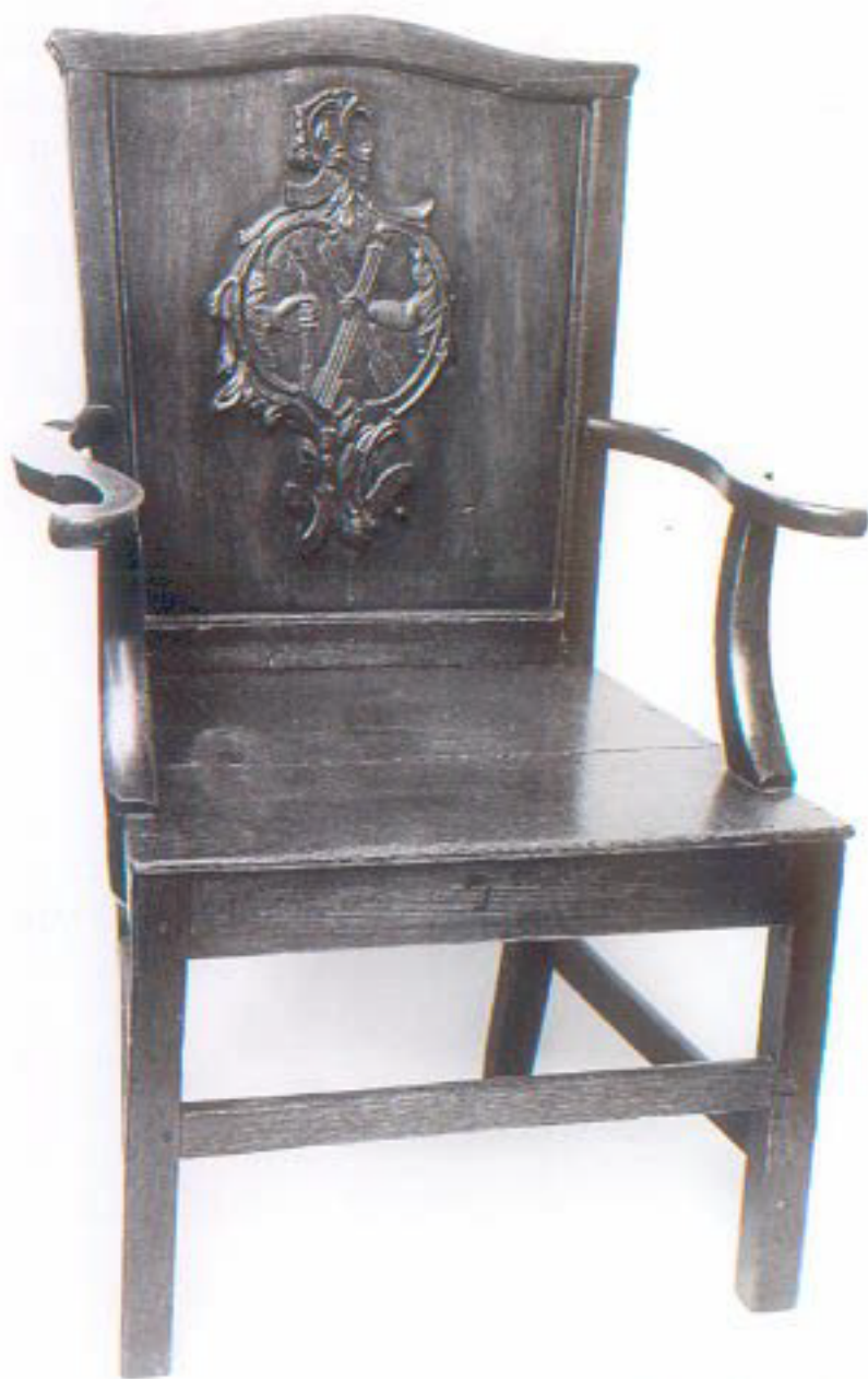
ILLUS 3 Deacon Convener's chair, Incorporated Trades of Old Aberdeen, c 1760. One of a pair. Oak; H: 1040 mm, W: 580 mm, D: 480 mm.