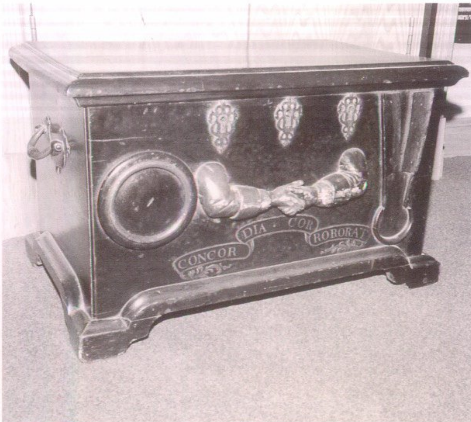
ILLUS 2 Box, Incorporation of Bonnetmakers of Glasgow, first half of 18th century. ?Mahogany with painted decoration; H: 462 mm, W: 746 mm, D: 467 mm. Inscription: CONCORDIA CORROBORAT [Unity Strengthens]. (Incorporation of Bonnetmakers & Dyers of Glasgow)