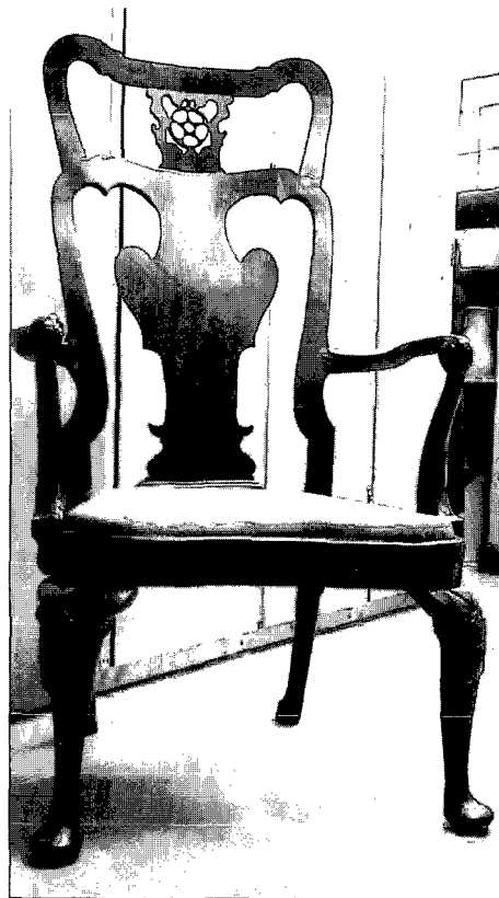
ILLUS 6 Deacon's chair, Incorporation of Wrights of Perth, 1748. Beech & mahogany; H: 1295, W: 675 mm, D: 545 mm. ( Perth Museum & Art Gallery )