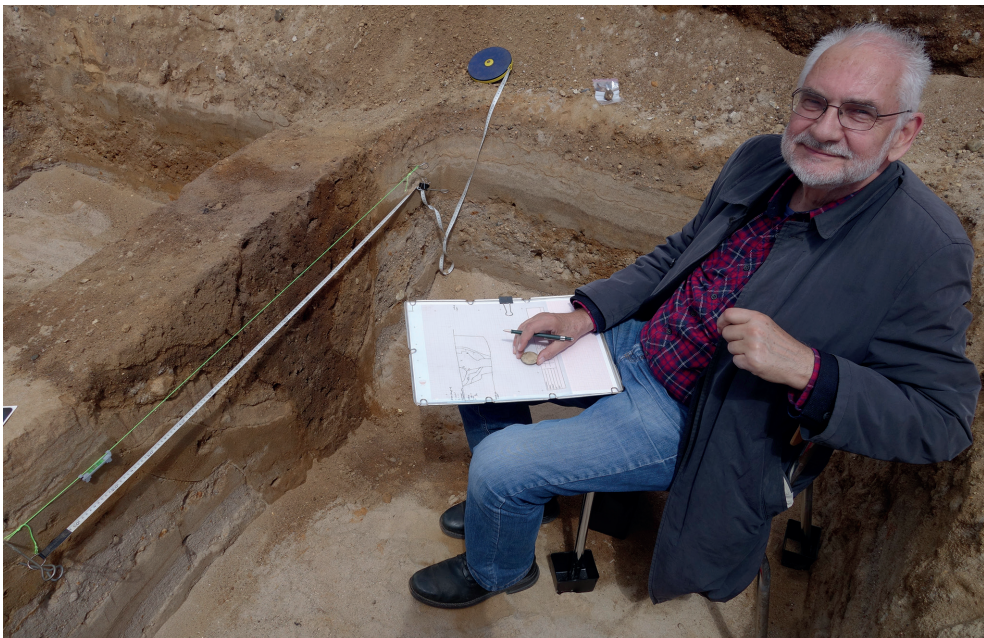
Billund, Jutland, July 2015, exploration of enigmatic post-built structures of The Single Grave Culture

rich prehistory of this large but understudied island, but on the rise of the four Greek cities in the archaic period. Of course, there was an echo from Denmark ringing in his ears as he contemplated connections to the late Bronze Age in the southern Scandinavian regions, but his fieldwork had a coherence as never before. Here he managed his research team and excited them with his intellectual vision, while also delivering outstanding results, and achieving lasting friendships from admirers on the island. Winning honorary citizenship on Kephallénia amounted to a new badge of honour, profoundly more affecting to him than the many fellowships he had enjoyed as a scholar. Two major volumes were published on the Kephallénia fieldwork and its analysis and a third followed on the Hjortspring boat. 4 This latter volume essentially experimented with his ideas about agency and the military in the earlier Greek periods and their impact far away on the Danish rim of classical Europe. No Danish classical archaeologist has published so extensively in a lifetime on his or her Mediterranean fieldwork. Needless