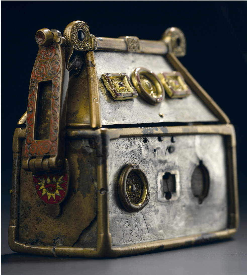
ILLUS 5 The Monymusk reliquary

ornate interlocking ridge on the HSS from Enger (ibid: Tafel 14). However, the fronts of these are decorated with geometric arrangements of multiple cabochons which in no way resemble the object in the Columba sketch. As far as the three-over-three arrangement of possibly circular mounts is concerned, a broad similarity can be seen in the front of the Ennabeuren HSS (ibid: Tafel 1), although this features stamped multiple roundels, displaying heads similar to Roman