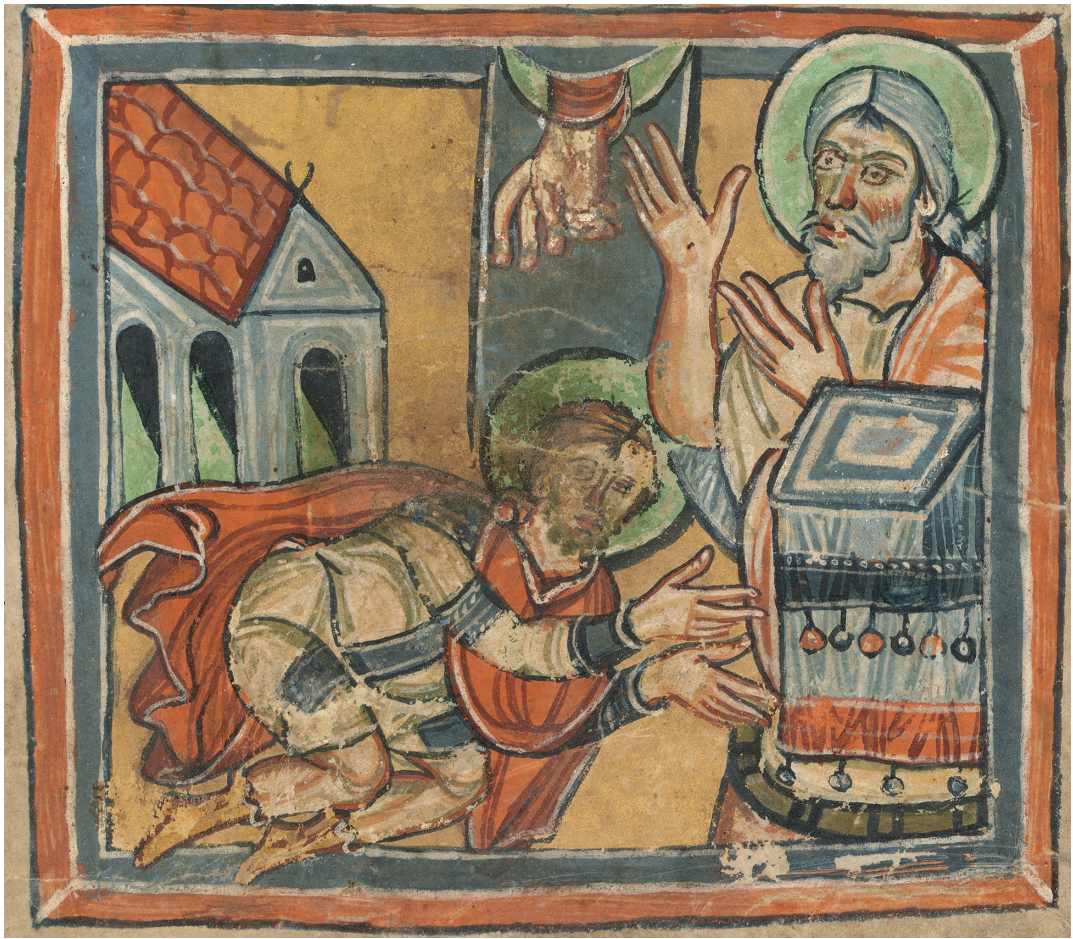
ILLUS 7 An altar shown in non-representational perspective, similar to the altar in the Columba portrait. St Gallen Psalter c 830. (© Zürich Zentralbibliothek, MS C 12, f53r)

the saint was considered to be simultaneously present in his relics as well as being in Heaven (Crook 2000: 17). It can therefore be suggested that amongst the treasures of the monastery was at least one HSS, bearing a similarity to the one of Insular origin that ended up in Bologna. There is mention in Cod Sang 339 p6, in an entry in a Calendar and Sacramentary dated to around 1100, that the abbey church of St Gallen possessed relics of Columba (Duft & Meyer 1954: 30). Were it true that the reliquaries shown in the image contained relics of the saint featured in this devotional image, it is certainly the case that the shrine is no longer to be found at St Gallen.