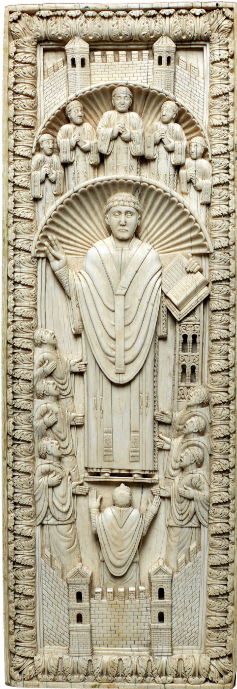
ILLUS 3 Ivory panel from a book cover, Carolingian 10th century, depicting a bishop about to celebrate Mass among his Choir. M 12-1904

To date there has been little discussion of this image, being simply described by von Euv (2009: 357–8) in the e-codices entry. The image was well-drawn in pen and black ink, now faded with some localised damage, filling most of the page which measures 1900mm × 1400mm. This may have been a sketch which was never fully worked up, and could even have been copied from another image (R Sharpe & R Gem pers comm). The saint stands central to and almost filling a round-headed arch, presumably representing a chancel arch or the arched entry to a side chapel. The arch is supported on a pair of polygonal columns, with rounded bases and capitals, all festooned with a fluttering fabric drape, like a ribbon, wound loosely around and uniting the arch and columns. The foliage forms carved on the capitals could be the artist's take on the acanthus leaf motifs commonly found on Carolingian capitals.