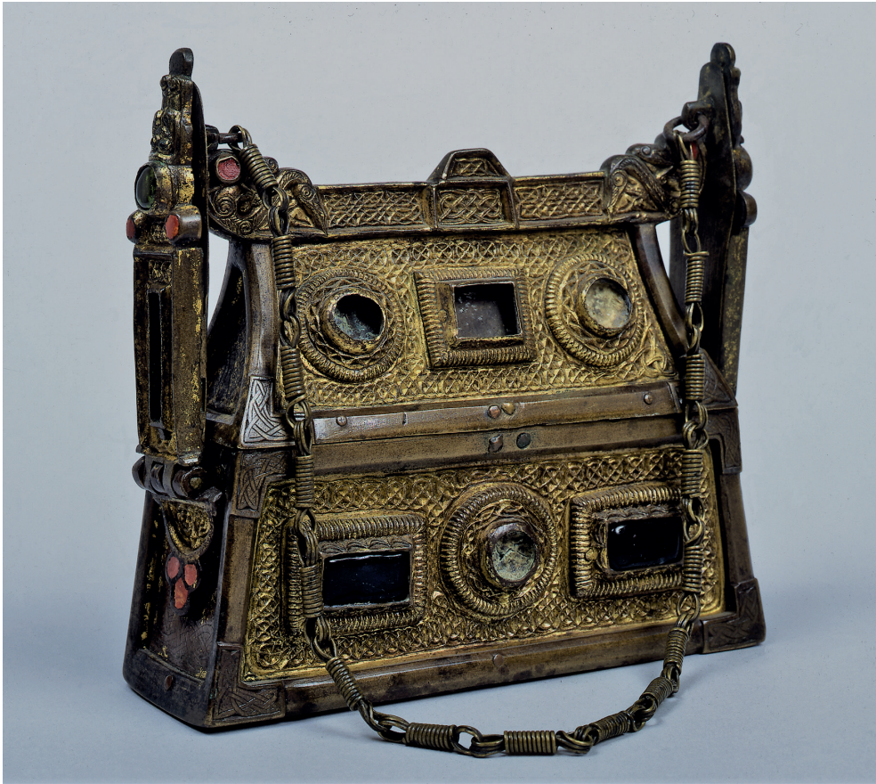
ILLUS 6 The Bologna house-shaped shrine

emperors, rather than applied mounts common to the Insular examples.