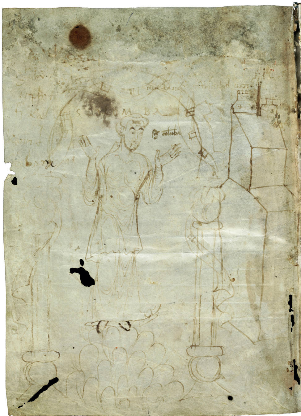
ILLUS 2 The image labelled as St Columba on the last page, page 166, of the St Gallen copy of Vita sancti Columbae created in the mid-9th century, Cod Sang 555