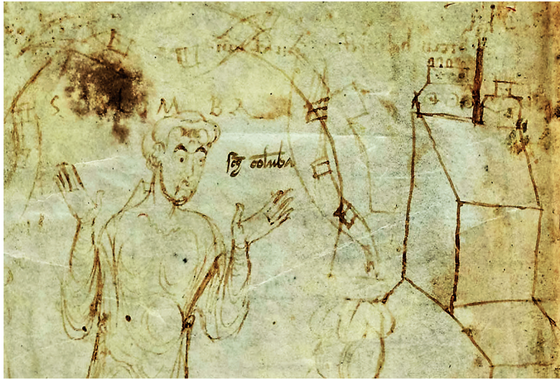
ILLUS 4 St Columba with the liturgical objects displayed on the lectern to his left (detail from Illus 2 enhanced by the author)

those tentatively identified at Iona Abbey from the excavated evidence of moulds and other metalworking debris (Campbell & Maldonado 2016: 90), their very act of creation being a form of religious devotion. They are usually interpreted as portable shrines, designed for carrying small pieces of a saint's bones in procession, or out into the community for the sanctification of laws and oaths (Caldwell 2001: 269). The precious materials used in making these boxes honoured and emphasised the sacred nature of their contents (Smith 2012: 156). Alternatively, a small casket like this could have served as a portable chrismal containing holy oil, or else as a pyx for the consecrated host brought to the sick and dying. Lacking any precise evidence of function, such as the inscription on the Anglo-Saxon casket from Mortain, France, which states that it was indeed a chrismal (O'Donoghue 2011: 86), it is otherwise impossible to be definite about function, and of course they may have had multiple uses over a long life. These complex composite objects were usually fabricated around the core of a wooden box covered with gilded metal plates, with applied metalwork decoration, and prominent gable finials joined by a roof ridge bar with inturned animal head terminals.