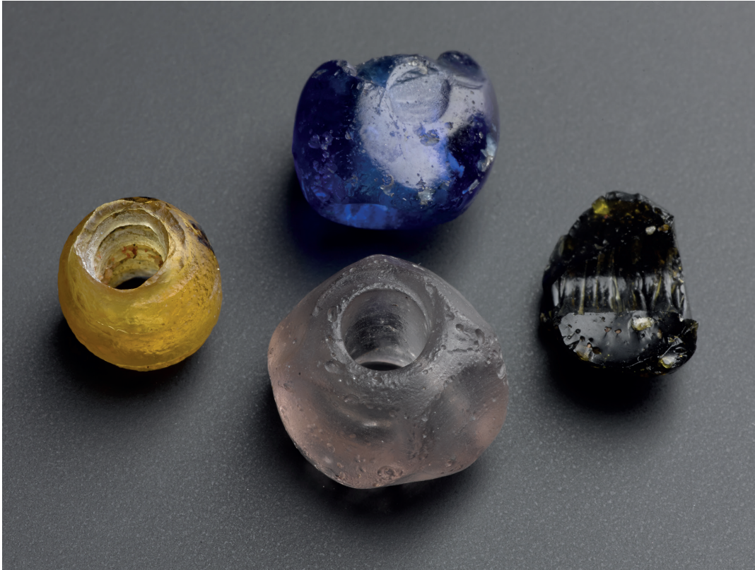
ILLUS 6 Four beads from the Isle of Rum, including a colourless-pale lilac faceted example, bottom centre.

111). From beyond Scotland, the collections of the British Museum's Department of Britain, Europe and Prehistory also contain a number of beads similar to those from Morham Group 1, including faceted beads in bright translucent blue, translucent amber, milky opaline and colourless glass (illus 9). These beads have only general Irish provenances and had been categorised as 'Celtic, 5th–11th centuries' (British Museum, 1892,0421.55, 32 beads from Ireland; and 1871,1210.80–4, 1871,1210.96–107, 1871,1210.112–113 from Northern Ireland). None are well-dated, all being stray finds or from old collections with poor provenance information. Amongst these poorly provenanced 'Celtic' beads are also a group beads identical to the polychrome striped bead from St Ninian's Isle (1892,0421.53, 12 beads from Ireland).