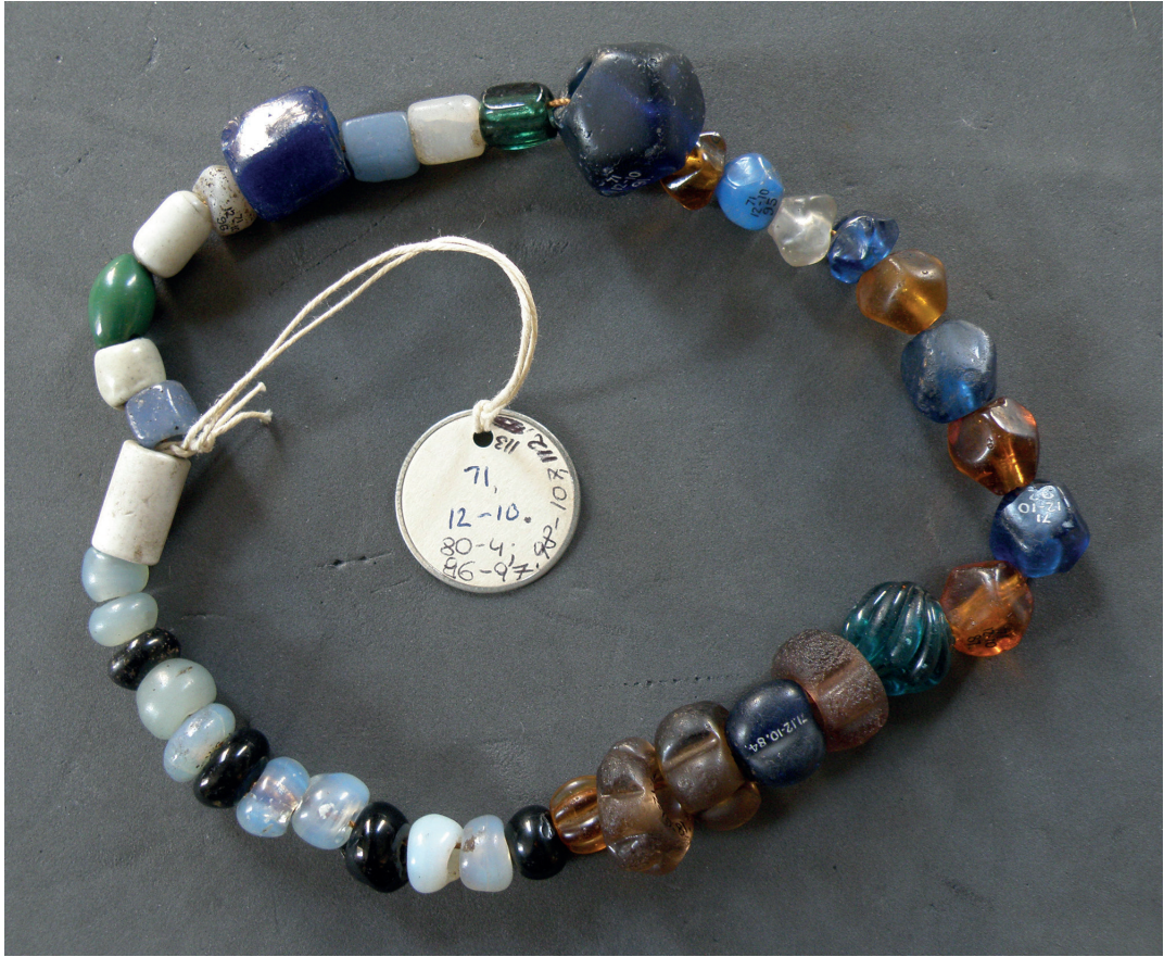
ILLUS 9 One of the strings of beads provenance to Ireland in the collections of the British Museum.

Anglo-Saxon small finds from Scotland on the basis that it was 'not of a type found in Celtic areas ... [and] similar beads come from several pagan Saxon graves' (Laing 1973: 45, no 2). This is, however, certainly of more recent manufacture: among European-made early modern trade beads 'perhaps no other bead has been as popular as the chevron', being produced from around 1500 by Venetian glassmakers, and from the 17th century by the Dutch (Sheer Dublin 1987: 117). 'For almost five hundred years, these [chevron] beads have been produced in the many millions and in several hundred varieties' (ibid). Other distinctive examples include a so-called 'raspberry' bead from Dryburgh, Scottish Borders (illus 11; NMS, x.FJ 143; Kidd & Kidd 1983: type Wiid, illus 4,