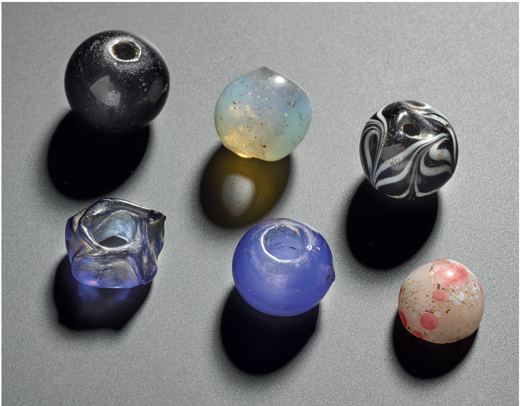
ILLUS 7 'Six beads of recent date bought ... in March 1900', NMS x.FJ 89.

These early modern beads vary from simple monochrome examples in a wide variety of shapes, to more complicated and distinctive polychrome beads. Some were manufactured by winding, others were drawn; wound beads could be made on a small scale and required less sophisticated equipment than drawn beads. Almost infinite variation is possible and therefore classifying wound beads is difficult (see Kidd & Kidd 1983, modified by Karklins 1983; 1985a for the most widely used classification system). Identifying where individual trade beads were produced is also problematic: glassworkers travelled across Europe, particularly from Venice, taking designs and techniques with them to centres elsewhere. Attempts at provenancing