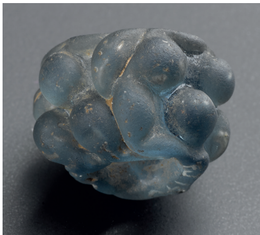
ILLUS 11 A raspberry bead from Dryburgh.

The wound tubular beads from Morham Group 2 can also be closely paralleled among early modern beads, including among those collected by a private museum, the Picard Trade Bead Museum, in America, and excavated from Amsterdam (Karklins 1983: illus 2, left, rows 1–3). 5 Another distinctive type is represented amongst the Scottish beads by the polychrome striped example from St Ninian’s Isle (and the British Museum’s ‘Celtic’ beads): this is an early modern type, classified by Karklins as IIIb (1974: 74), and good parallels are published from excavations of early modern glass bead manufacturing sites in Amsterdam (Karklins