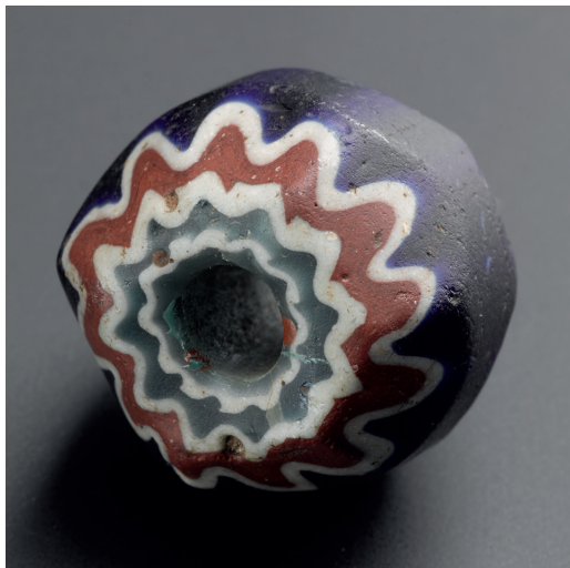
ILLUS 10 A chevron bead from Mouswald.

transparent light grey, transparent pale blue with a yellowish opaline cast, transparent amber, transparent ultramarine, transparent bright navy and transparent blue with a slight yellowish opaline cast (Karklins 1983: illus 2, left, row 4; Karklins 1974: 79–80, type W1b4; Baart 1988: 73). Though not illustrated, the description of the ‘opaline’ beads from Amsterdam appears to be a very good match for the dichroic glass from Morham. Other parallels for the dichroic milky glass also exist among trade beads, including one (tubular-shaped, not faceted) from a bead card, possibly dating to the early 20th century, that has been scientifically analysed (Davison et al 1971: ‘Cambridge #1’ in Table 1, discussed further below). Whilst dichroic glass was produced in antiquity and again from the early 17th century in Europe, its production was facilitated after 1880 when the Solvay process produced commercial soda with fewer chloride and sulphate impurities, which inhibit opalescence in glass (Davison et al 1971: 647). Other chronological indicators include a deep blue example of this faceted type excavated in Iceland from a context dated to 1780–1800 (Hreiðarsdóttir 2007; Elin Hreiðarsdóttir pers comm). Two faceted examples, one ‘greenish-colourless’, the other amber-coloured glass, were excavated from pits