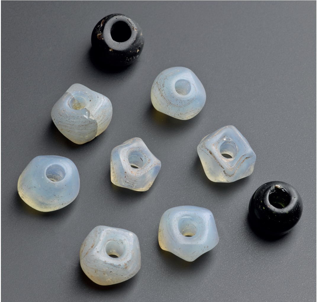
ILLUS 1 Morham Group 1 beads.