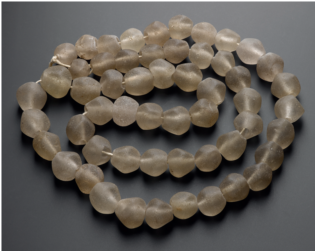
ILLUS 8 Beads reportedly found in 'a grave in the north of Scotland', NMS x.FJ 111.

trade beads using scientific analysis are proving fruitful: for example, in distinguishing between assemblages of red beads from the 17th century found in various sites in America on the basis of levels of tin, copper and antimony, which may indicate a change from Dutch to possibly French manufacture (Sempowski et al 2001). However, with the sheer numbers of assemblages and types requiring study, this work is still only beginning to shed light on the complex kinds of networks represented by trade beads. It can also be very difficult to date trade beads closely as many designs continued to be made virtually unchanged for centuries. Again, there are indications of chronological changes in the composition of some colours of glass beads, for example, the use of different opacifiers in opaque white beads: