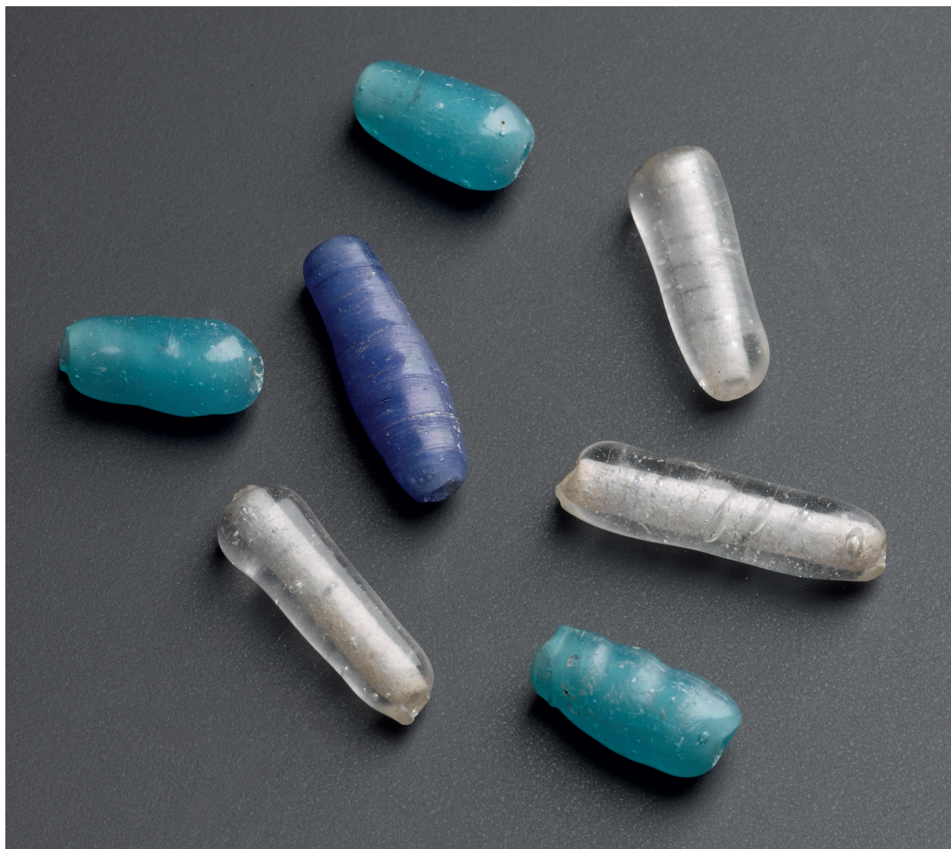
ILLUS 2 Morham Group 2 beads.

body decorated with very fine, white, marvered stripes along its length which are covered by a colourless glass layer. Group 2 consists of eight globular beads of amber-coloured translucent glass, similar to that of the annular bead in Group 1.