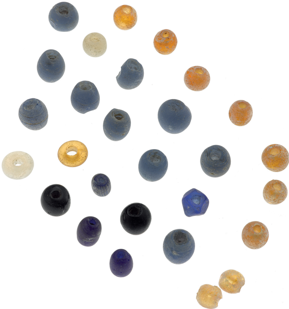
ILLUS 3 St Ninian's Isle beads. Group 2 consist of eight amber-coloured beads on the right of the image; the remainder are Group 1.

In choosing among these contradictory pieces of information, the recent reassessment of the beads suggested an early medieval long-cist burial, conceivably associated with the Pictish hoard, was the most likely find context for the beads. Although the dearth of well-dated parallels