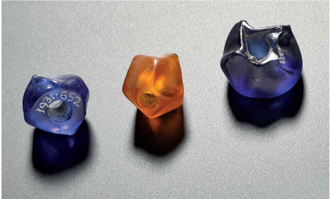
ILLUS 5 Three beads from Glenluce Sands.

Group 1 and St Ninian's Isle Group 1. From Cloister Seat, Aberdeenshire (NMS, x.FJ 43; illus 4a), is a particularly close parallel to the Morham beads – it is from a similar milky-white glass and has the same prominent winding marks. Also from Cloister Seat are two 'black' wound globular beads very similar to those from Morham Group 1 (illus 4b, NMS, x.FJ 40 and x.FJ 41). Stray finds of the faceted type are known from among the massive multi-period collections from Culbin Sands, Moray (illus 4c, 4f, 4g; NMS, x.BIB 35, x.BIB 36, x.BIB 51), and Glenluce Sands (illus 5 x.BHB 28, x.BHB 29, x.BHB 40): each of these two sites has produced two translucent blue and one translucent amber glass beads. A further deep translucent blue faceted bead from an unknown locality is also among the NMS bead collections (illus 4e; x.FJ 86) and a similar bead with more sharply defined facets is also known from the vicinity of Coulter, Lanarkshire (illus 4d; NMS x.FJ 30). In Perth Museum and Art Gallery are two further examples in translucent wine-coloured and amber-coloured glass (Hoffmann 2008); these