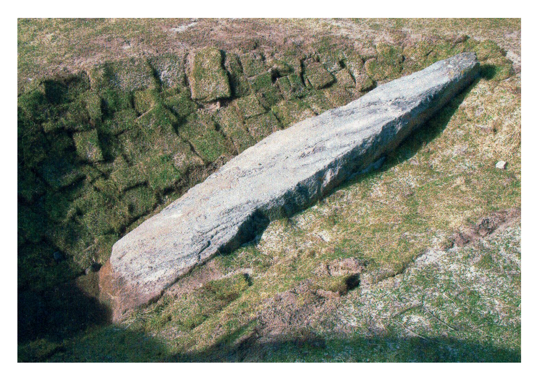
ILLUS 2 The standing stone following the excavations by the Young Archaeologists' Club in 2002–3.

4in) in length visible, with the foot of the stone covered by ground. The stone was approximately 240cm long when fully excavated by the Young Archaeologists Club in 2002-3 (illus 2) (Grant 2014, pers comm). Unless an otherwise unrecorded third standing stone west of Borve was removed sometime after 1862, then the fallen stone must be the one referred to by Edye and Williams. Some support for only two standing stones being present at the site when the burial was excavated may be found in the 1st edition Ordnance Survey map of Barra, which was published in 1885 but surveyed in 1876, only 14 years after Edye's coastal survey and excavation. The map shows the same two stones that are present today (OS 1885).