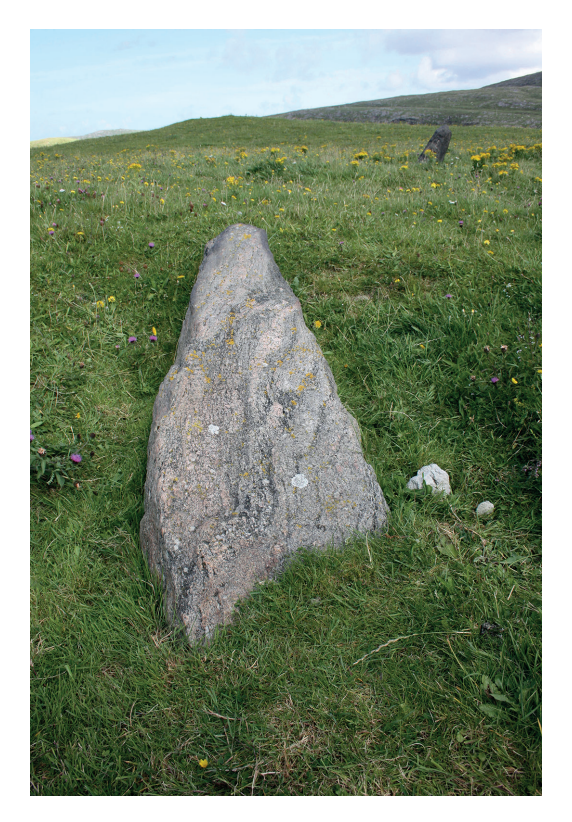
ILLUS 3 The two standing stones with the cairn in the background.

the promontory Stong Mòr (Harrison 2007: 175; OS 2007). As well as the standing stones themselves, the burial site is approximately 42m south of another pre-Viking Age man-made landscape feature, a cairn which is clearly visible from the site (illus 3) (OS 2007). Scandinavian burials in association with earlier man-made landscape features are not unknown in Scotland, and cairns in particular are associated with burials at Boiden (Loch Lomond), Swordle Bay (Ardnamurchan), Brough Road, Birsay (Orkney), Cnip (Isle of Lewis), and Tote (Isle of Skye) (Stewart 1853: 144; Lethbridge 1920: 135; Morris 1989: 288; Dunwell et al 1995: 720; Harrison 2007: 176, 178; Harris et al 2011: 19). Consequently, the cairn in the vicinity of the Ardvonrig standing stones has been considered a candidate for the burial site, but it is too distant from the stones to make this likely,