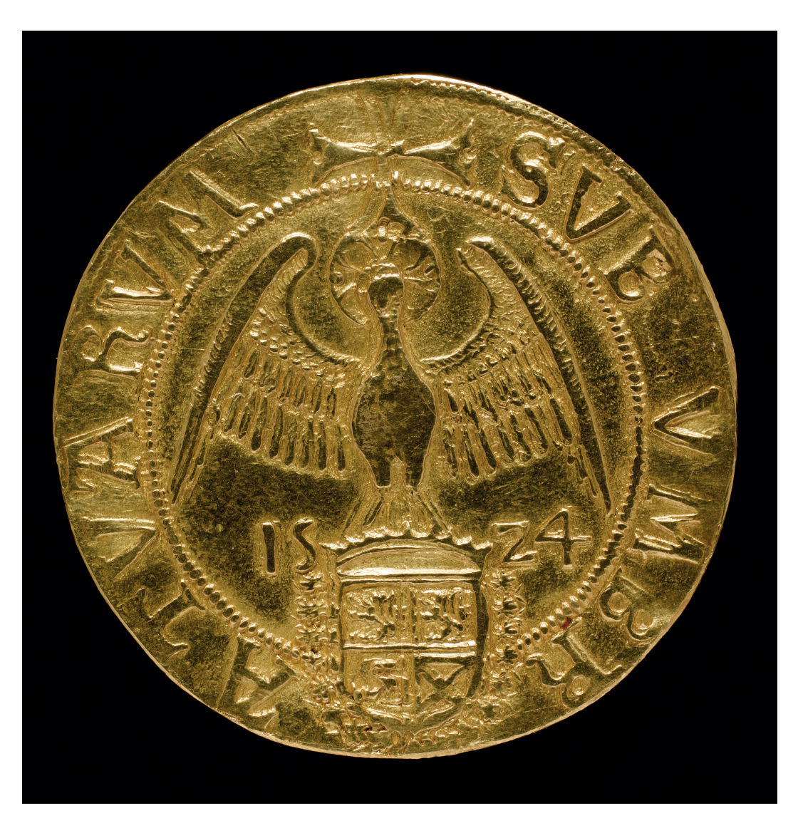
ILLUS 1 Gold medal struck for John Stuart, Duke of Albany. 1524. H.R. 208.

In terms of surviving objects bearing Albany's arms, emblem, and motto, a small gold medal dating to 1524, held at the National Museum of Scotland, Edinburgh, is among the most interesting. The obverse of the medal displays the crowned arms of Albany and his wife, with a cross behind, and the inscription, 'IOANNIS.ALBANNIE.DVC.GVBERN', as a proud statement of Albany's position as governor of