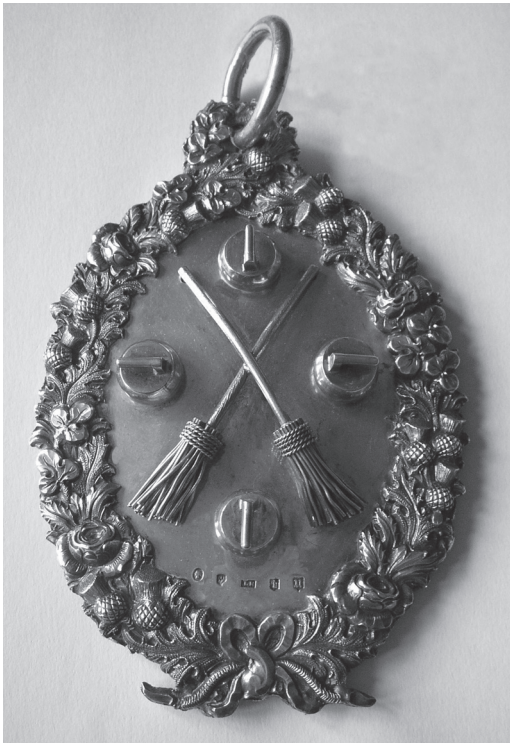
ILLUS 5 Alva Curling Club, 1853

The club was formed in 1848 and joined the RCCC the following year. The medal is in the author's collection.