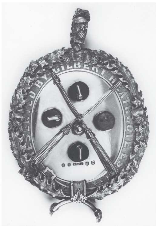
ILLUS 7 Drummond Castle Curling Club, 1854

On the obverse is a band of gold recording the donation, within which are set two pairs of miniature curling stones: one pair of bloodstone with double handles of gold, and the other of granitic stone (said to be from the walls of Sebastopol) 10 with L-shaped handles of gold, with crossed brooms of gold, and a gold tee-marker. The inscription is as follows.