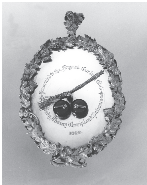
ILLUS 3 Fingask Curling Club, 1844

(duty mark); thistle (standard mark); castle (Edinburgh); 'M' (date letter for 1843–4). It is 12.5cm × 8cm.