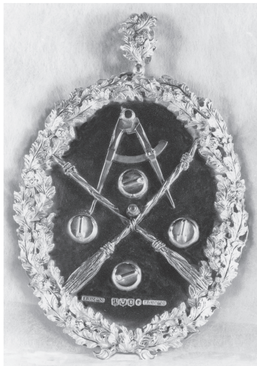
ILLUS 4 Delvine Curling Club, 1846

The club was instituted in 1732 and joined the RCCC in 1842. The medal is in the possession of Delvine Curling Club.