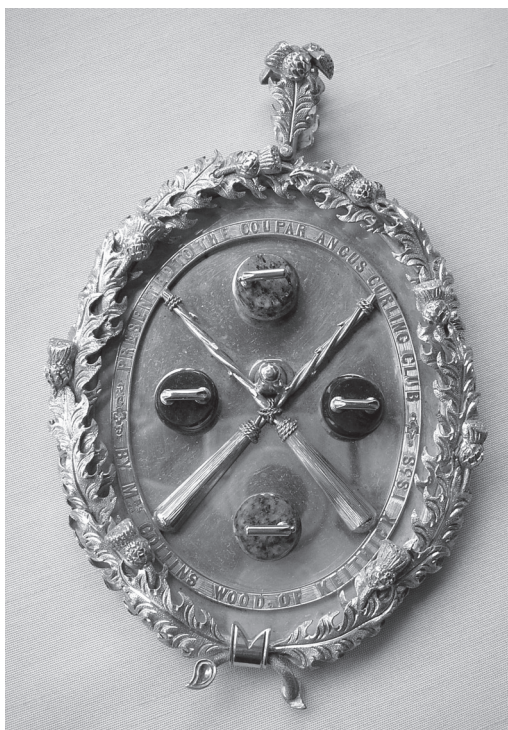
ILLUS 8 Coupar Angus Curling Club, 1858