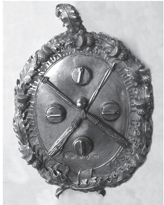
ILLUS 6 Drummond Castle Curling Club, 1853

The marks on the obverse are: queen's head (duty mark); thistle (standard mark); JS (maker's mark); castle (Edinburgh); 'W' (date letter for 1853–4). It is 12.5cm × 8cm. The medal is in the author's collection.