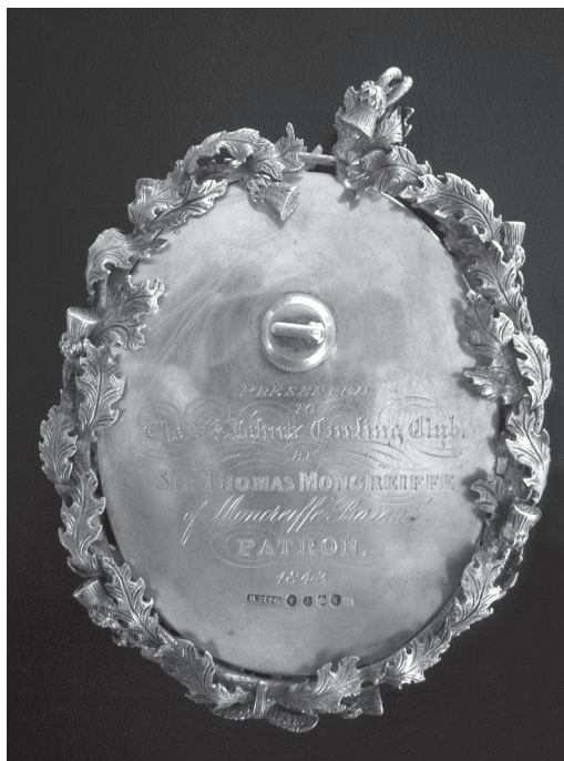
ILLUS 1 St John’s Curling Club, Perth, 1842

On the obverse, above the presentation inscription, is a miniature silver curling stone, with an L-shaped handle. 5 The inscription is as follows.