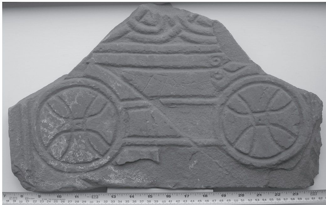
ILLUS 2 Fragment of carved stone from Mail