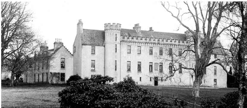
ILLUS 2 Fetternear House before 1919

fulminated against idolatry, and a riot ensued, during which various neighbouring religious houses were despoiled of their contents and images burnt. 1 However such destruction did not all occur in the years around 1560. From the