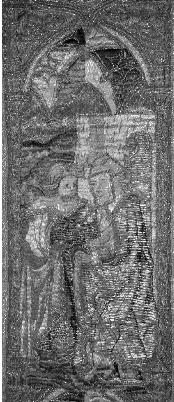
ILLUS 7 Detail of late 15th-century embroidered orphrey repaired in the 19th century, depicting the embrace at the Golden Gate, Jerusalem, Blairs Museum T8001