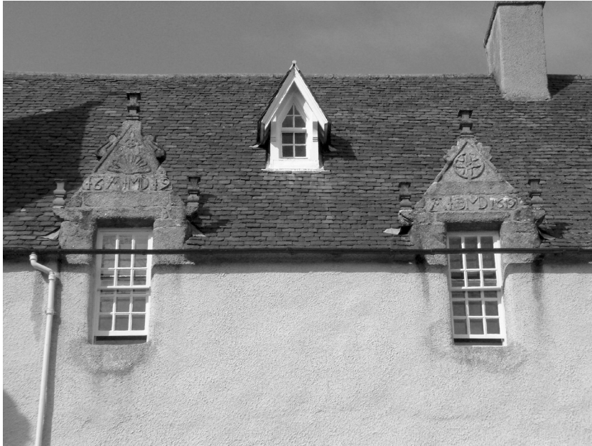
ILLUS 3 The south wing of Drum Castle ( Scottish Episcopal Palaces Project )

century to fill windows in the uppermost storey of the north wall of the towerhouse.