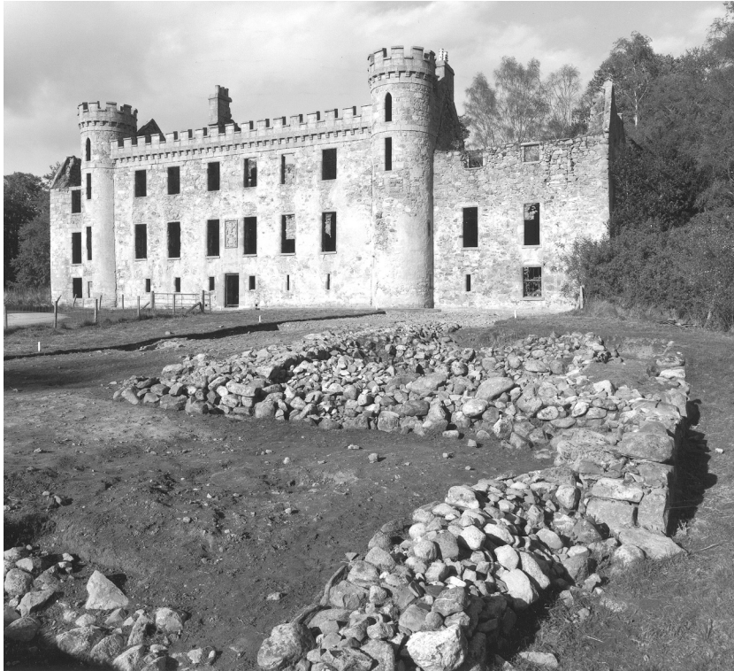
ILLUS 1 Fetternear House, Aberdeenshire, in 1995, with the excavated remains of the bishop's palace in the foreground