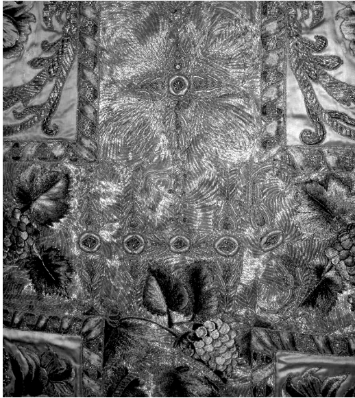
ILLUS 8 Detail showing the IHS panel on the back of 17th-century chasuble Blairs Museum T8002