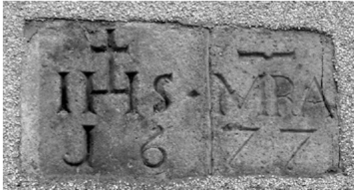
ILLUS 6 IHS MRA plaque at Balquhain ( Scottish Episcopal Palaces Project )

Scotland, and it is significant, given the links the Leslie family maintained with eastern Europe during the 17th and 18th centuries, that the combination is characteristically used in the Alps (Zeune 1992, 57). A similar plaque survives at Balquhain, their ancestral seat (illus 6). The IHS monogram became associated with the Society of Jesus, founded in 1540; an emblem depicting a monstrance displayed the IHS monogram to represent the transubstantiation (Slade 1971, pl 20; Bryce & Roberts 1993, 368–70).