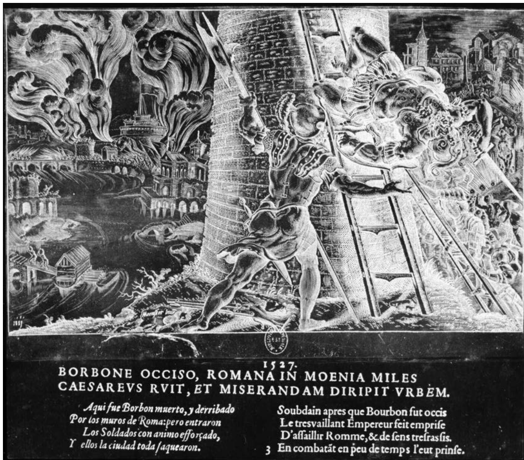
ILLUS 8 La mort de Charles, duc de Bourbon, au Sac de Rom en 1527, by an unknown artist, showing Bourbon falling backwards from a scaling ladder after being shot. Cabinet des Estampes, Bibliothèque Nationale, Paris

correspondents who reported his demise to London, deeply mourned by the French King and his mother who, although France was at war, gave him a magnificent quasi-royal funeral in Paris (Mayer & Bentley-Cranch 1994, 17–18).