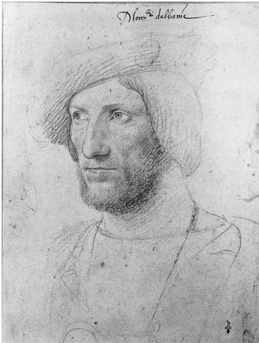
ILLUS 1 John Stewart, Duke of Albany, by Jean Clouet. Black and red chalk drawing, 25.1x19.7cm c 1525. Inscribed Mons' dalbanie ; R de Broglie. Les Clouet de Chantilly catalogue, no 52; Mellen (1971) no 36, pl 53

wished her to rule as Regent and act as guardian to their children. The Scottish lords accepted this, although she was the sister of their enemy, Henry VIII, but when she married Archibald Douglas, sixth Earl of Angus, after