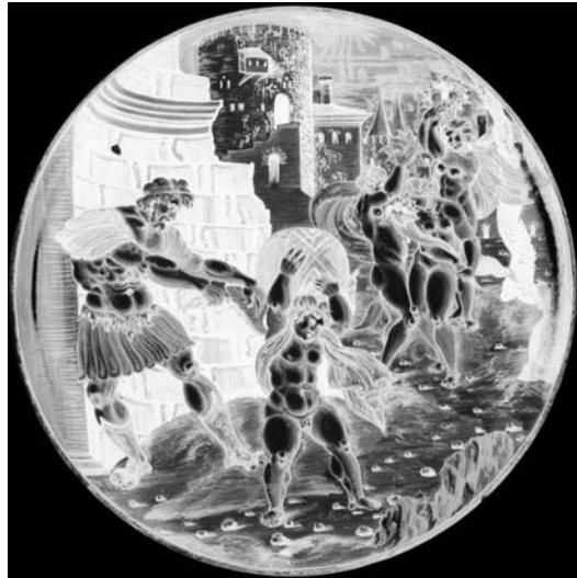
ILLUS 7 An allegory of the Sack of Rome 1527. Majolica dish, Giulio da Urbino, Gubbio, Umbria, 1534, diameter 26.7cm

I pointed my arquebus towards the thickest and most closely packed part of the enemy, taking