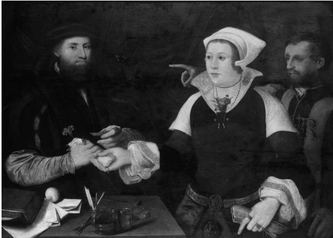
ILLUS 6 Queen Margaret Tudor with the Duke of Albany and possibly Harry Stewart, Lord Methven (Private collection)

and a third man who has been variously identified as Harry Stewart or as Margaret's first husband, James IV, was presumably painted in this context (illus 6).