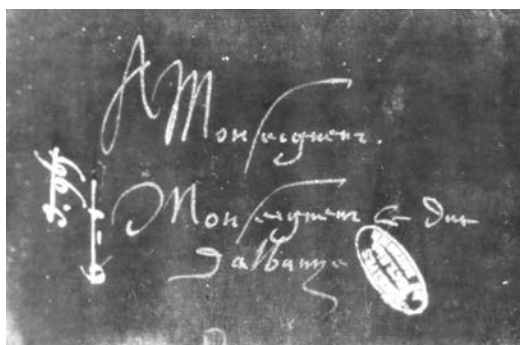
ILLUS 2 Letter 2 [AN J 966 40 19 ] Superscription: 'A Monseigneur Monseigneur le duc d'Albanie' (Archives Nationales de France)