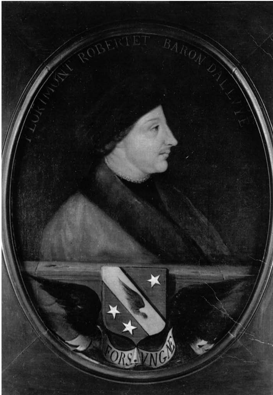
ILLUS 4 Florimond Robertet, Baron d'Alluye by anonymous artist, after 1518. Oil on panel ( Hôtel d'Alluye, Blois )

On his return to France Albany was soon involved in the policies of Robertet and the King's mother, Louise de Savoie, acting as