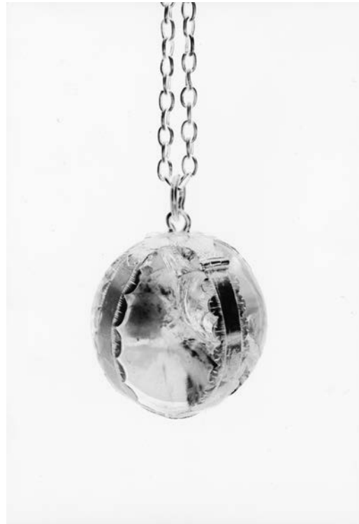
ILLUS 5 Crystal charmstone belonging to the Stewarts of Ardsheal bound in silver, a metal also considered to have medicinal properties, and with a hanging silver chain which may have been used to dip the charmstone in water which could be sprinkled on the sufferer

that Albany was acquainted with all the leading characters in France. Their significance and how they impinged on Albany’s life in France require clarification.