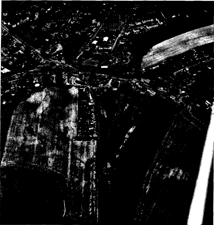
ILLUS 1 Aerial photograph of the Roman temporary camp at Auchtermuchty, Fife. (Copyright: Cambridge University Collection of Air Photographs; Ref: CUCAP AKC 62)

There were no contexted finds from these features, although a stone ball was retrieved from the top level of ploughsoil, outwith the area of the camp.