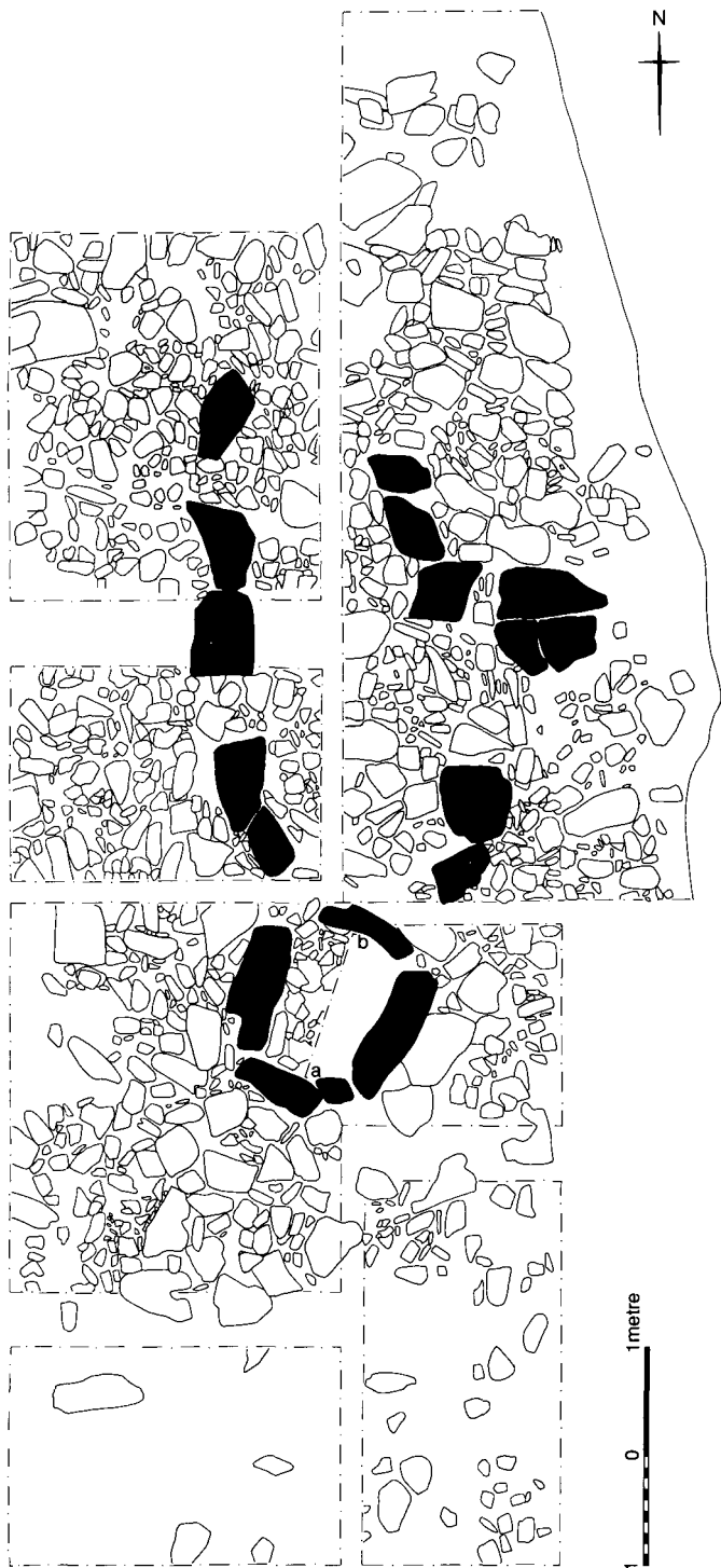
ILLUS 2 Plan of Outnabreck during excavation