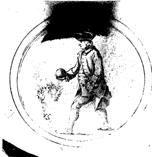
ILLUS 3 The Jack, detail showing 18th-century bowler

The sleeve also has soldered to it 14 complete simple hooks and the remains of four others which have been broken off. From these hooks hang the 12 remaining winners' medals of the trophy. These