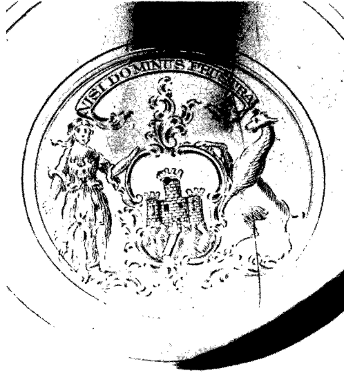
ILLUS 2 The Jack, detail showing the arms of the City of Edinburgh

soldered to the upper section of the sleeve. This ends with an acanthus terminal with the loop for suspending the Jack. (The shape of this arm and the fact that it is of a slightly different style from the rest of work on the trophy, suggests that it might originally have been a standard casting for a handle for a cup, reused for its present purpose.)