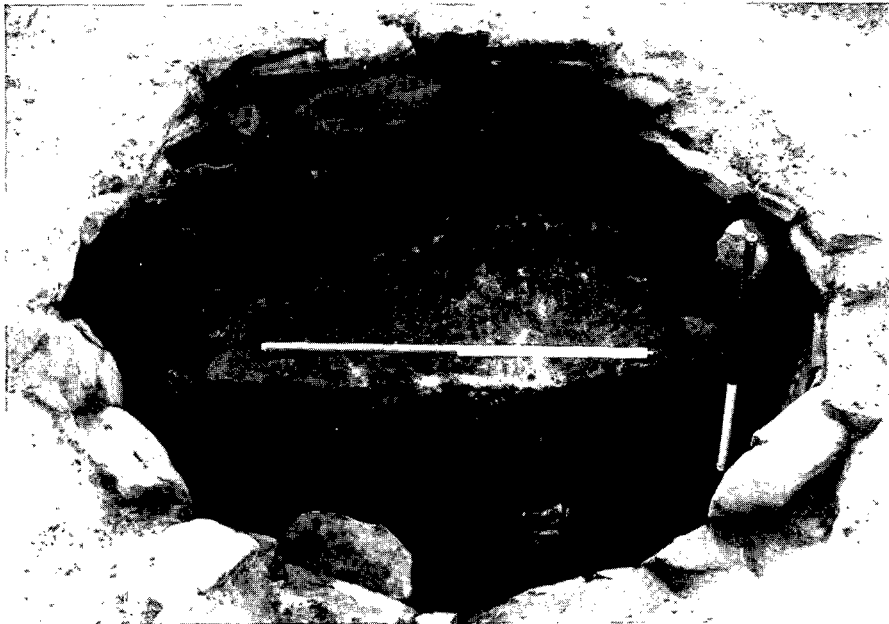
ILLUS 3 Inchkeil storage pit from east

Beneath the grain in the south-east quadrant were further large pieces of charcoal, lying almost at right angles but at different levels from each other, approximately 60 cm down from the top of the