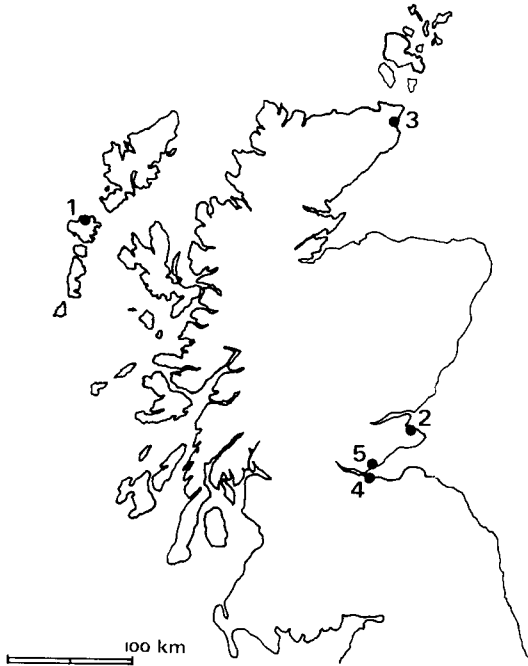
ILLUS 1 1, Vallaquie; 2, St Andrews; 3, Freswick; 4, Cramond; 5, Aberdour