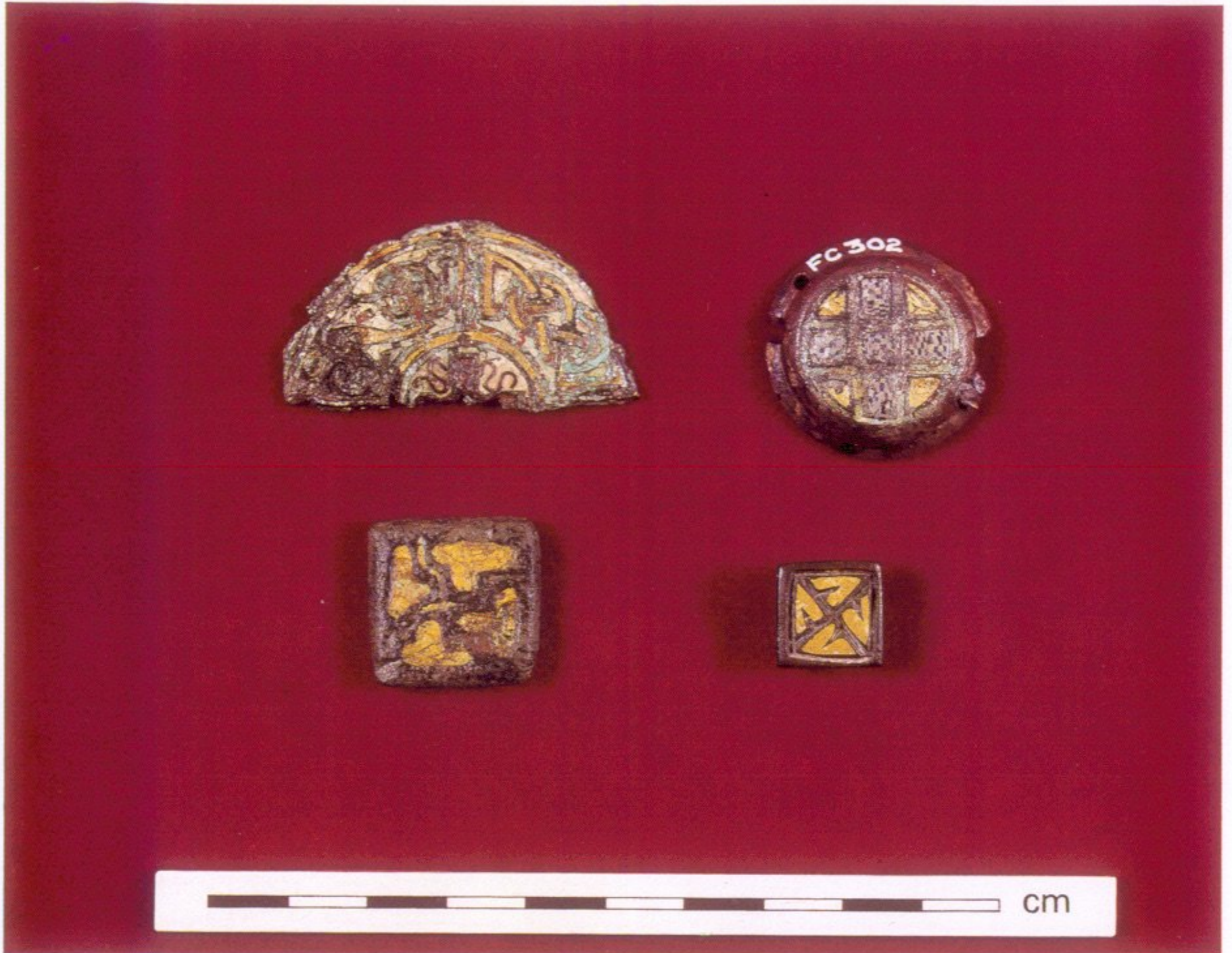
ILLUS 3 Enamelled objects (clockwise from top left): Aberdour, Cramond, Freswick, St Andrews (scale 1:1).