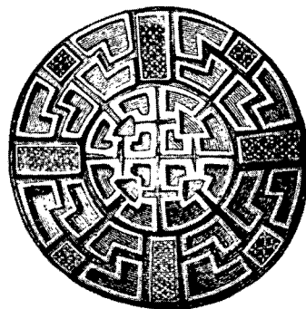
ILLUS 4 Mount from Tårland, Naerbø, Rogaland (after Rygh)

It is possible, finally, to compare the Cramond piece with the mount from Tårland, Rogaland (Wamers 1985, no 102) (illus 4), already referred to; in this case the body of the mount outside a central circular field is similarly divided into quadrants by radial millefiori panels.