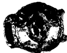
ILLUS 5 Mount from Ballycateen, Co Cork (scale 1:1).

The Aberdour mount has been discussed by Laing and identified as a basal escutcheon from the interior of a hanging bowl (1974, 194–5, pl 11.b). However, this identification is open to question and is in any case incapable of proof. The Ballycateen mount is provided with elongated loops at diametrically opposite points and may have functioned as a strap attachment. The Aberdour mount could have served the same function, although the presence of the central cross suggests that it derives from an ecclesiastical milieu. The mount might equally have functioned as an escutcheon on a house-shaped shrine or as part of another composite piece.