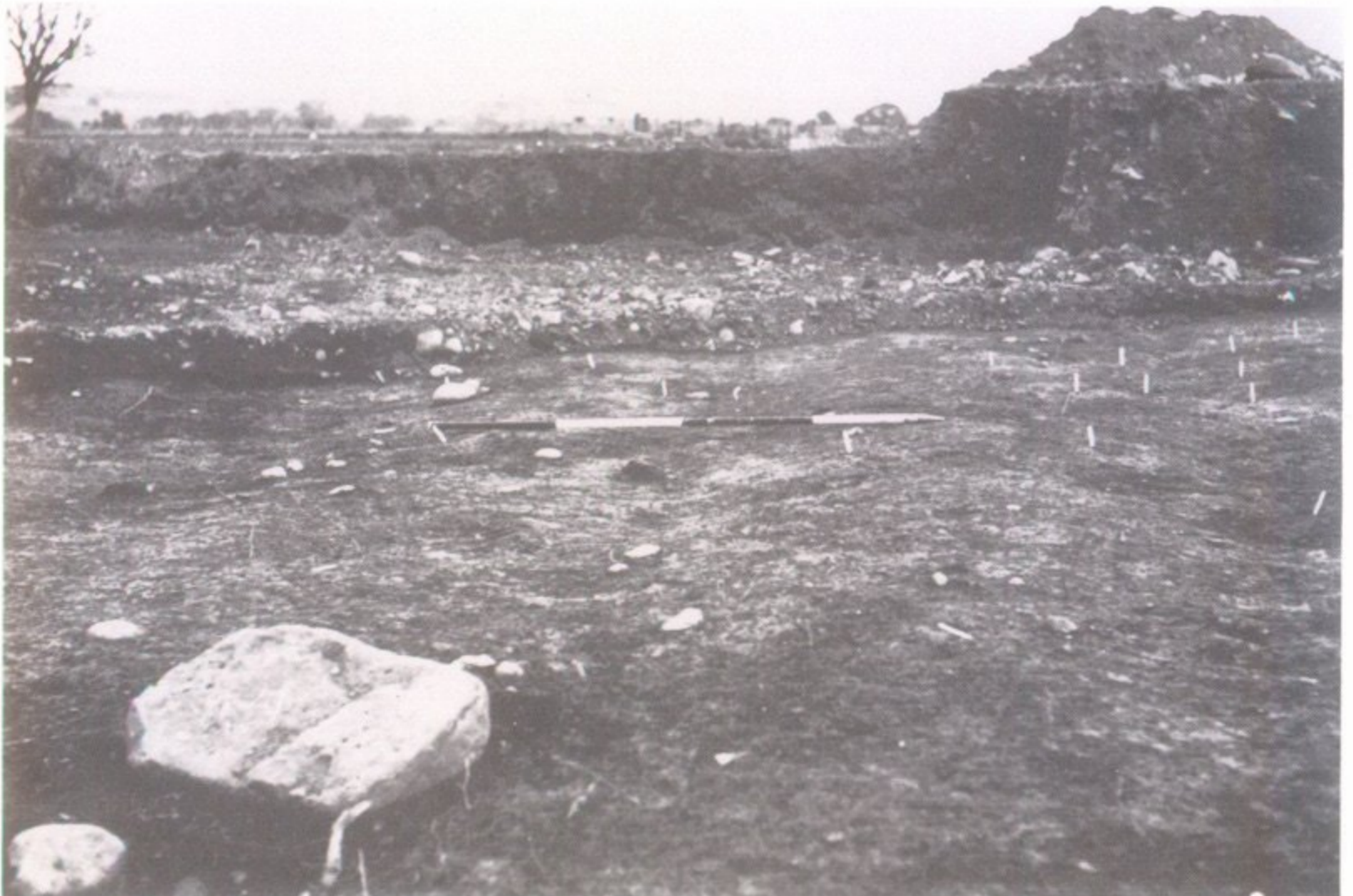
ILLUS 2 Ridging on old land surface of north-eastern quadrant, North Mains, Strathallan. Viewed from west