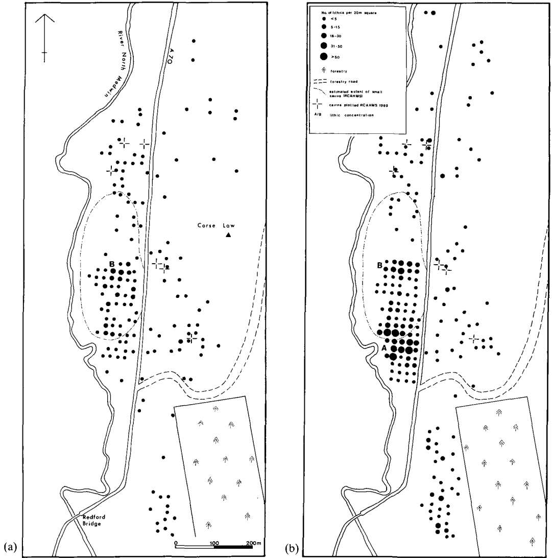
ILLUS 4a, b Corse Law: lithic distribution: a, flint; b, chert