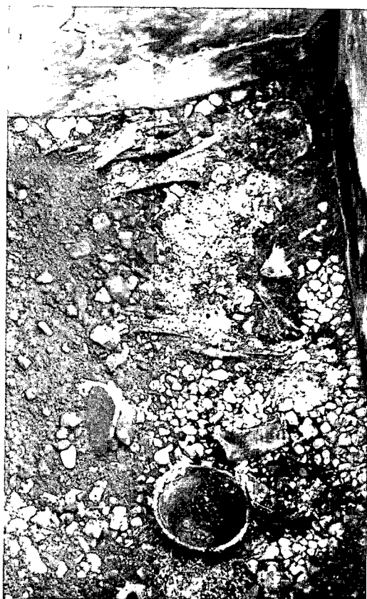
ILLUS 2 Kentraw, Islay; interior of cist