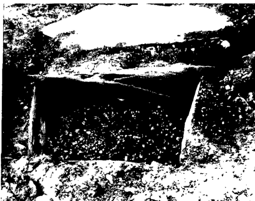
ILLUS 1 Kentraw, Islay, cist and capstone