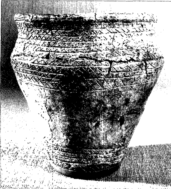
ILLUS 4 Kentraw, Islay; food vessel