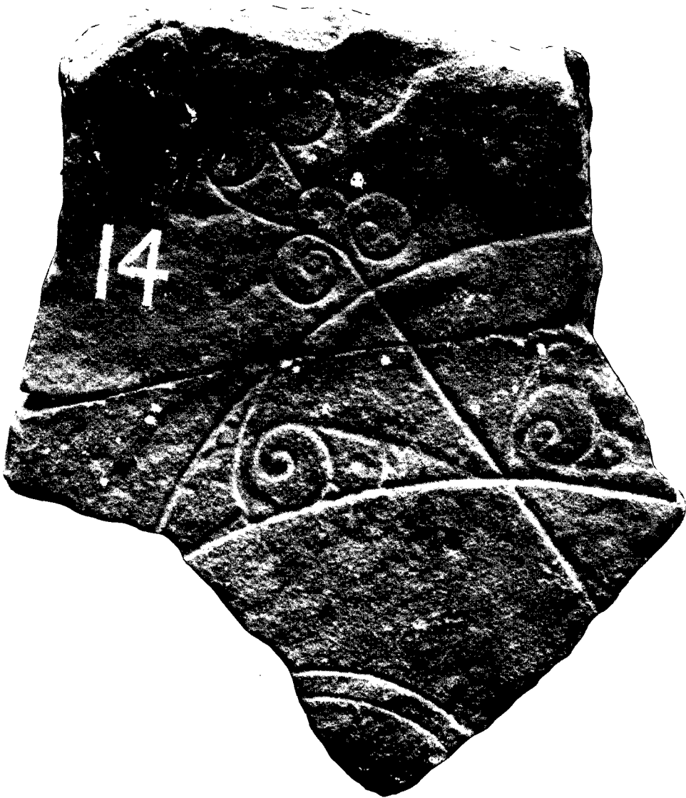
ILLUS 2 The Dunrobin and Inverness parts of the Little Ferry Links stone placed together