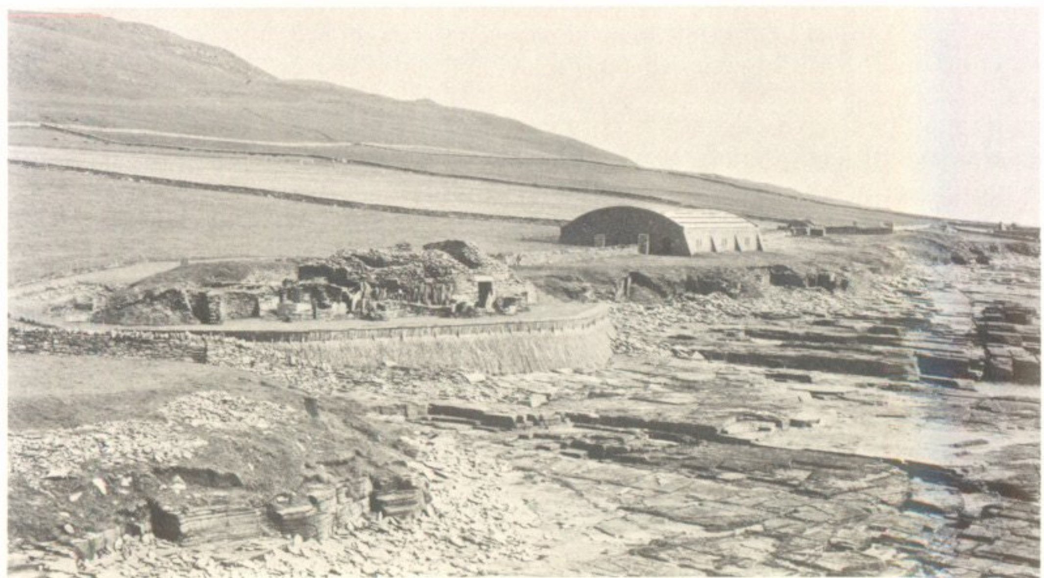
ILLUS 2 Midhowe Broch, with the cover-house over Midhowe Chambered Cairn in the distance.