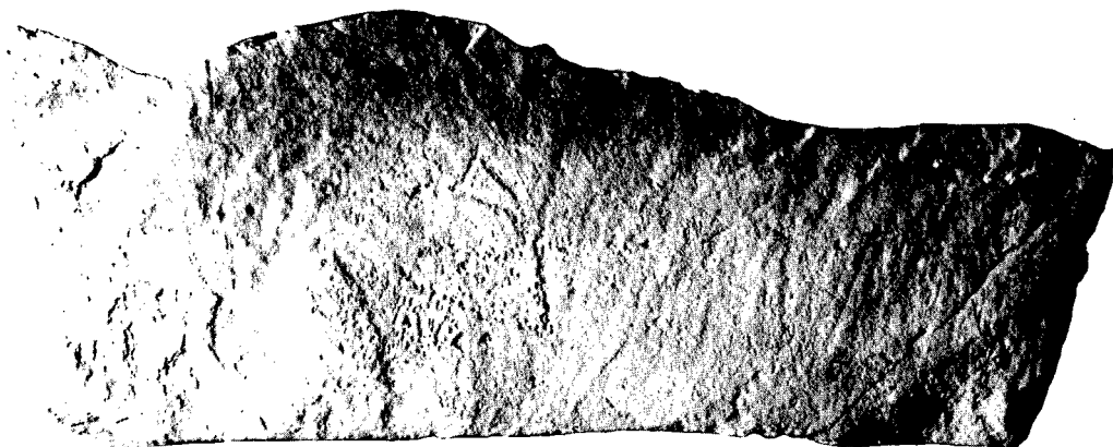
ILLUS 1 Kilbride, Mid Argyll: decorated slab

In early April 1982 the site was visited by the second writer in the course of the preparation of the sixth volume of the Inventory of Argyll , and the disturbed remains of a cist were discovered. The cist had been aligned NNW–SSE but only the north-north-west end-slab remained in position, the other three slabs and the capstone having slumped into the gravel workings; the cist had measured about 0.8 m by 0.5 m internally and 0.45 m in depth. The capstone measured 1.3 m by 0.85 m and up to 0.23 m in thickness. The slab on the east-north-east side (1.1 m long by 0.44 deep and 0.16 m thick) is of grey schist (probably erratic, but certainly originating from the local country rock, the Craignish Phyllites) and has been decorated with two certain and one possible triangular motifs: one is an