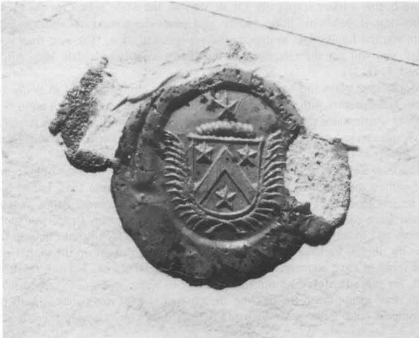
ILLUS 2 One of Moray's heraldic seals, bearing the arms of Moray of Abercairney. From a letter of 1655 (RS Letter Book, no 23)

Sometimes Moray uses the pentacle in place of a signature (eg, Hamilton Mss, C.1.2067;