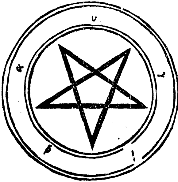
ILLUS 5 The pentacle surrounded by Greek letters derived from it, as illustrated by Henry Cornelius Agrippa, 1533