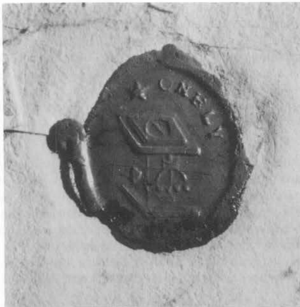
ILLUS 6 Moray's 'Compass' Seal. From a letter of 1665 (RS Letter Book, no 13)

unidentified symbol or hieroglyph. On the side is a heart, and on the top a magnetic compass is housed in a circular recess. Above appears a five-point star, to which the compass needle points, and the star is followed by the inscription Onely .