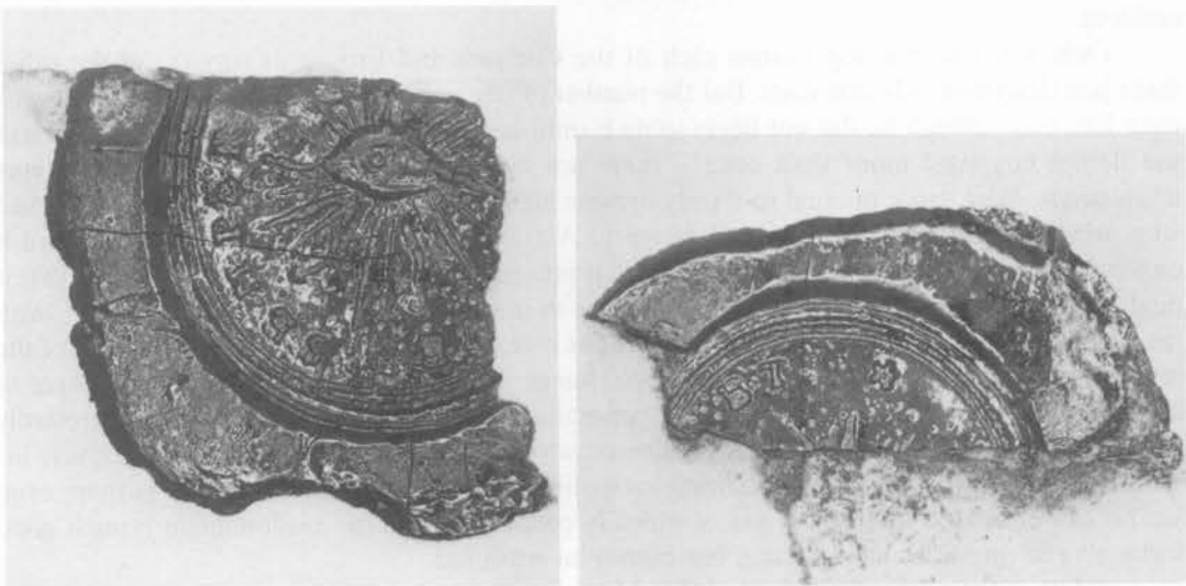
ILLUS 8-9. The surviving fragments of an impression of Moray's 'Sun' Seal. From a letter of 1672 (Essex Ms)

Finally, there survives from December 1672 a seal impression showing a large cube or dice, with a star on each of the three visible faces. Above is a wreath, and the inscription reads Constantia followed by a star (illus 10). The cube with the same symbol on each face symbolizes constancy; whichever way it falls, it looks the same, and the symbols themselves are unchanging, for the stars in the sky were thus regarded. In the letter which this seals Moray was concerned to express his continuing friendship for the earl of Tweeddale, with whom he had had some misunderstanding, so the seal may specifically refer to the constancy of friendship; this is the only