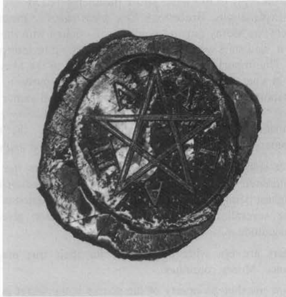
ILLUS 3 Moray's 'Mason Mark' Seal. From a letter of 1669 (Lauderdale Mss, Add 23,132, f.128v)

of letters ignore them. 6 The great majority of correspondents used heraldic seals displaying their coats of arms and/or crests, though classical busts or figures are not unusual. Very occasionally seals occur which fall outside these groups. Thus Simon Stevin, the Dutch quartermaster-general, proudly had his seals engraved with a diagram illustrating the law of inclined planes which he had discovered ( DSB , XIII, 47–51). But the present writer has seen nothing comparable to Moray's symbolic seals elsewhere in 17th-century correspondence, and the large collection of seal impressions assembled by Elias Ashmole provides no parallels (Ashmole Ms).