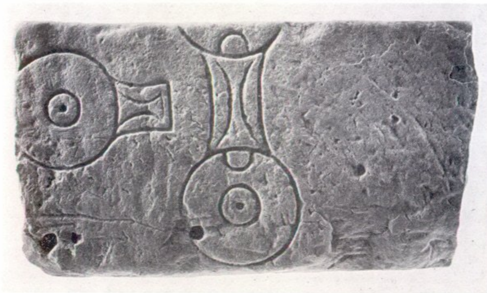
Westfield Farm, Falkland, Fife: Pictish symbol stones