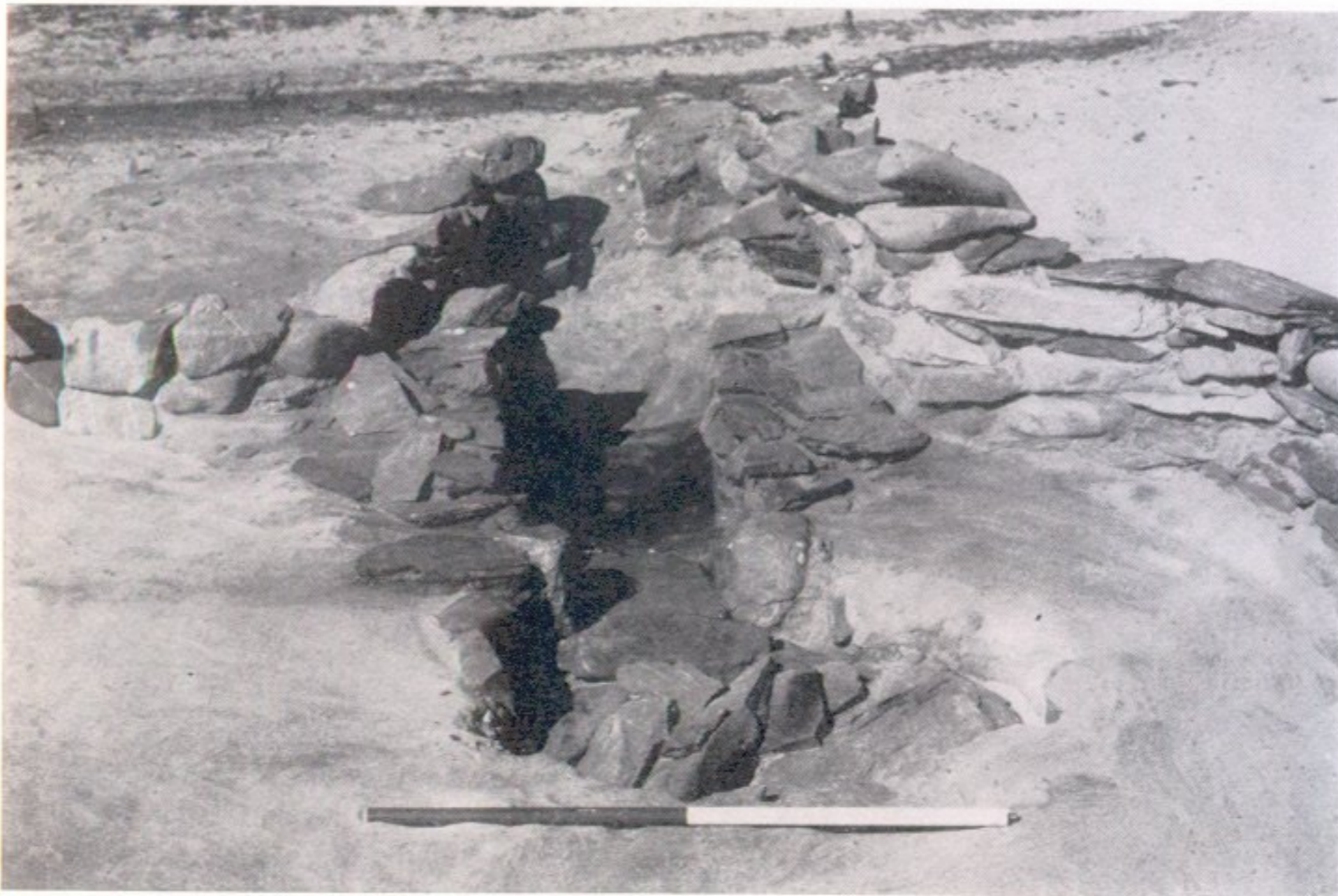
b Machrins, Colonsay, Argyll; kiln, showing flue