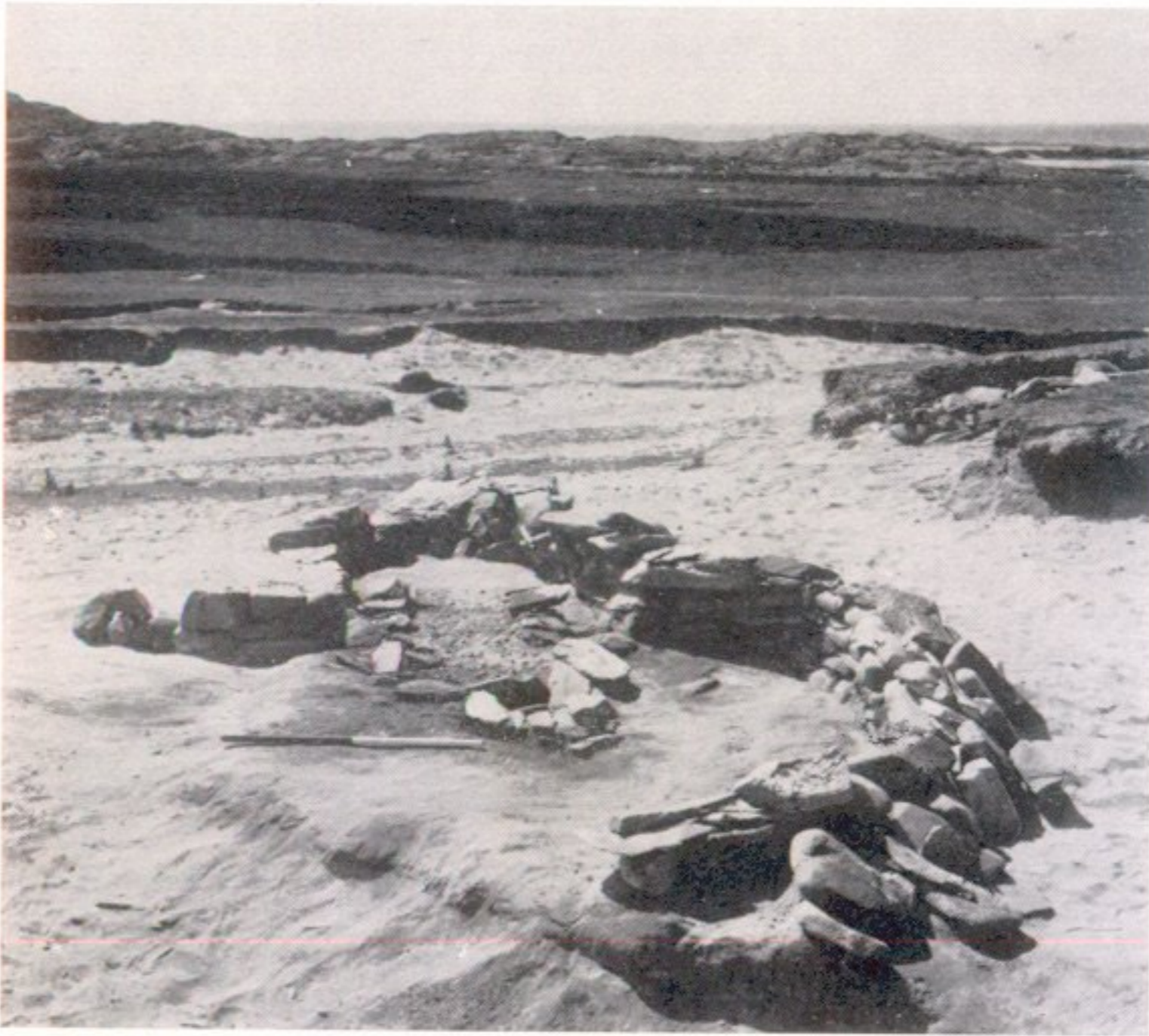
a Machrins, Colonsay, Argyll; kiln, general view