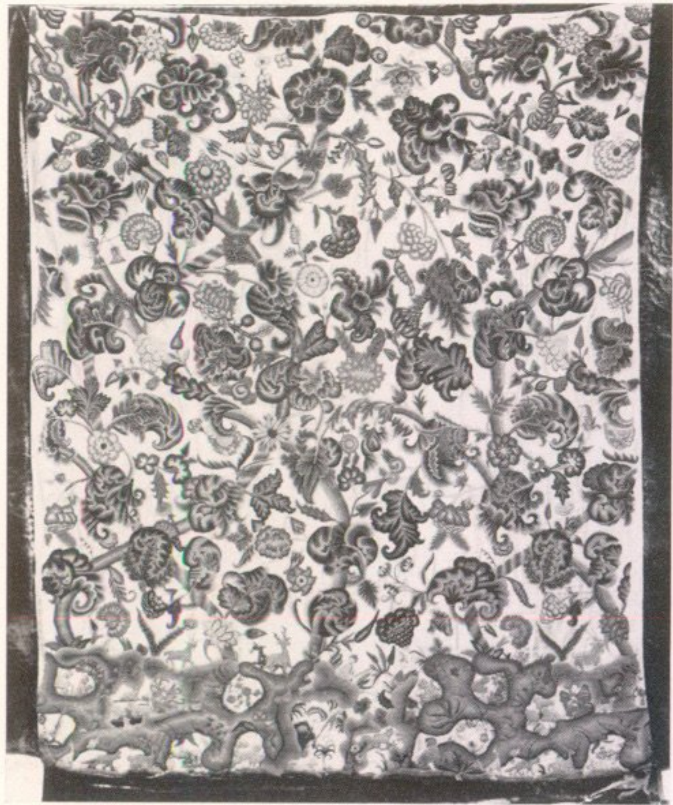
a The Cullen embroidery