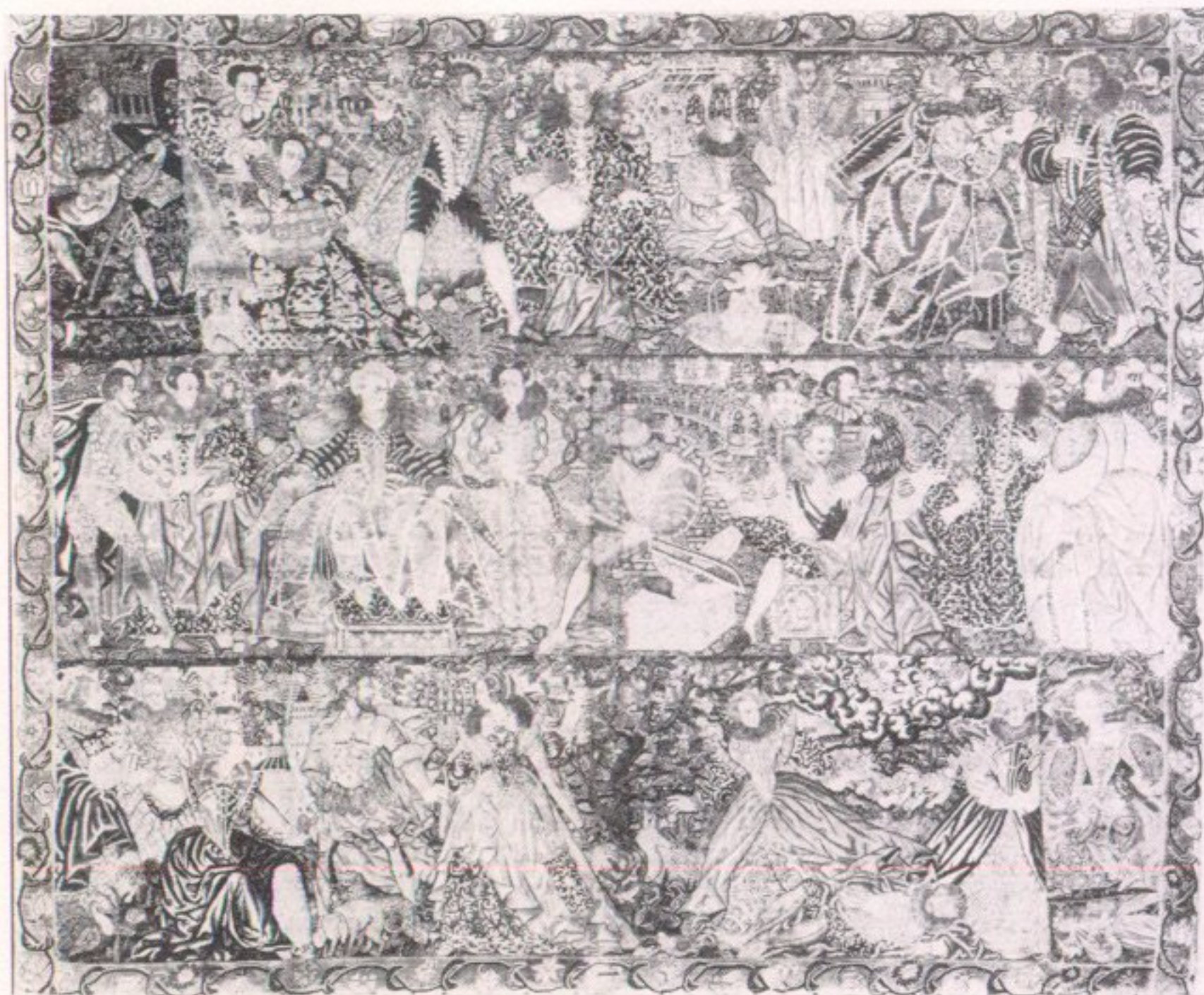
a The Morton valances