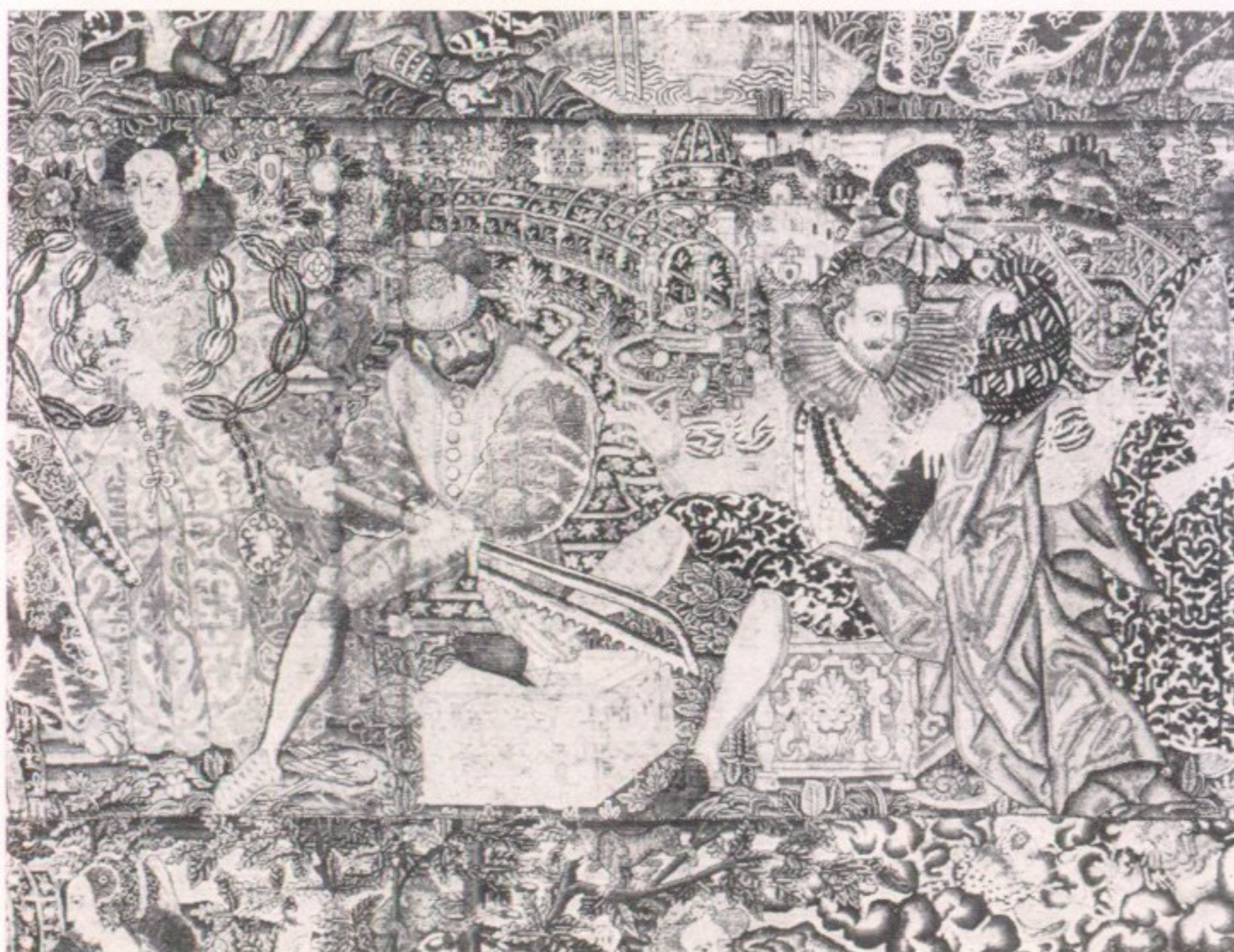
b Detail of the centre valance