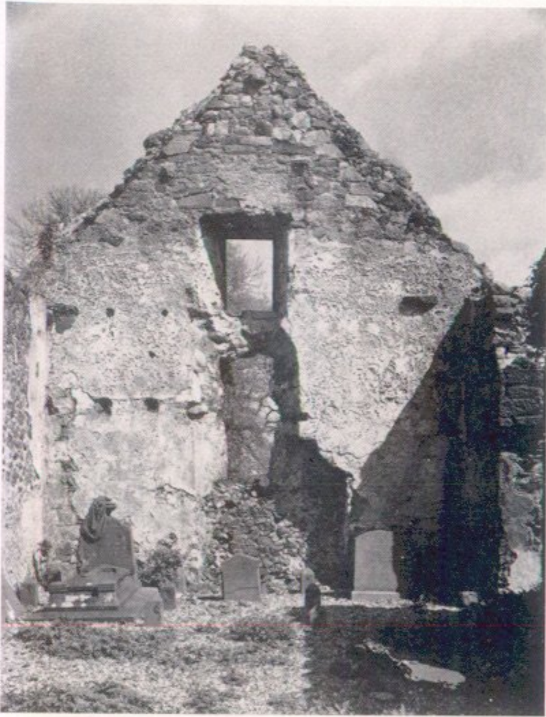
a Inner face of E gable wall