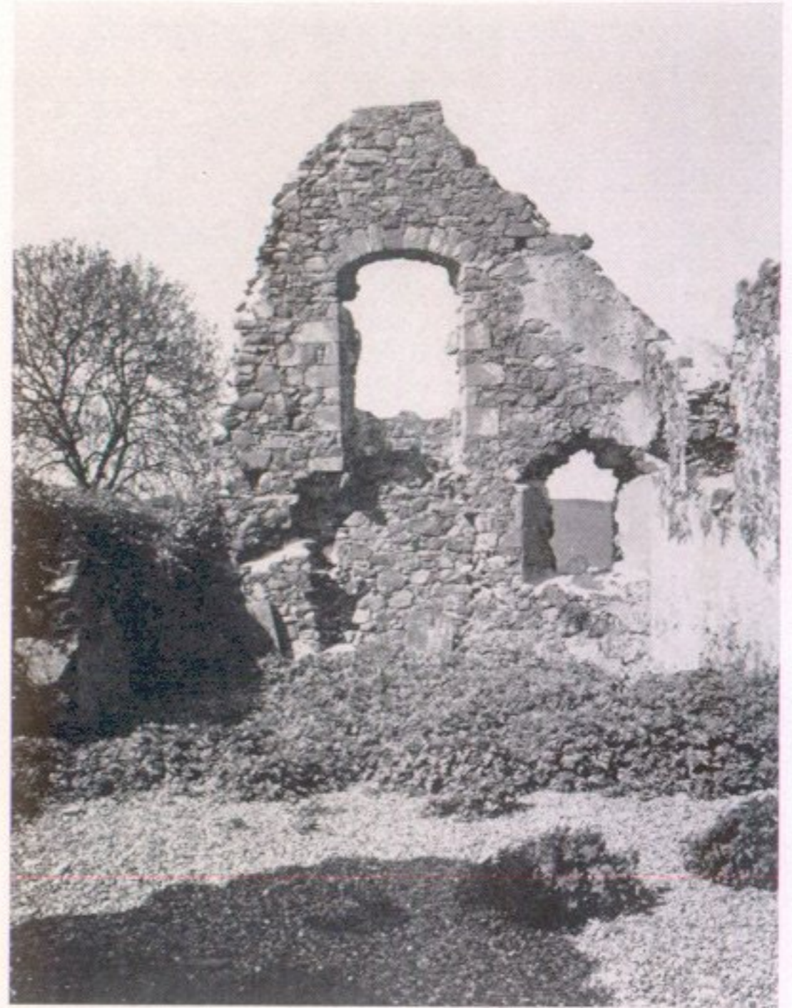
b Inner face of W gable wall