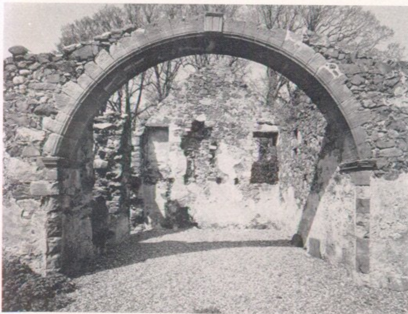
c Transeptal arch and interior of N aisle with Laird's entrance, fireplace and cupboard recess in N wall