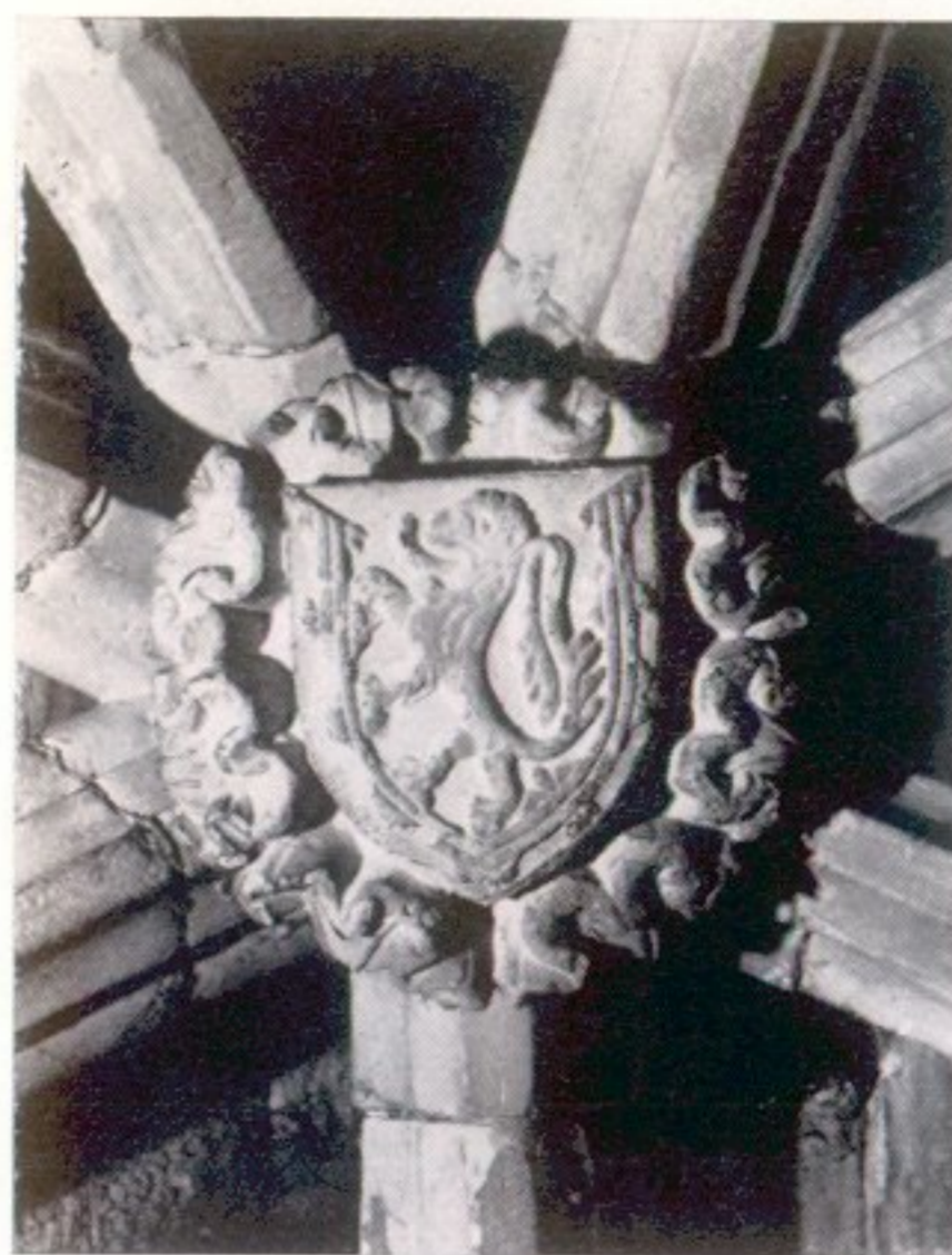
b Boss in choir of Seton Collegiate Church