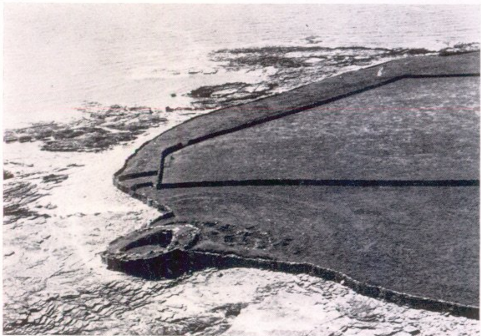
The Broch of Burrian, North Ronaldsay, from the E