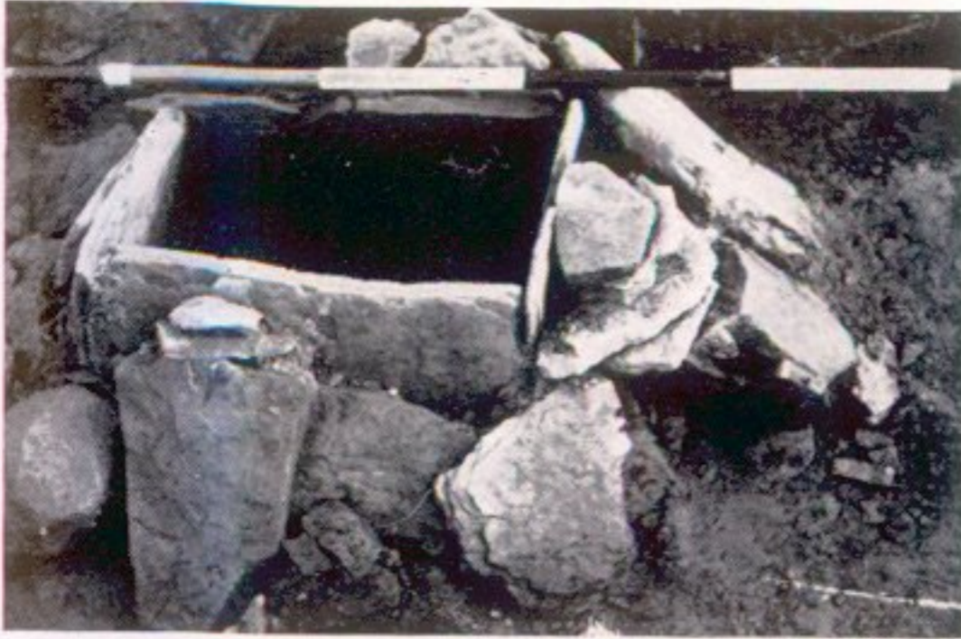
a Summersdale cist (scale in ft)