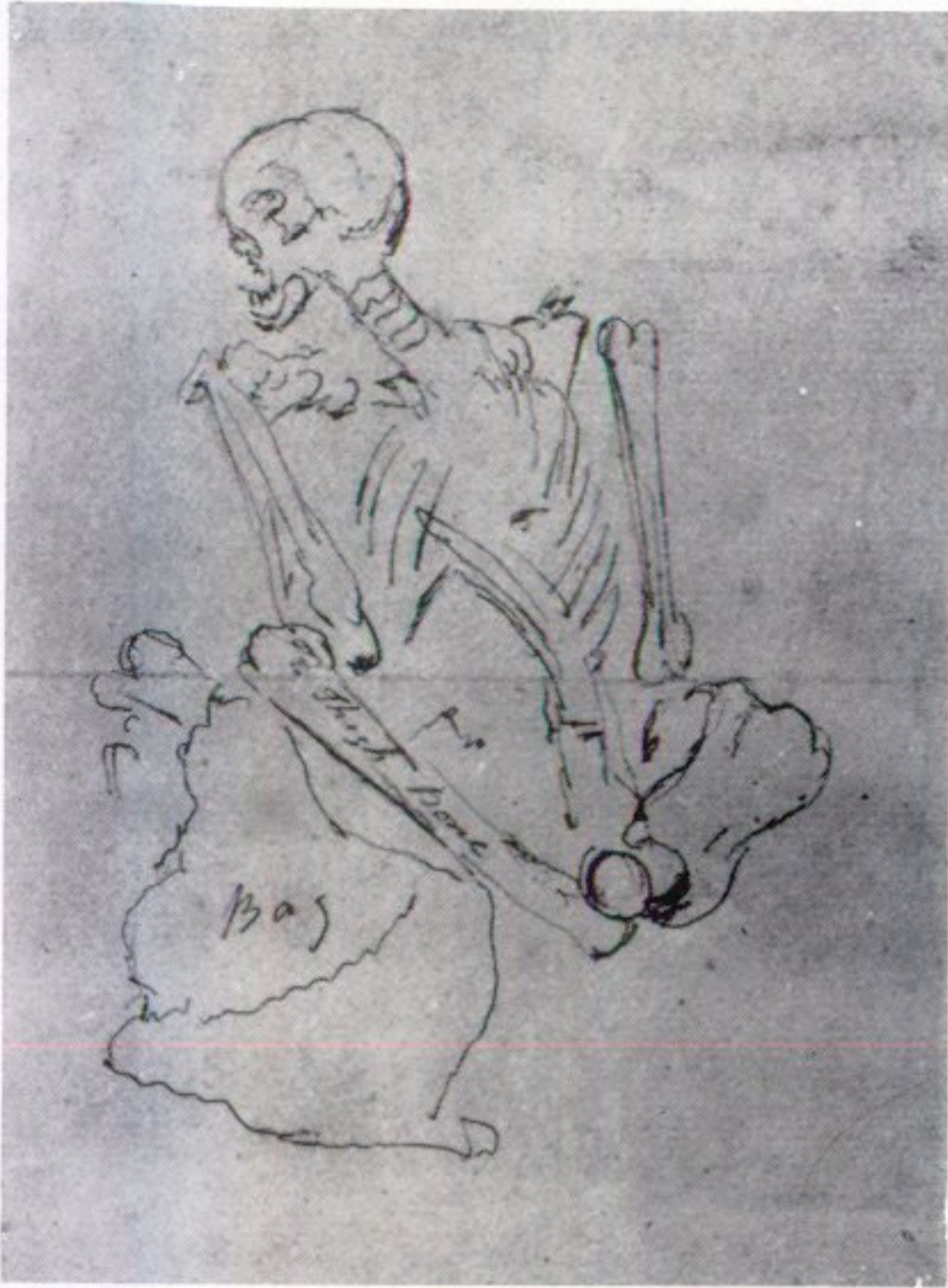
Skail grave