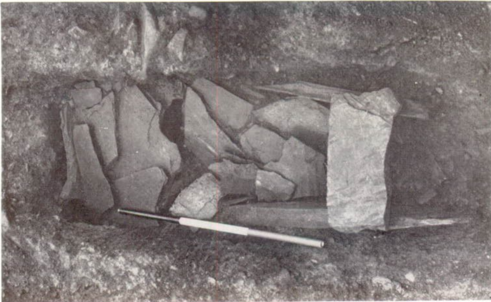
a Cist, with cover slabs