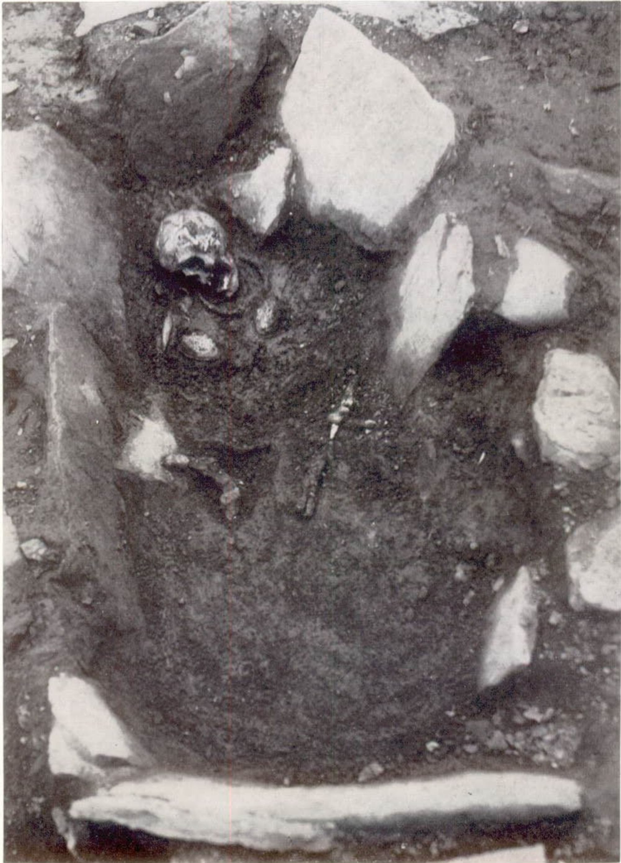
Burial and grave-goods in position