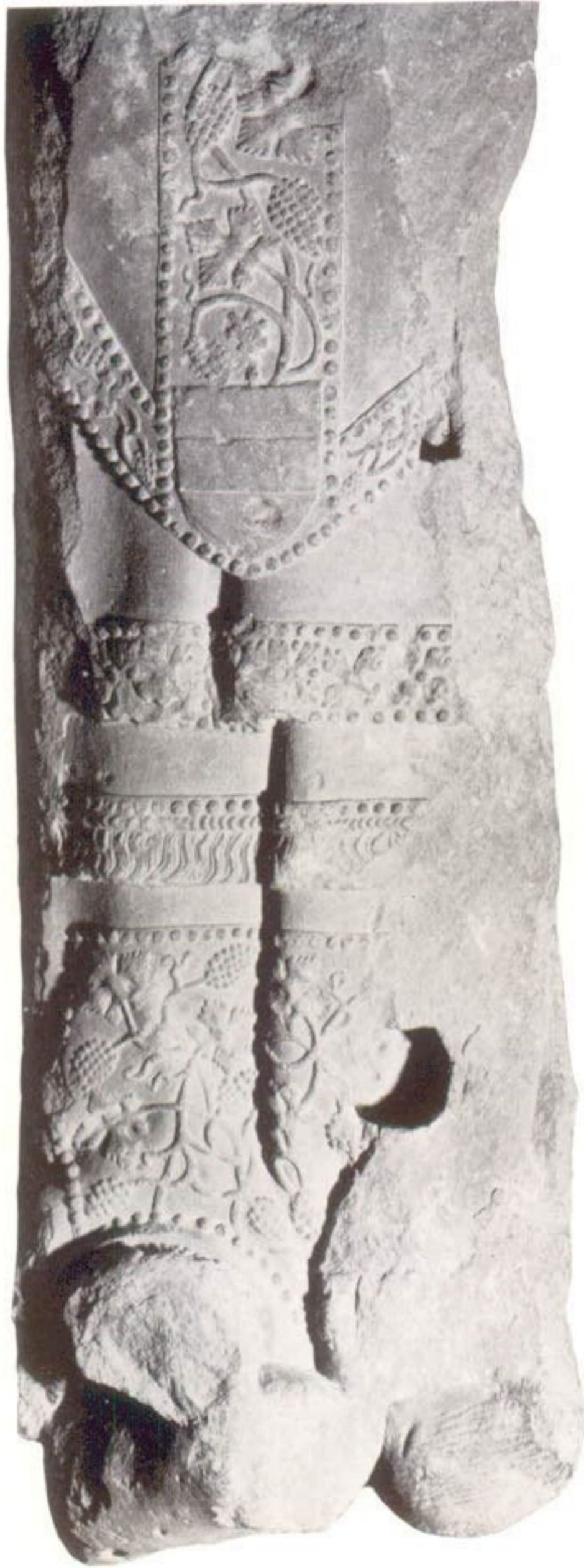
Effigy cut to form lintel