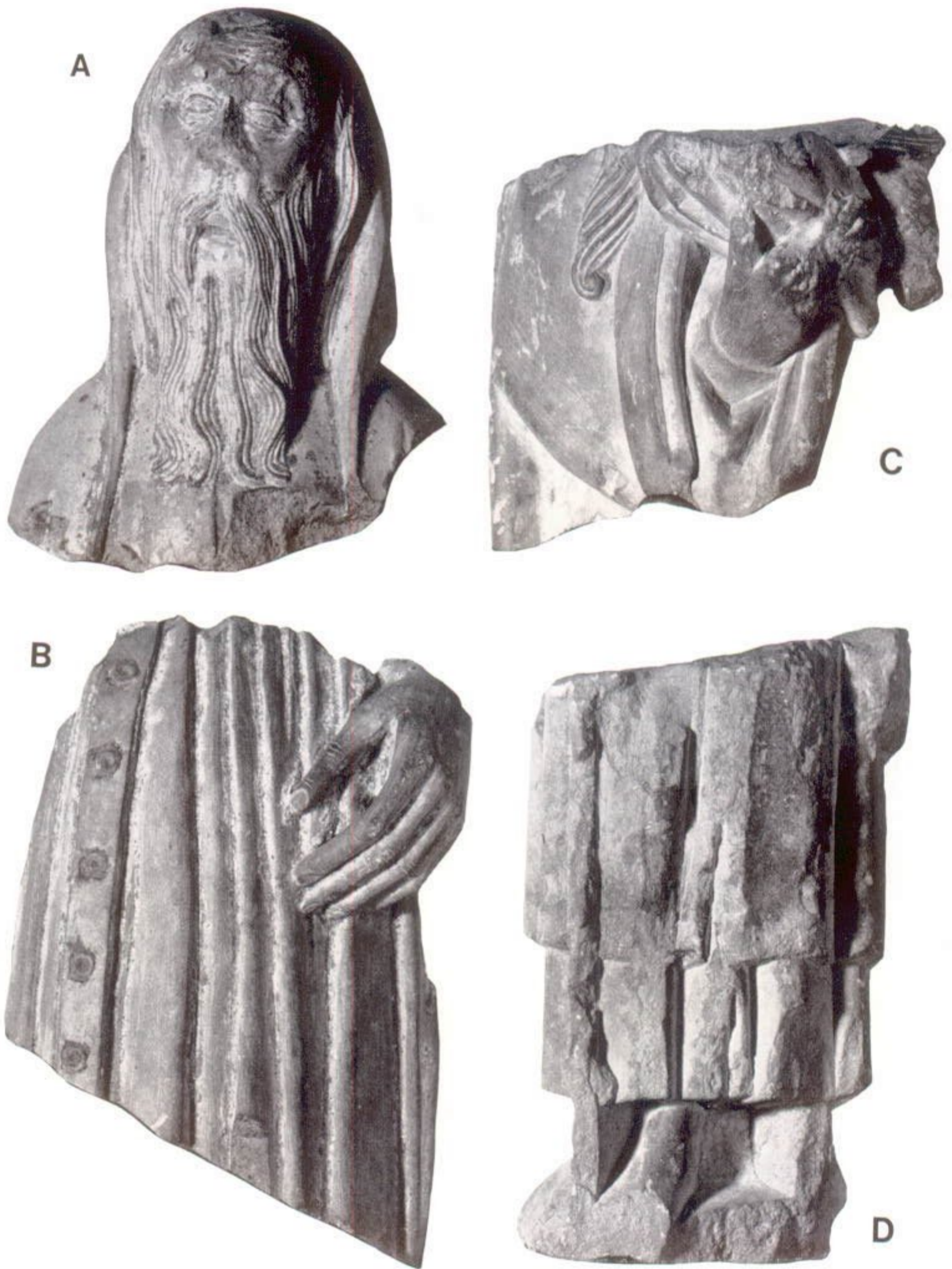
Figure sculpture