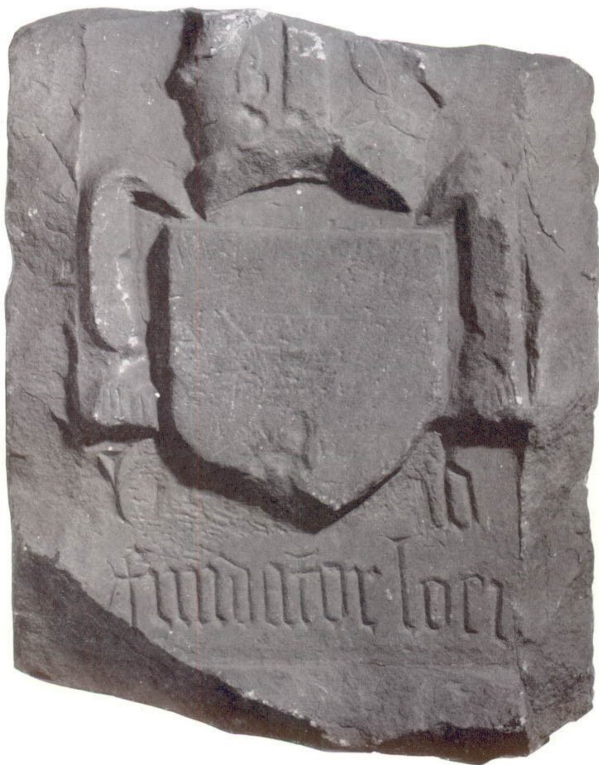
Heraldic panel showing the arms of Bishop Henry Wardlaw