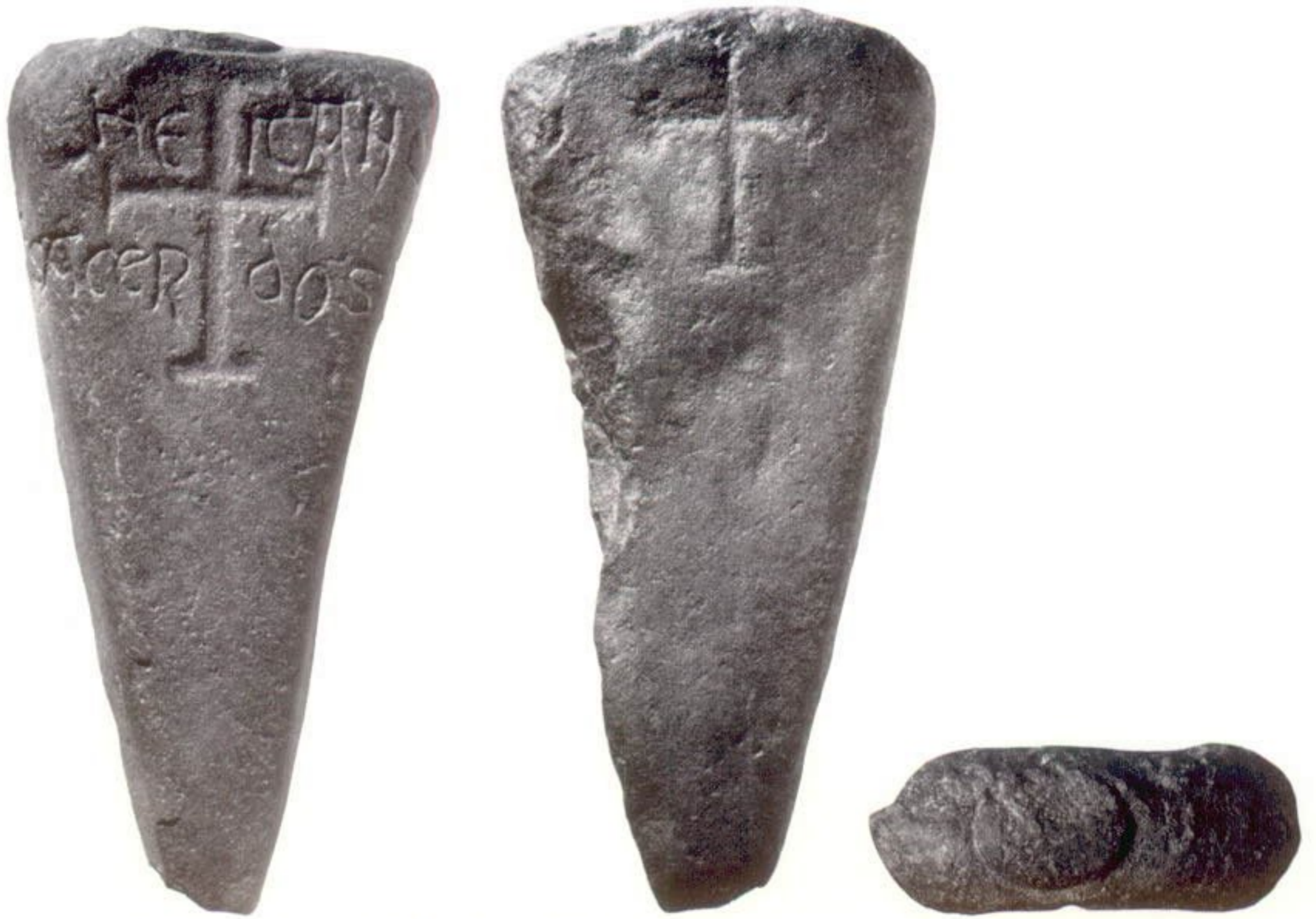
a Early Christian tombstone, Peebles; front, back and top