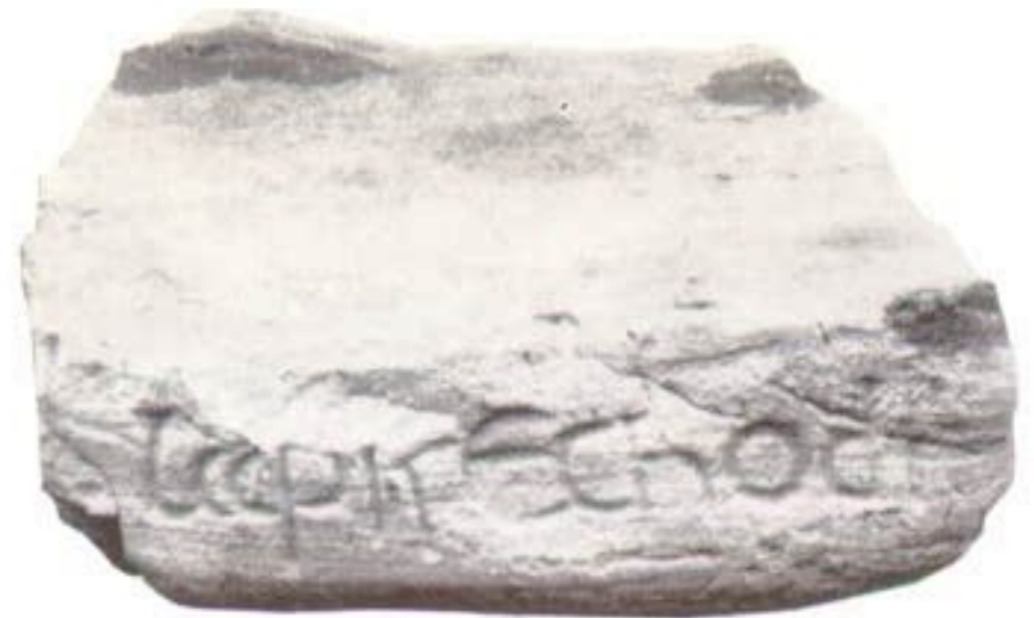
b Early Christian 'grave-marker', Iona; front and top