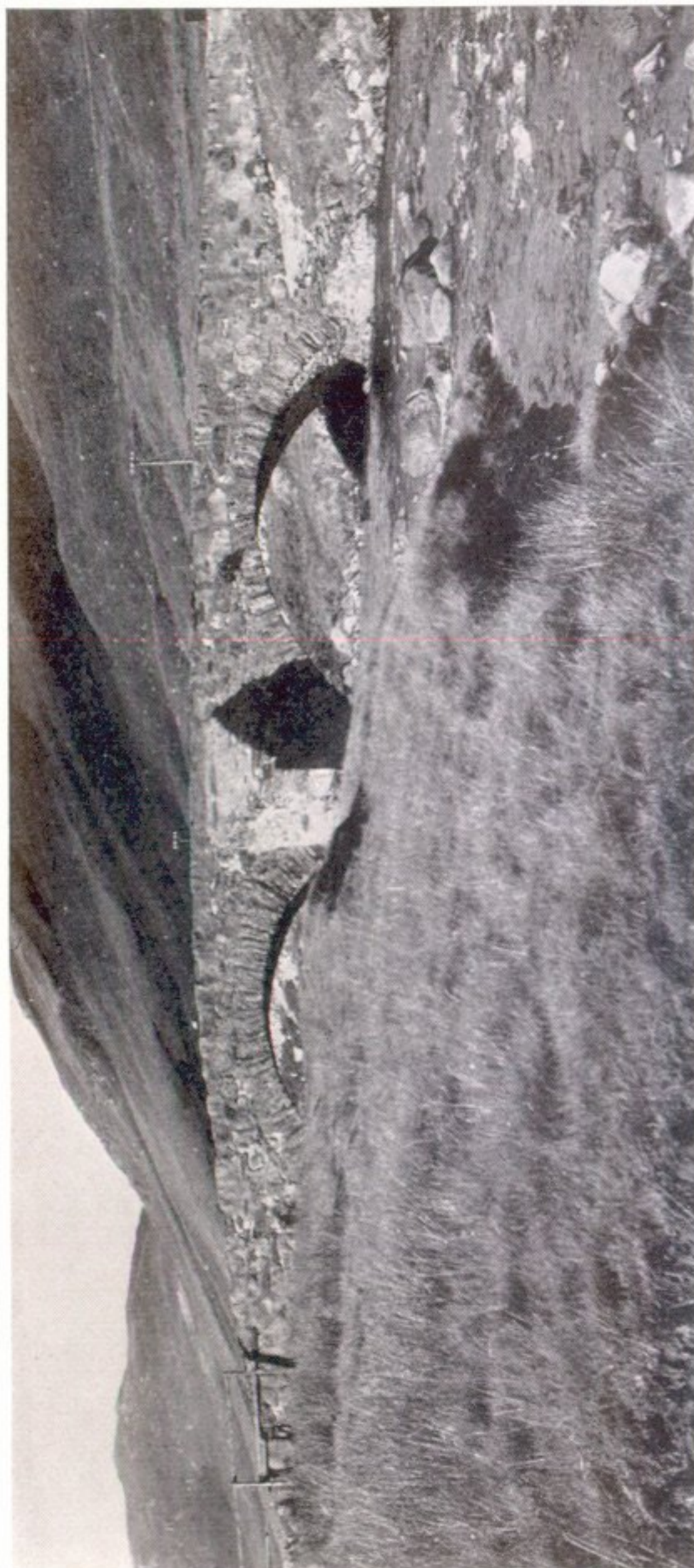
3. Fraser's Bridge, from upstream