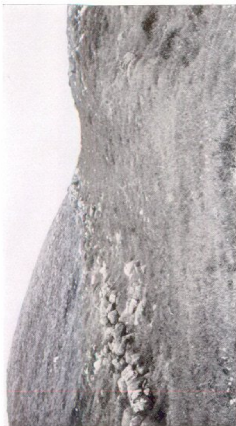
2. The road north of Fraser's Bridge