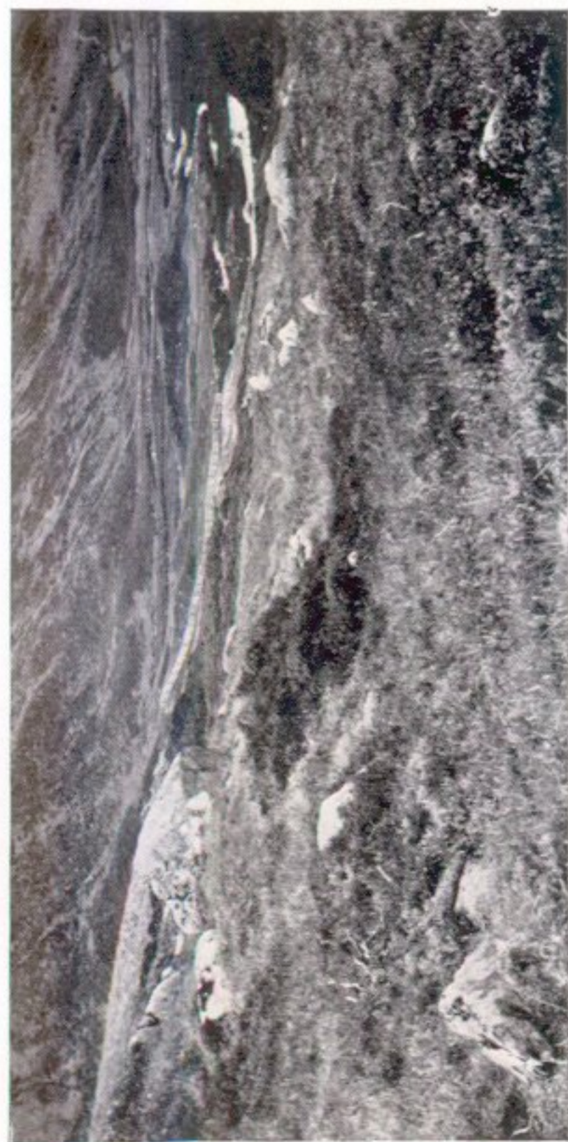
1. The short cut beside Allt a' Choire Dhirich