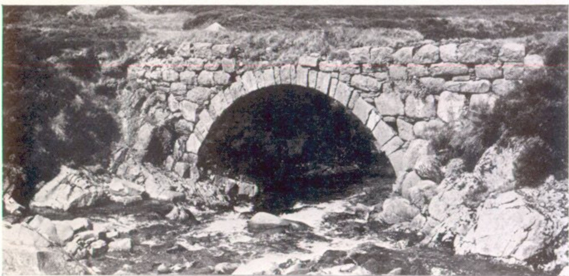
2. Bridge over the upper Cairnwell Burn, from upstream