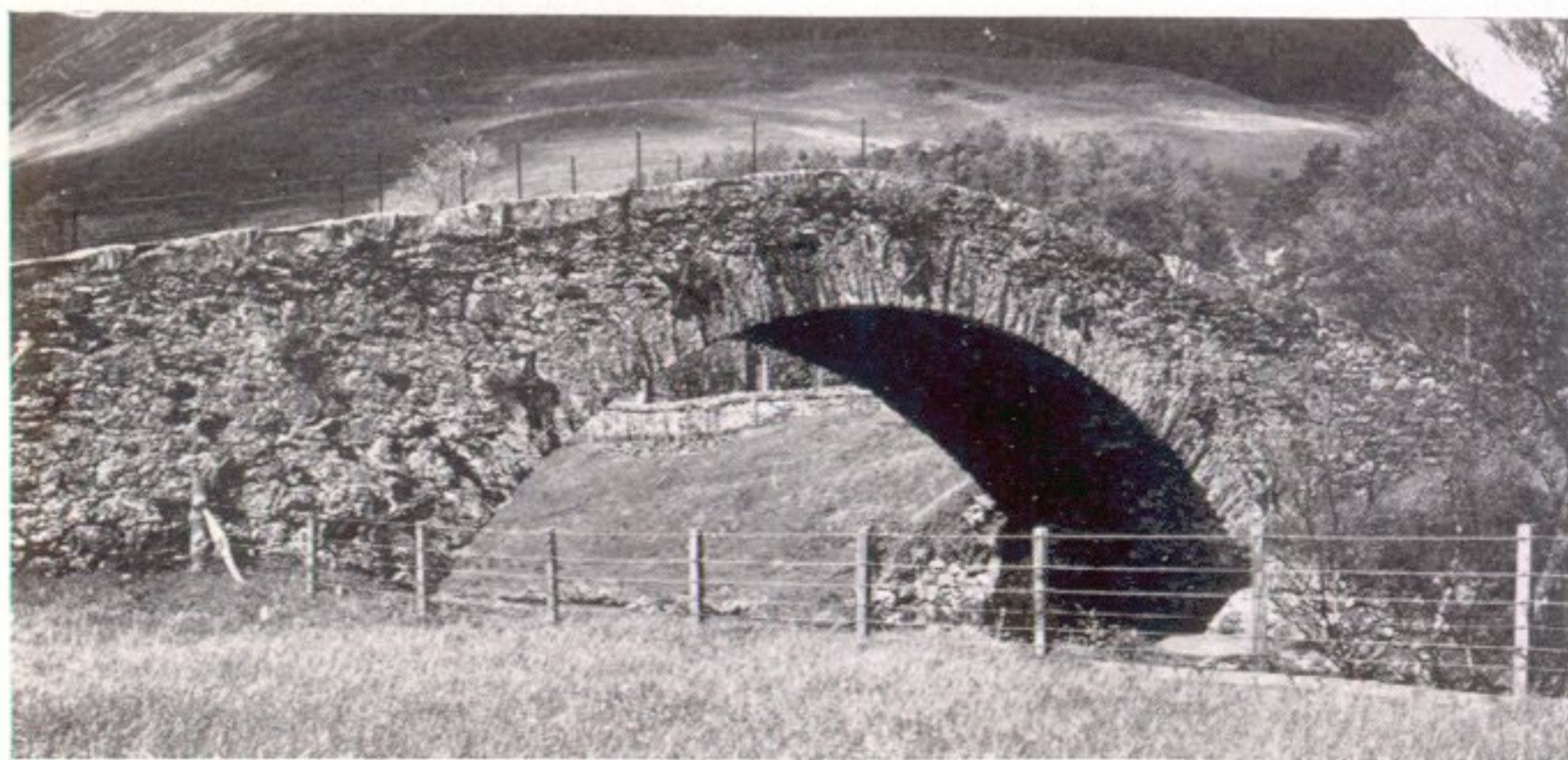
3. Spittal Bridge, from downstream