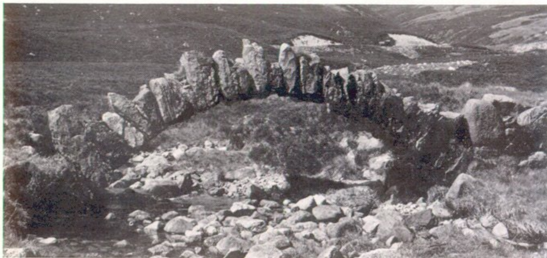
1. Fragment of bridge over Allt a' Choire Dhirich