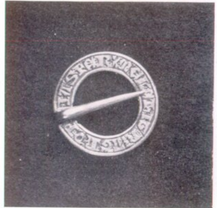
Above, the Kames Brooch, enlarged to show detail. Below, the Kames Brooch and the Islay Brooch, actual size