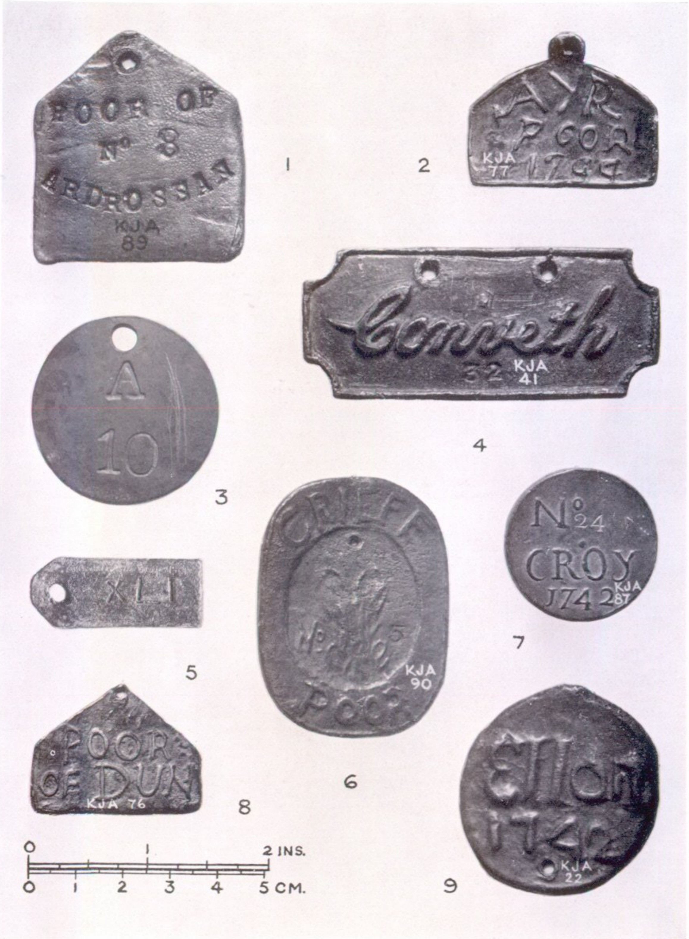
1. Ardrossan. 2. Ayr. 3. Alves. 4. Conveth. 5. Coupar Angus. 6. Crieff. 7. Croy. 8. Dun. 9. Ellon, 1742