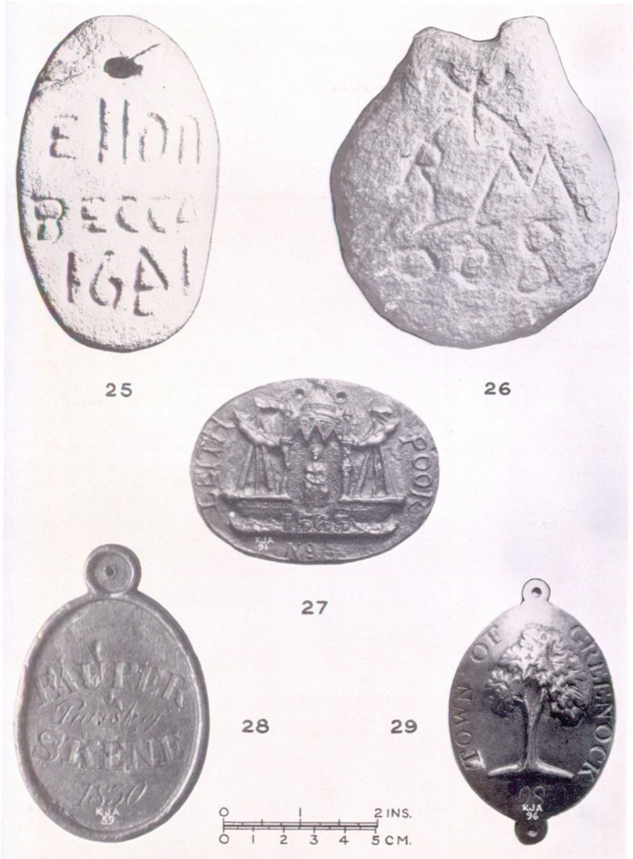
25. Ellon, 1641. 26. Ellon (?), 1668. 27. Leith. 28. Skene. 29. Greenock.