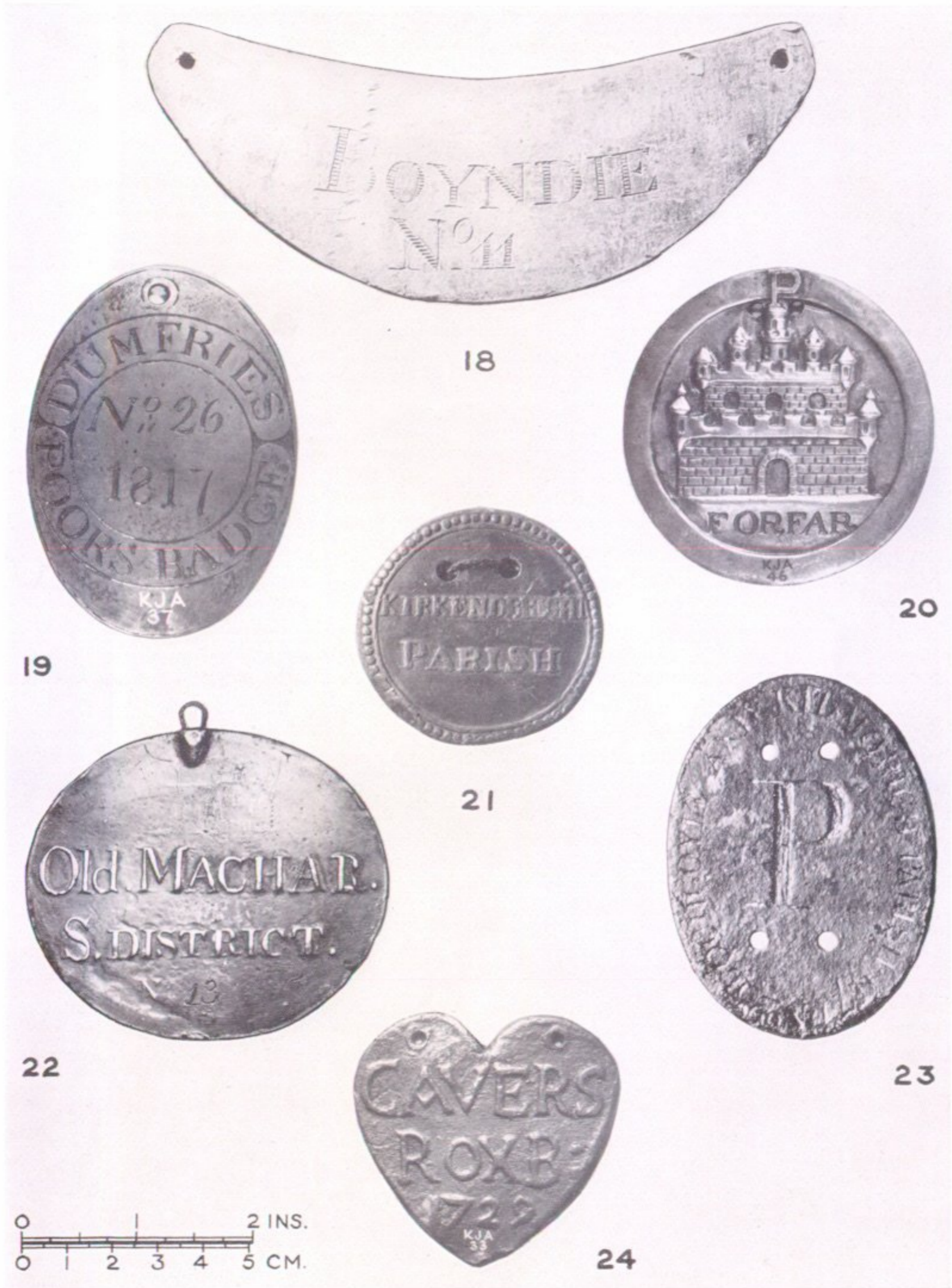
18. Boyndie. 19. Dumfries. 20. Forfar. 21. Kirkcudbright. 22. Old Machar. 23. Lochgoilhead and Kilmorich. 24. Cavers