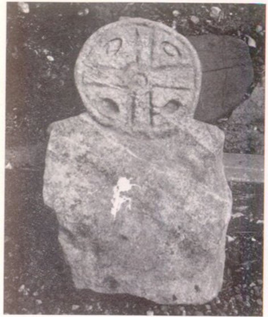
2. Small cross-slab at Millport, Great Cumbrae