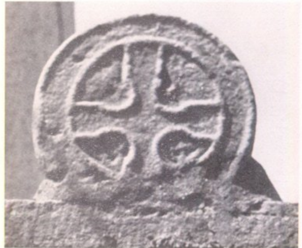
4. Cross-slab at Millburn, Millport, Great Cumbrae