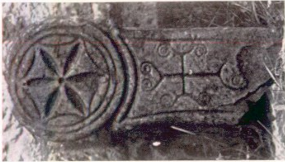
2. Cross slab at Millport, Great Cumbræ