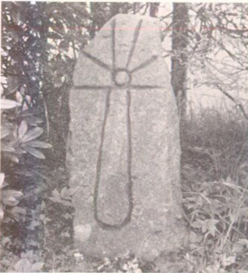
3. Cross-slab at Daltallachan, Stewartry of Kirkcudbright