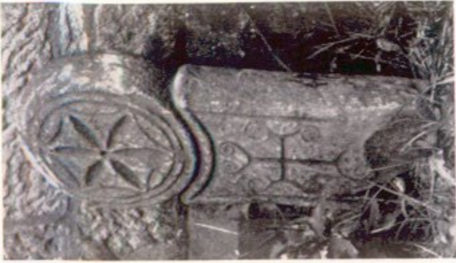
3. Cross slab at Millport, Great Cumbræ