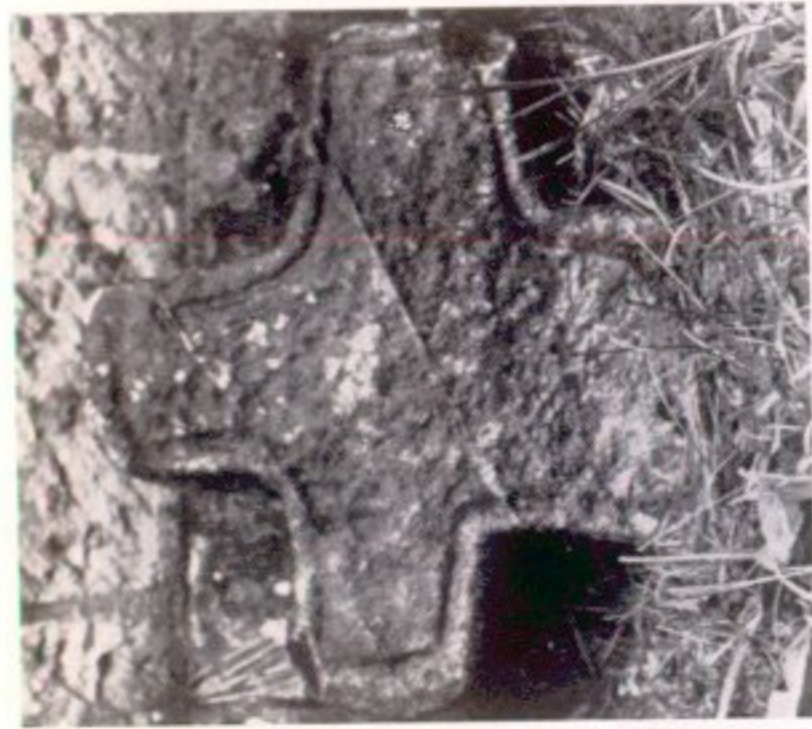
5. Cross-head at Millport, Great Cumbræ