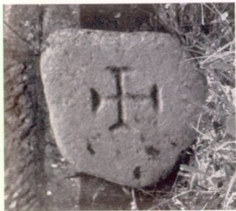
4. Small slab at Millport, Great Cumbræ