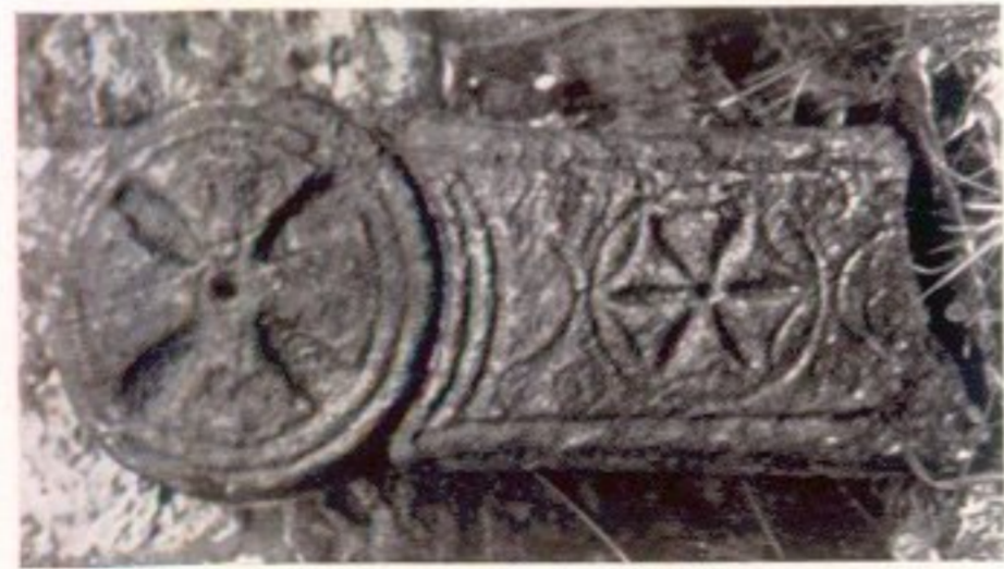
1. Cross slab at Millport, Great Cumbræ