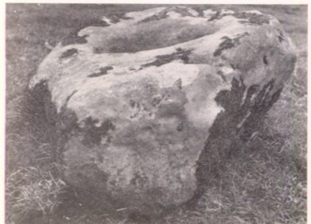
6. Carved boulder in the parish of Dailly, Ayrshire