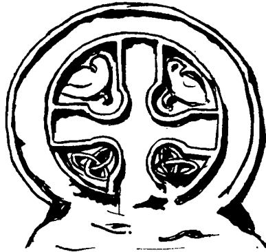
FIG. 1. Detail of cross-slab at Millburn (No. 6)

No. 6. (Pl. XV: 4 and fig. 1) was probably a similarly shaped small cross-slab, but only the disc and the top of the shoulders remain and it has been fixed with cement to the top of a wall above a doorway in the garden of Millburn. The disc is carved (in low relief), on one side only, with a cross with hollowed angles in a circular frame