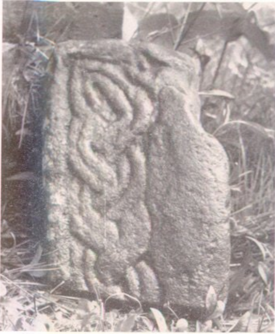
1. Fragment of slab at Millport, Great Cumbrae