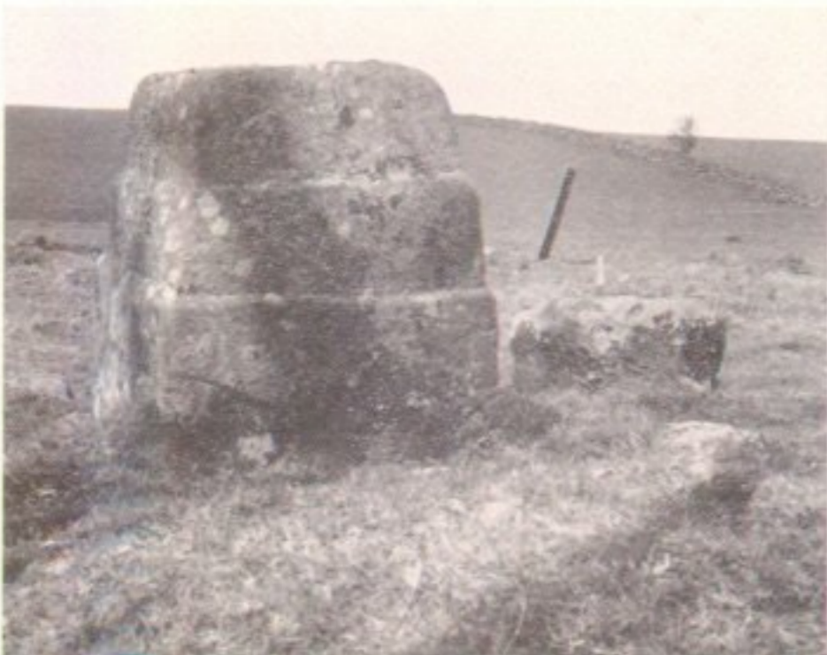
5. Cross-base in the parish of Dailly, Ayrshire