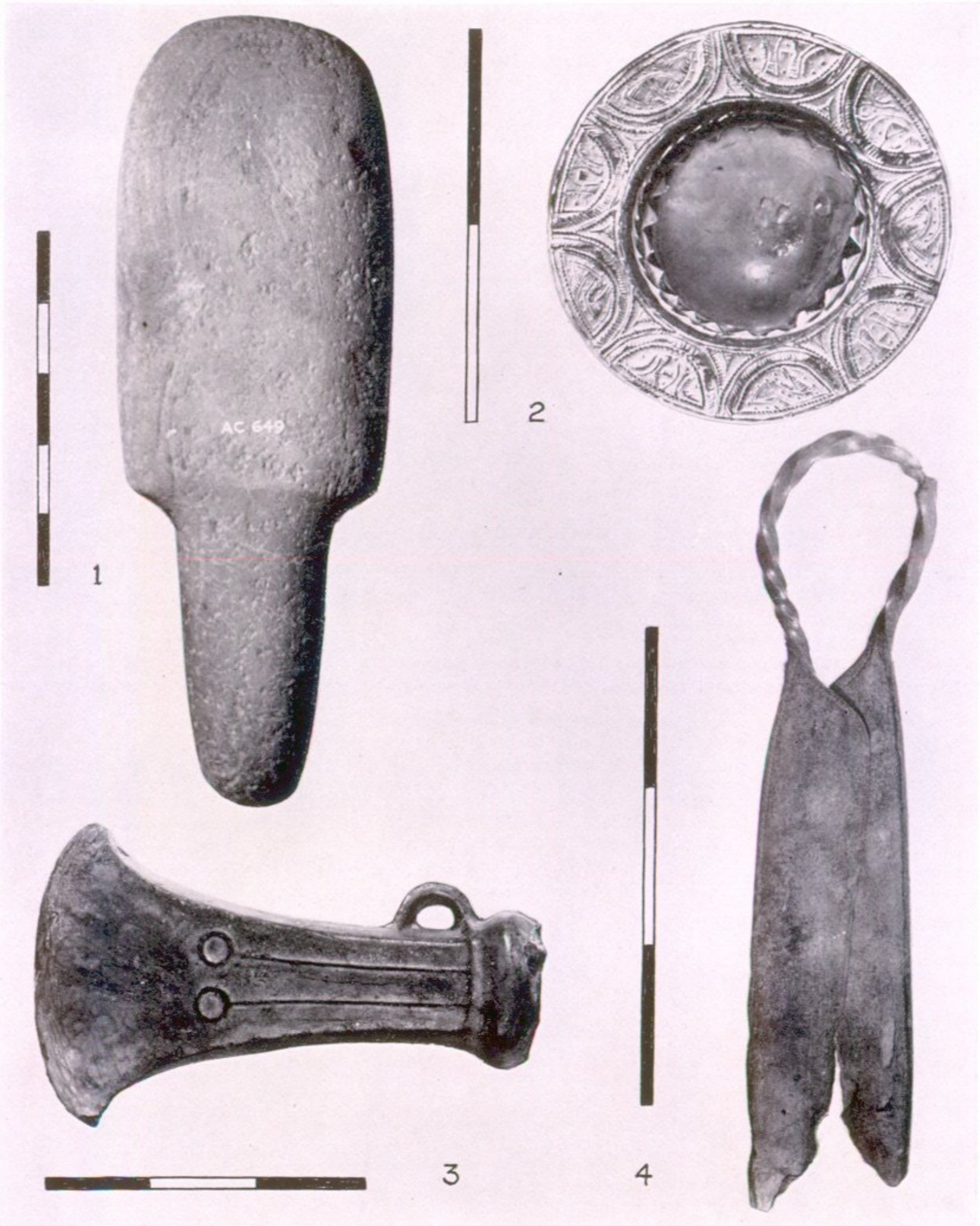
1. Stone club, Brae, Shetland. 2. Silver and crystal brooch, 16th-17th century. 3. Bronze socketed axe, Loch Glashan, Argyll. 4. Bronze shears from souterrain, Loch Erribol, Sutherland (Scales in inches)