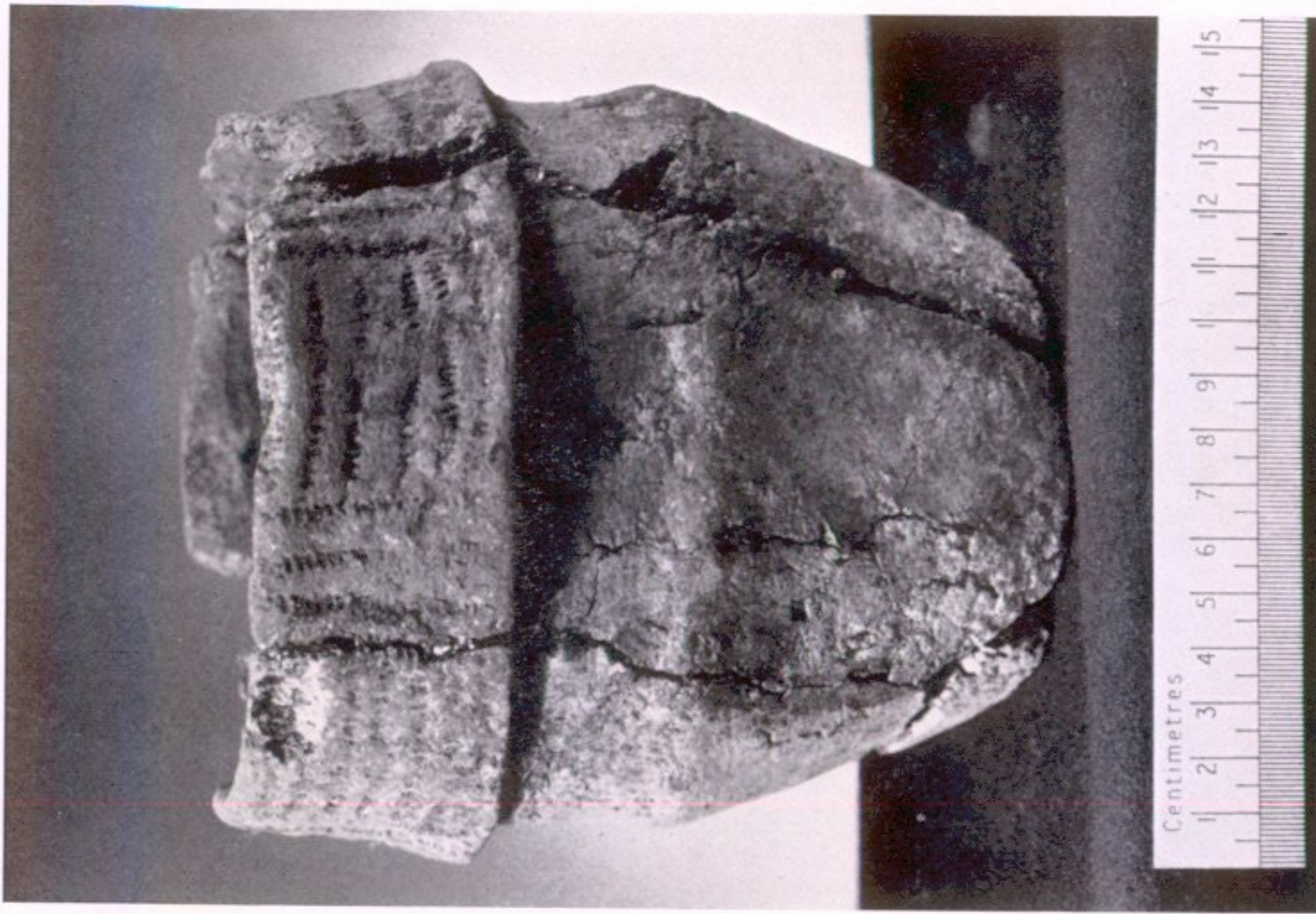
2. Collared Urn