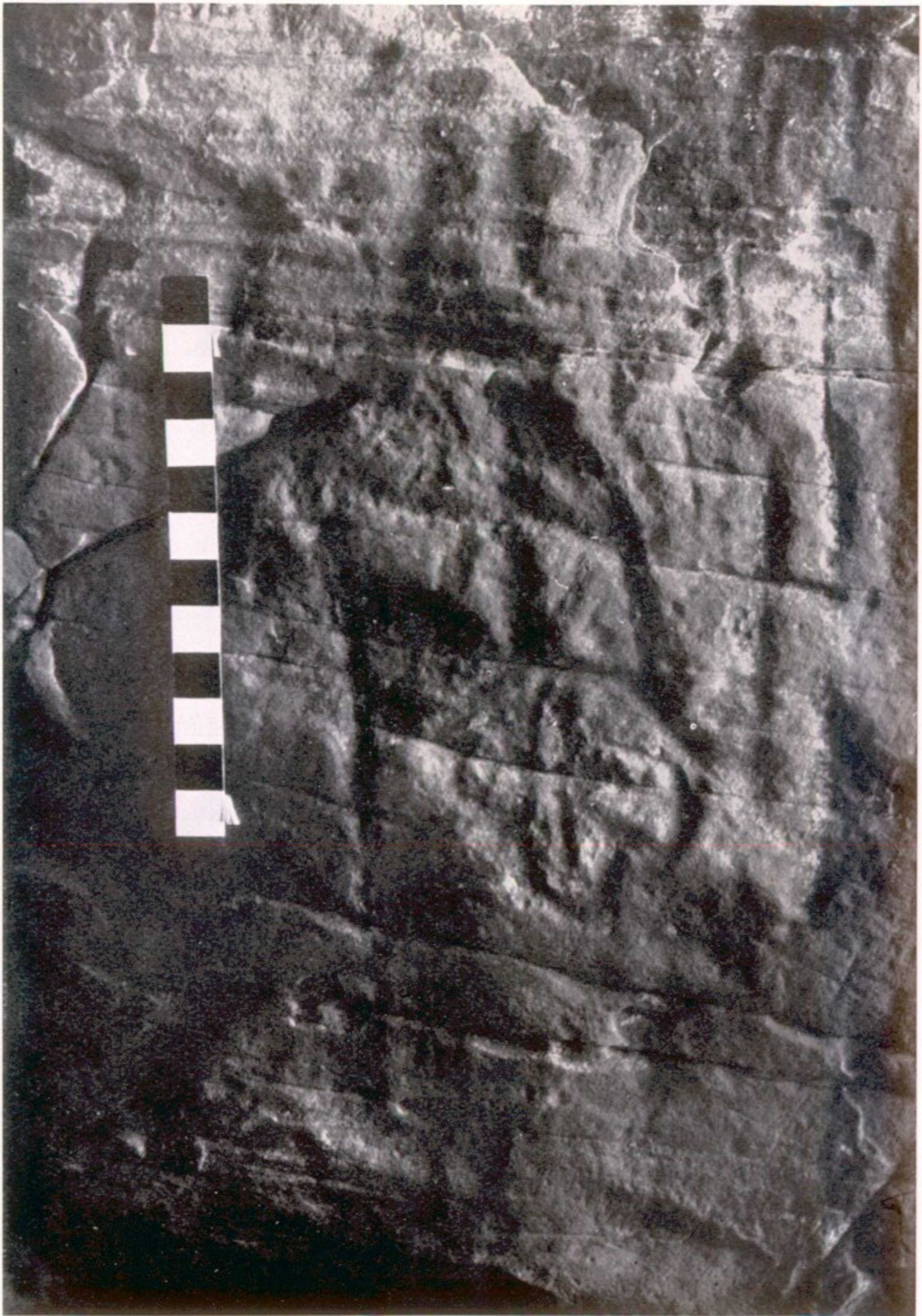
Z-rod and crosses, Chapel Cave, Caiplie (Scale marked in inches)

MURRAY: ROCK-CUT SYMBOLS IN CAIPLIE CAVES.