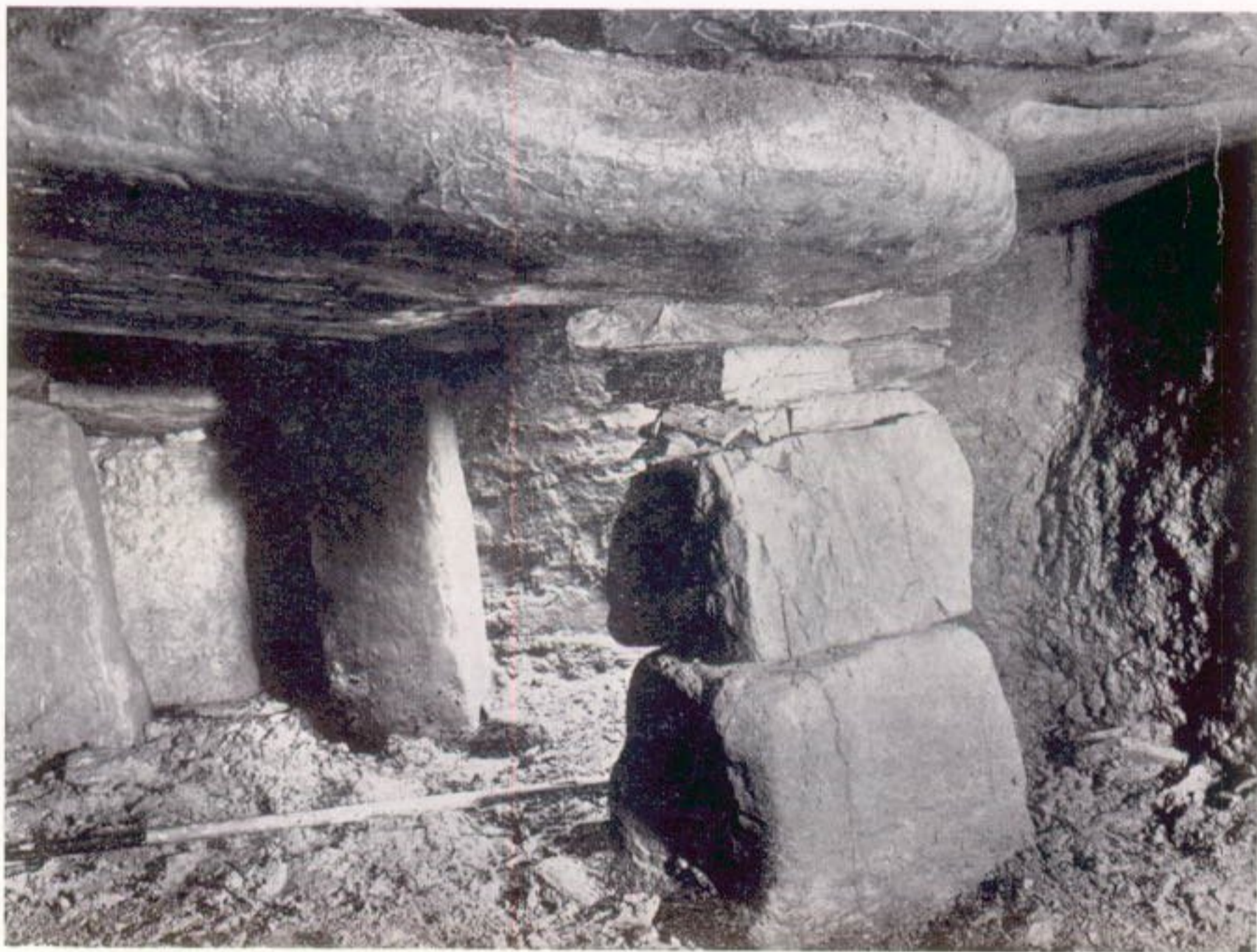
South Unigarth: Pillar A supporting the central flagstone of the roof