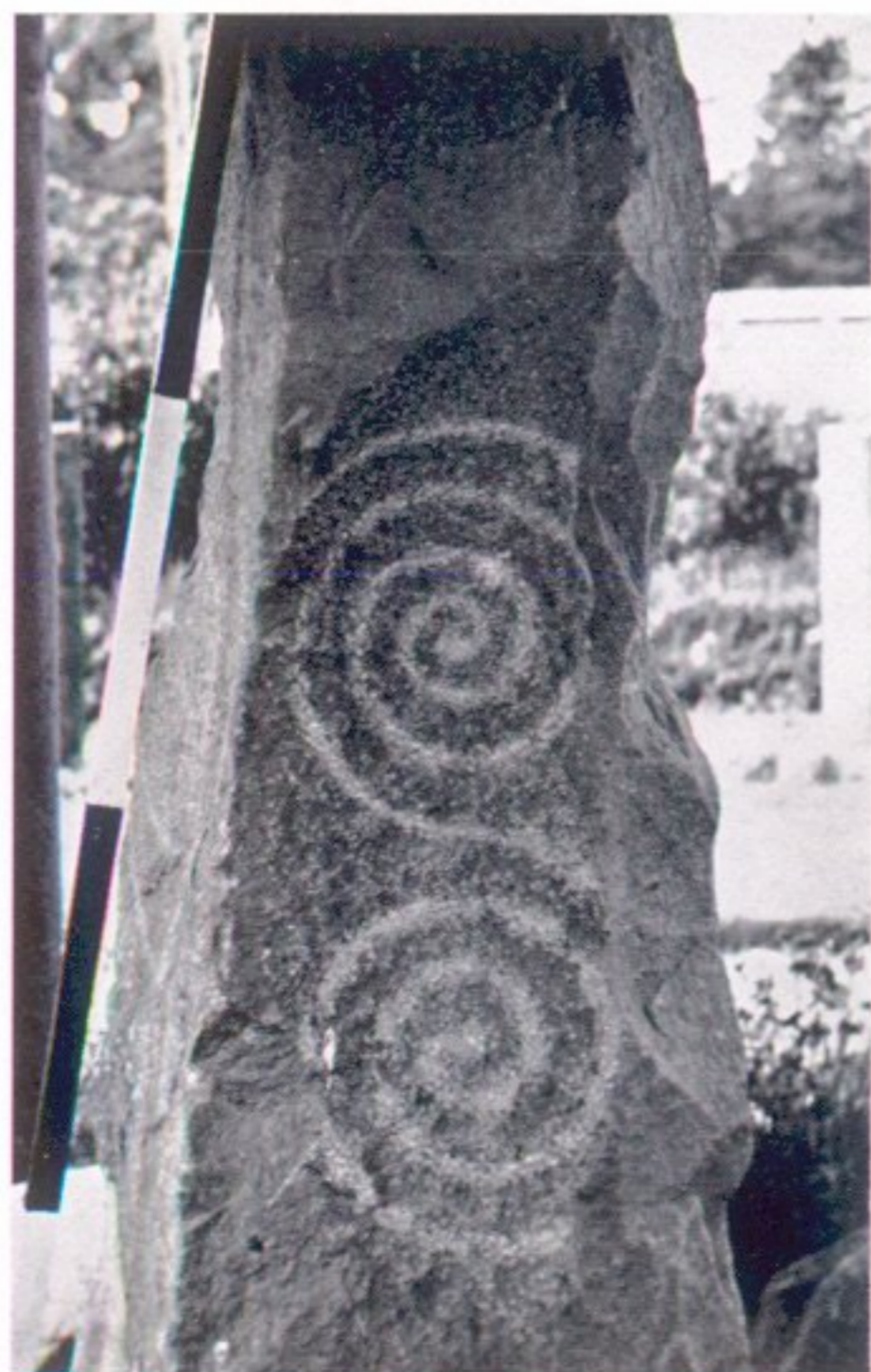
3. Blackhills, E.