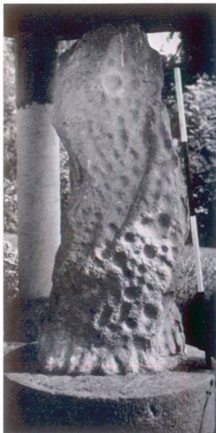
2. Blackhills, N.