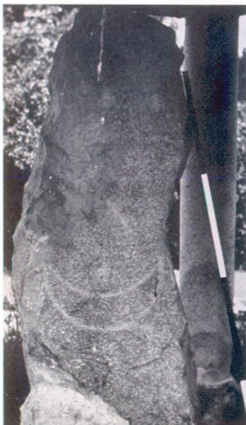
4. Blackhills, S.