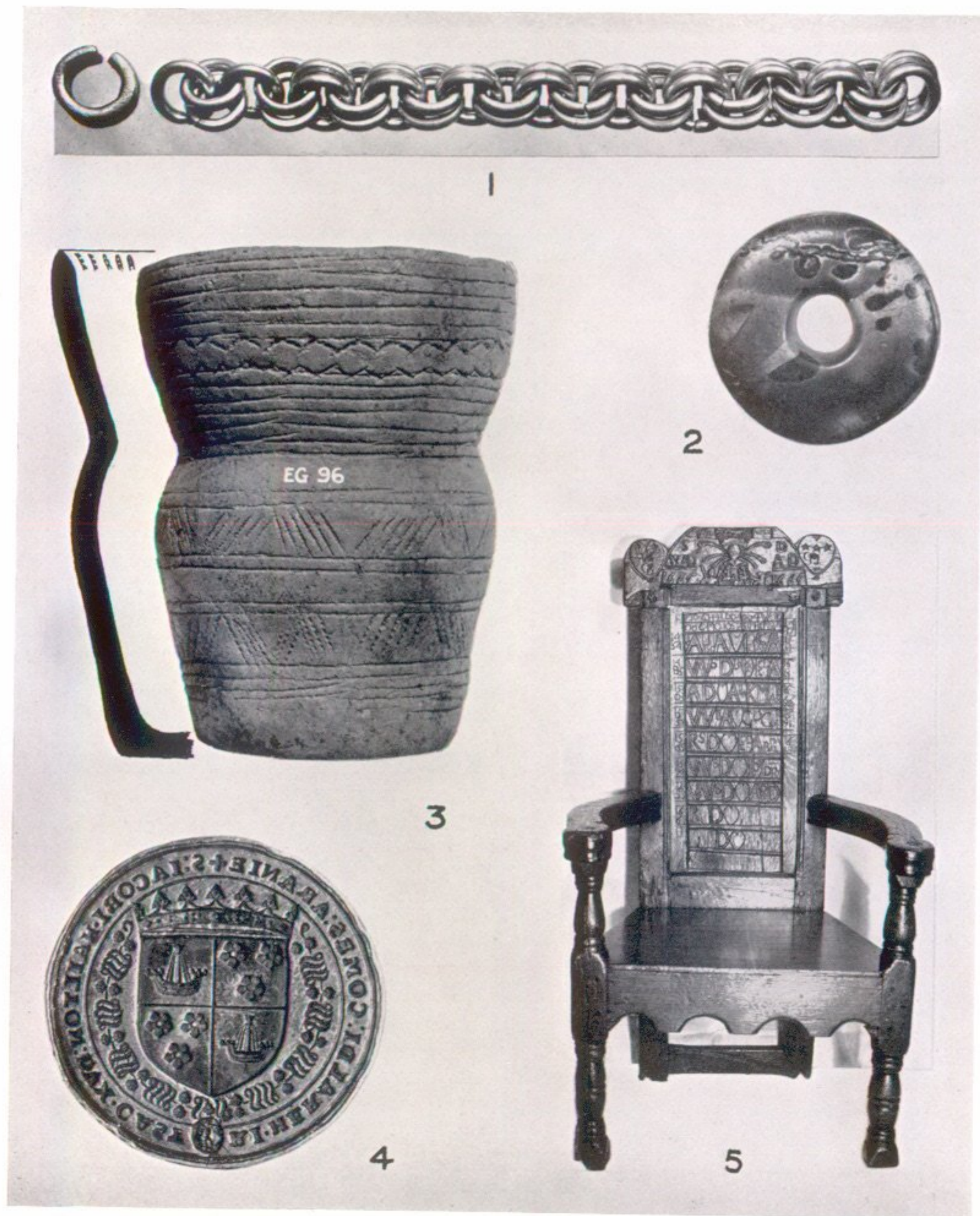
1. Pictish Chain from Walston. 2. Bauxite Bead. 3. Beaker from Knockando. 4. Seal-Matrix of the Earl of Arran. 5. Seventeenth-century Arm-chair.